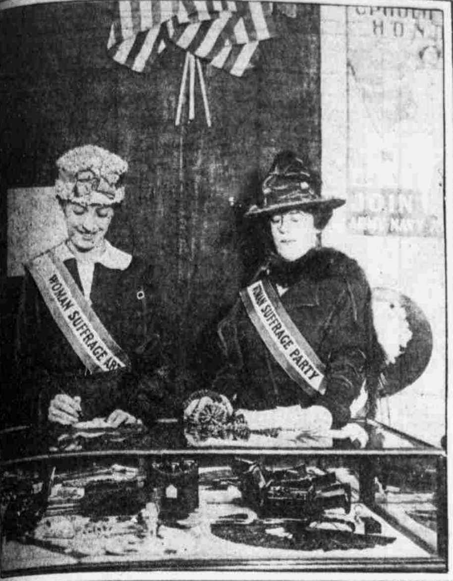
SUFFRAGISTS HOLD RUMMAGE SALE DE LUXE FOR WAR FUND Thousands of dollars were realized from the disposal in New York of treasures of gold, jewels and gowns donated by ardent workers for the ballot.