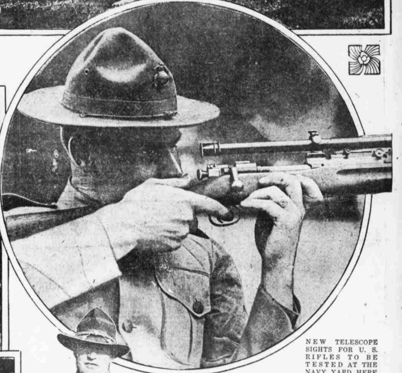
NEW TELESCOPE SIGHTS FOR U. S. RIFLES TO BE TESTED AT THE NAVY YARD HERE