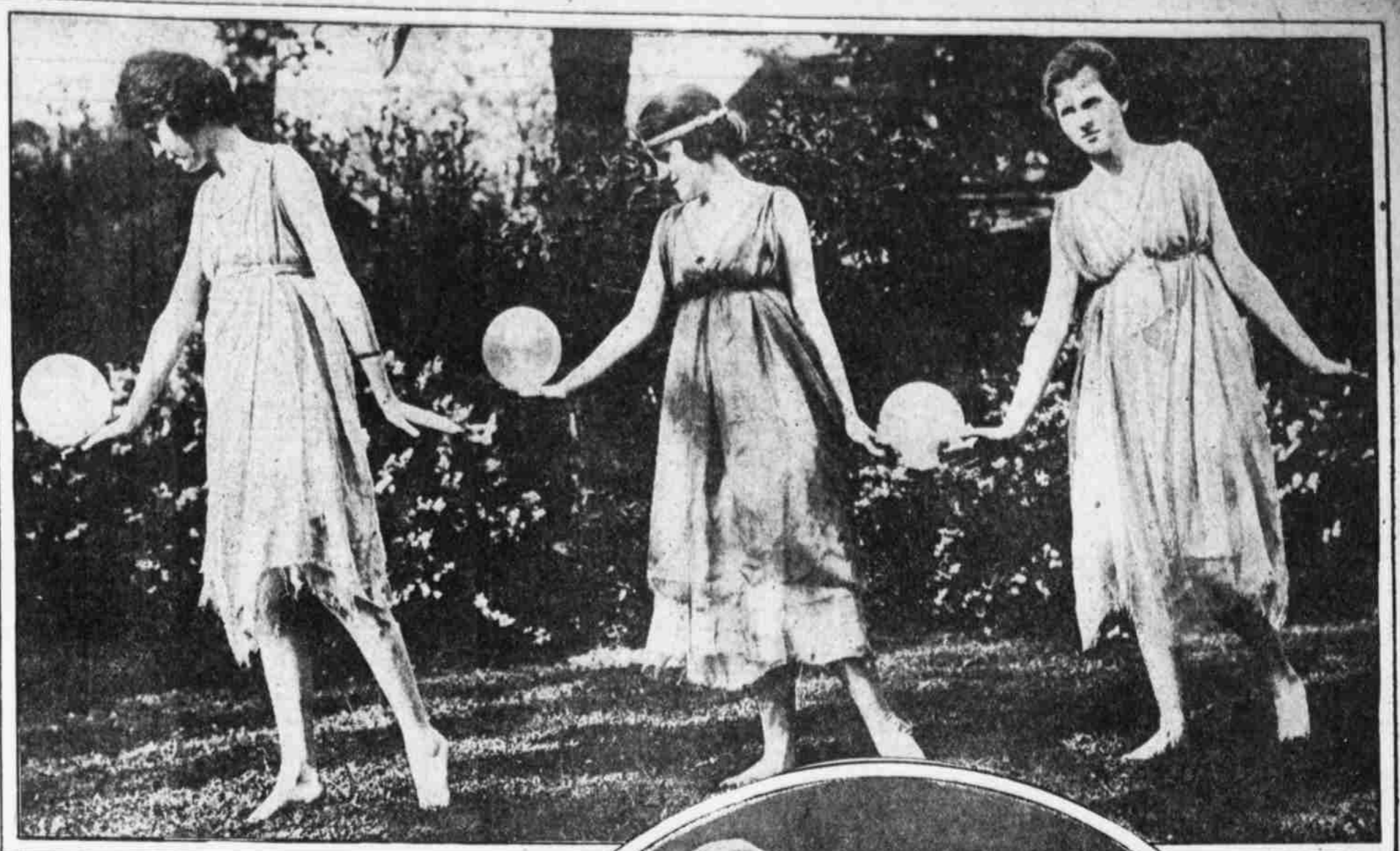
"THE BUDDIE DANCE," ONE OF THE ATTRACTIVE FEATURES OF THE WALNUT LANE SCHOOL'S SPRING FESTIVAL