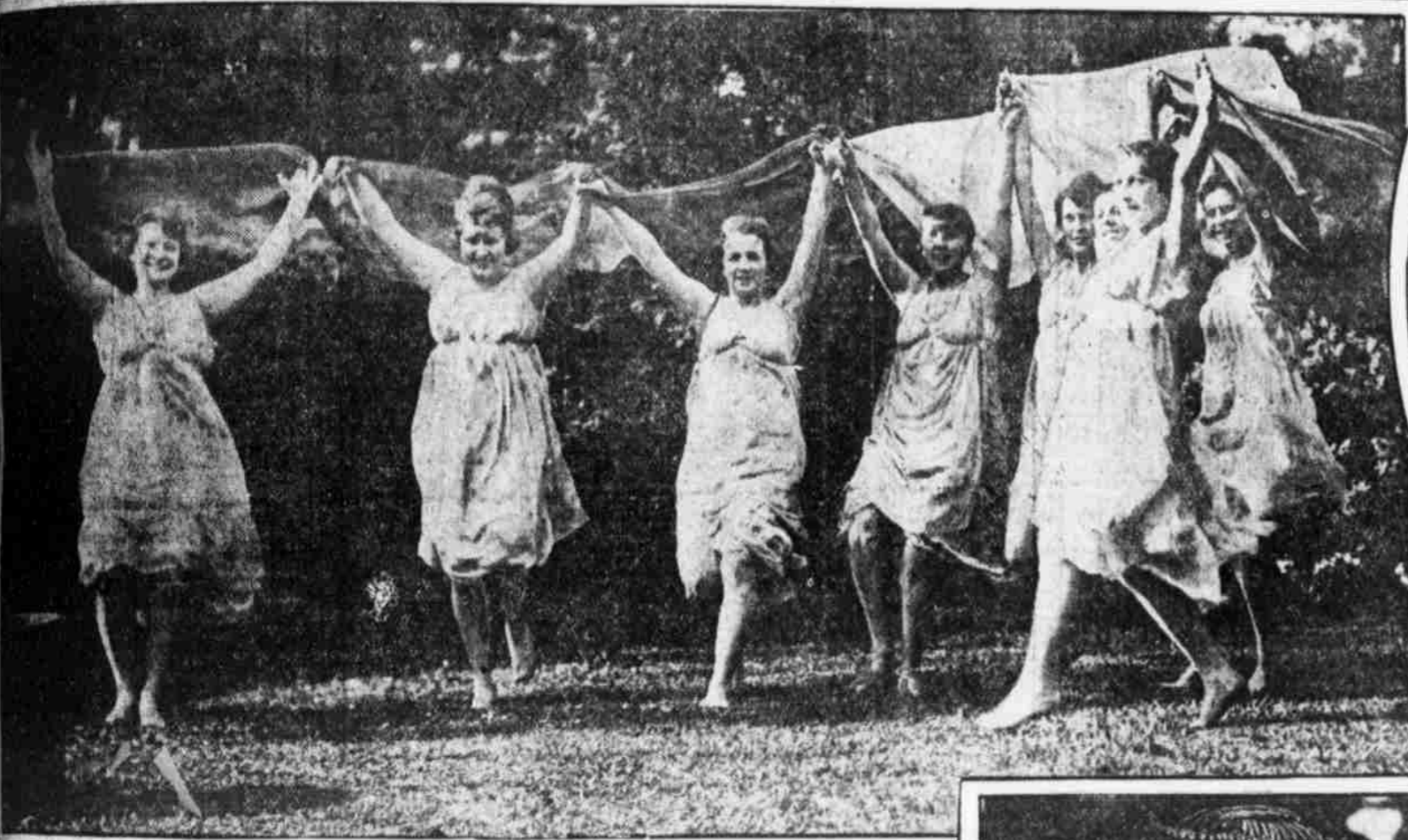
PRETTY DANCERS INTERPRET THE "SPIRIT OF THE SPRING" AT ANNUAL FESTIVAL HELD BY PUPILS OF THE WALNUT LANE SCHOOL