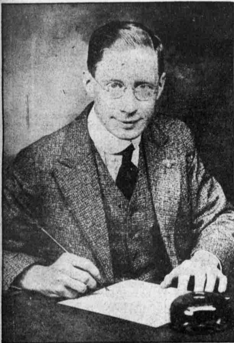
FIRST TO REGISTER IN BURLINGTON