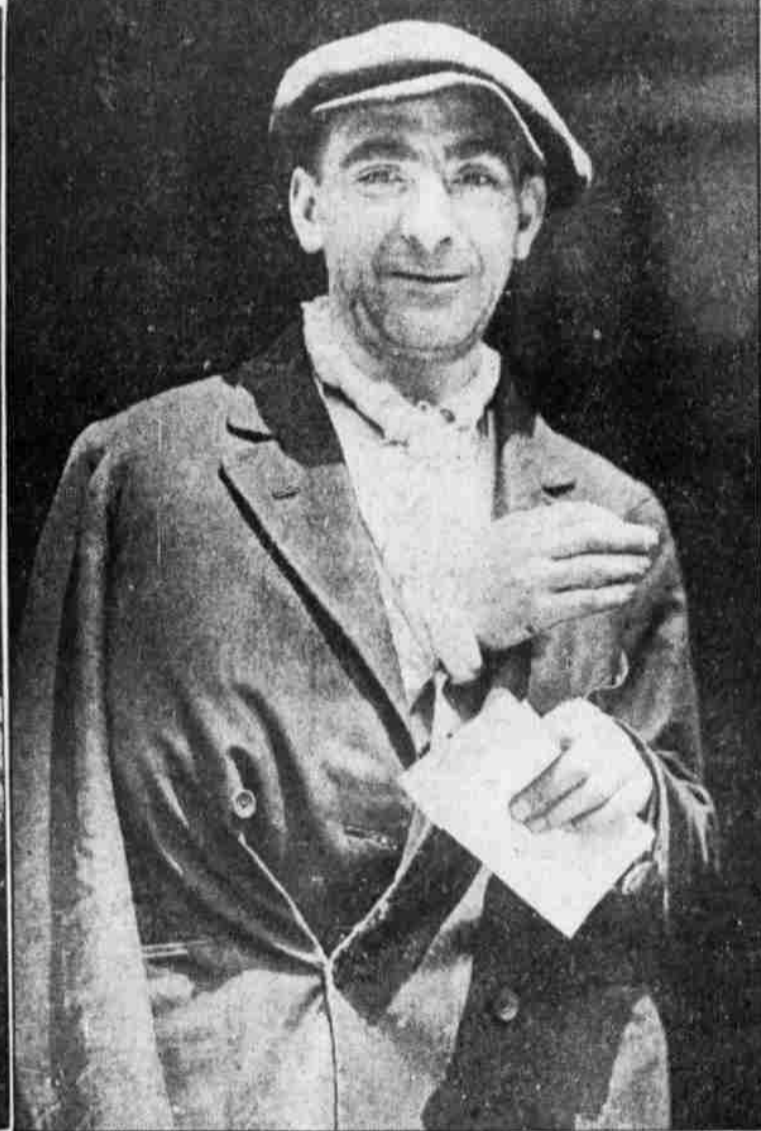
CRIPPLED NOW, BUT EAGER TO FIGHT