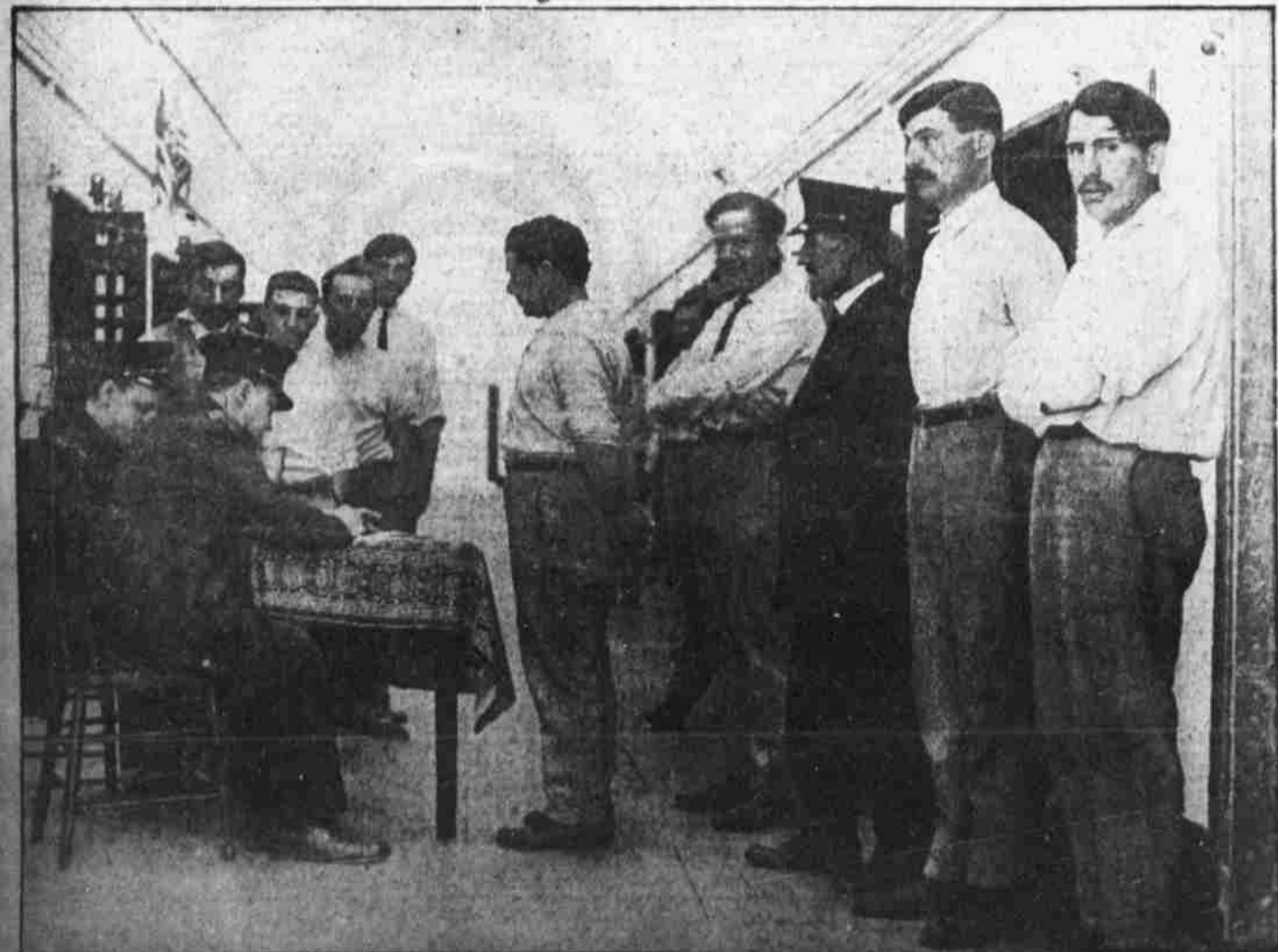
REGISTERING CONVICTS AT THE EASTERN PENITENTIARY