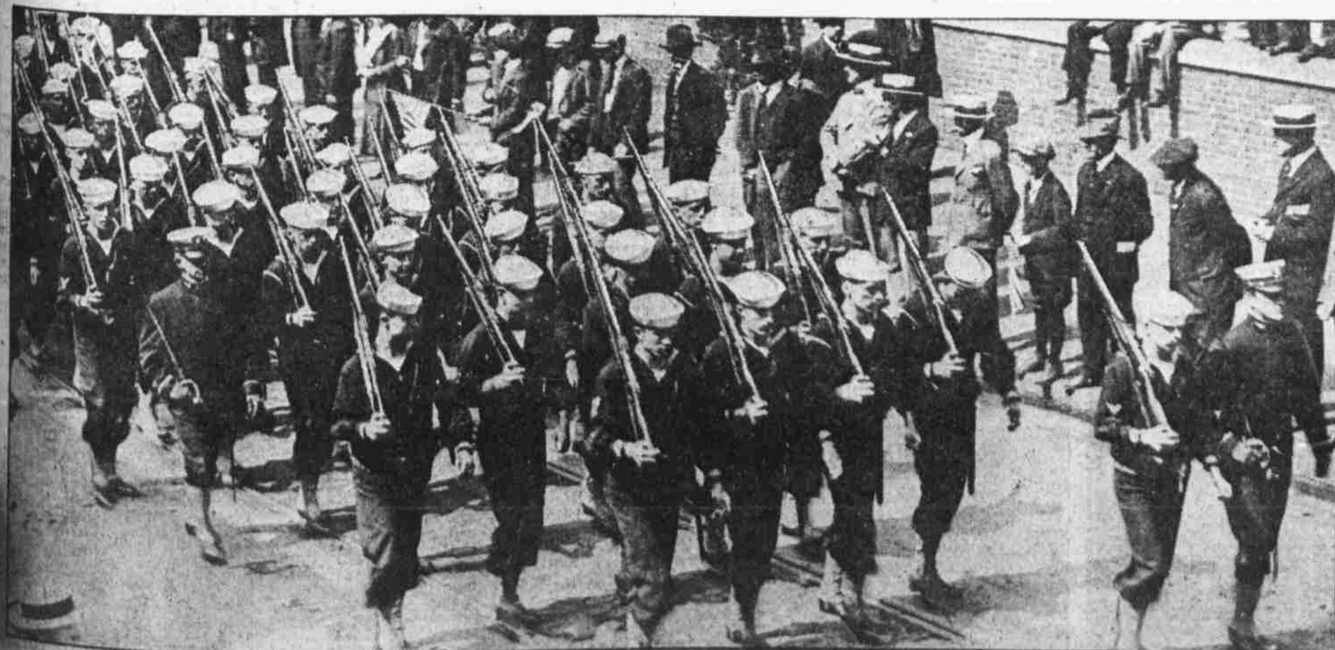
SAILORS IN THEIR SMART UNIFORMS ENLIVEN LIBERTY BOND PROCESSION