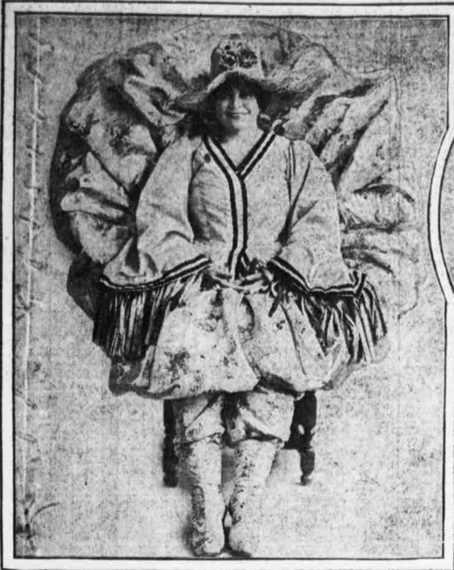
TRIXIE FRIGANZA AS SHE WILL APPEAR IN "CANARY COTTAGE" AT THE ADELPHI NEXT WEEK