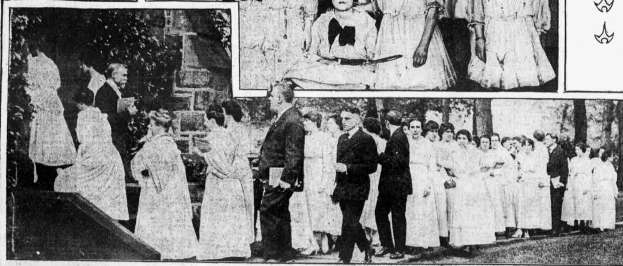
CHOIR ENTERING PACKER MEMORIAL CHURCH AT BETHLEHEM, WHERE THE BACH FESTIVAL IS HELD