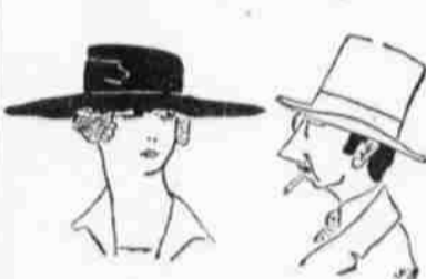
Might Come in Handy

—The Purple Cow. She—I like a fellow with lots of pep. He (languidly)—I have some peppermints if they'll help.