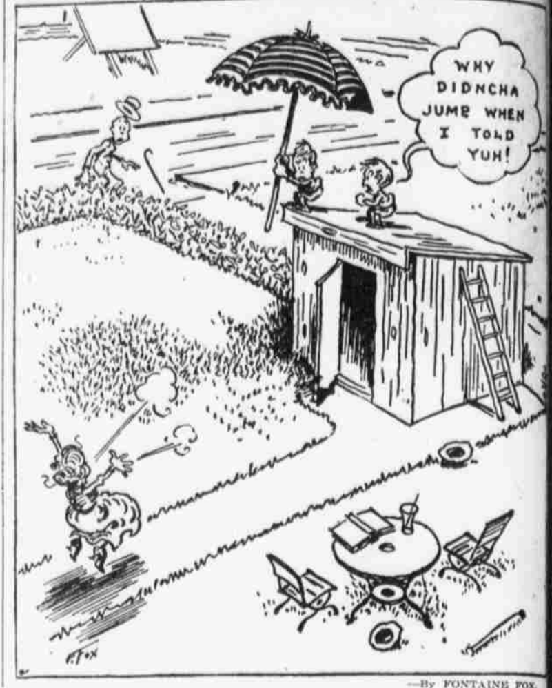
MOTHER'S NEW LAWN SHADE HAD HARDLY BEEN THERE TEN MINUTES WHEN JIMMY DISCOVERED A WONDERFUL USE FOR THE UMBRELLA

Classified Patriot—One who goes with his wife to buy a hat and enjoys himself. Martyr—One that goes with her, but falls asleep in the store. Hero—One that goes with her and flirts with all the cash girls. Coward—The sneaky character that always remembers he has an engagement.—Froth.