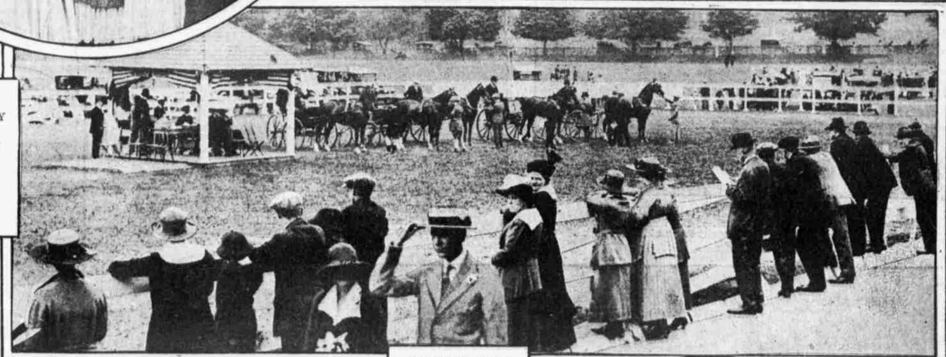
GENERAL VIEW AT THE DEVON HORSE SHOW, SHOWING THE TRACK AND THE JUDGES' STAND