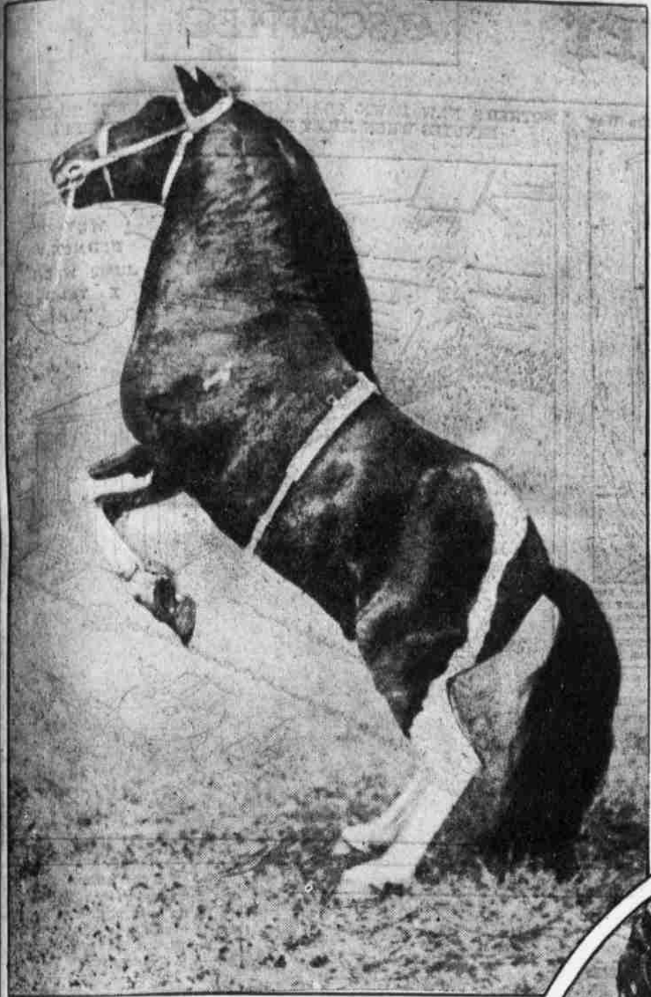
HORNET, THE DASHING BLUE-RIBBON WINNER EXHIBITED BY THE BLACK OAK FARM, WINS JUVENILE HEARTS AT THE DEVON SHOW