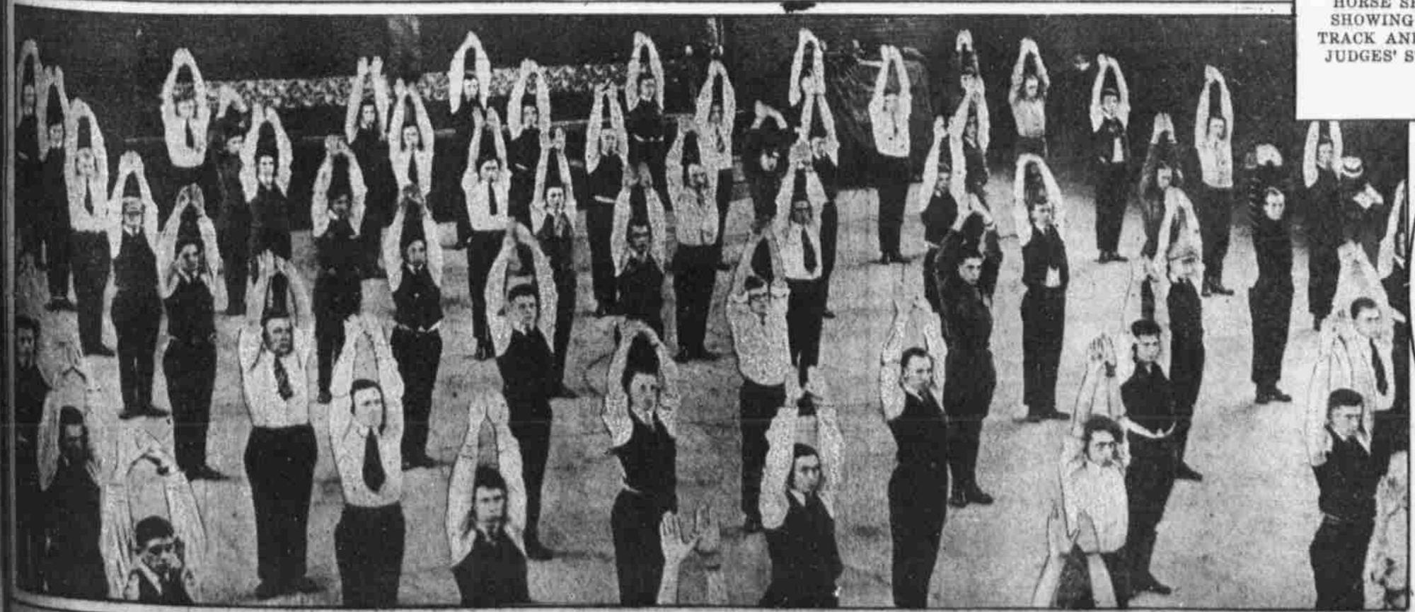
THE TEMPLE UNIVERSITY AMBULANCE UNIT RUNS THROUGH THE SETTING-UP EXERCISES BEFORE DEPARTING FOR ALLENTOWN, WHERE IT WILL UNDERGO MOBILIZATION BEFORE DEPARTING FOR FRANCE