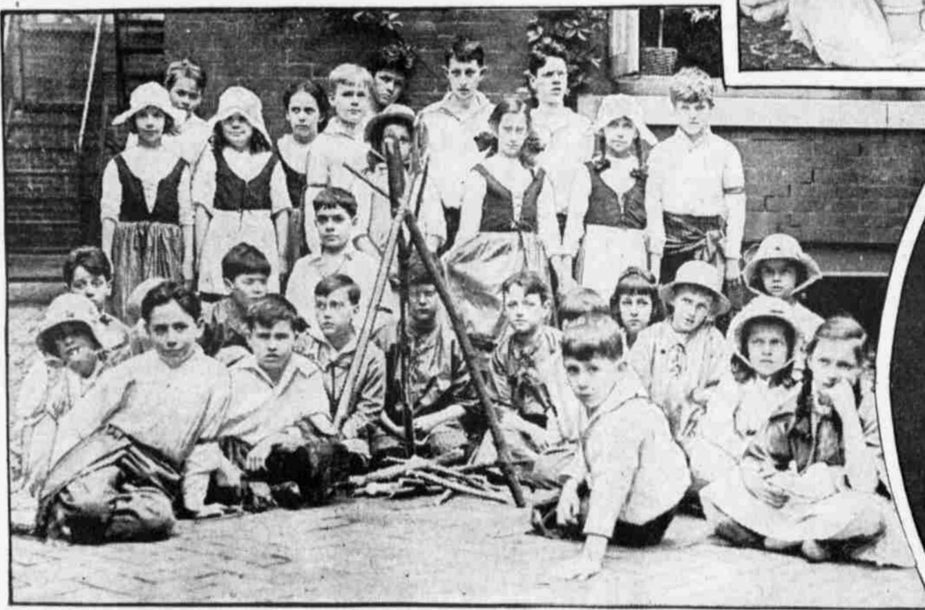
PUPILS OF THE FRIENDS' SELECT SCHOOL WHO PARTICIPATED IN THE TABLEAU ENTITLED, "THE GLORY OF PEASANTRY"