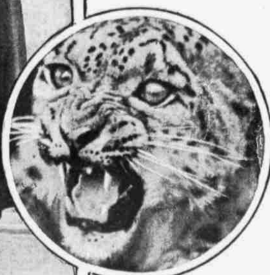
THE "OUNCE OF SNOW" LEOPARD CAUGHT IN AN UGLY MOOD AT THE ZOO