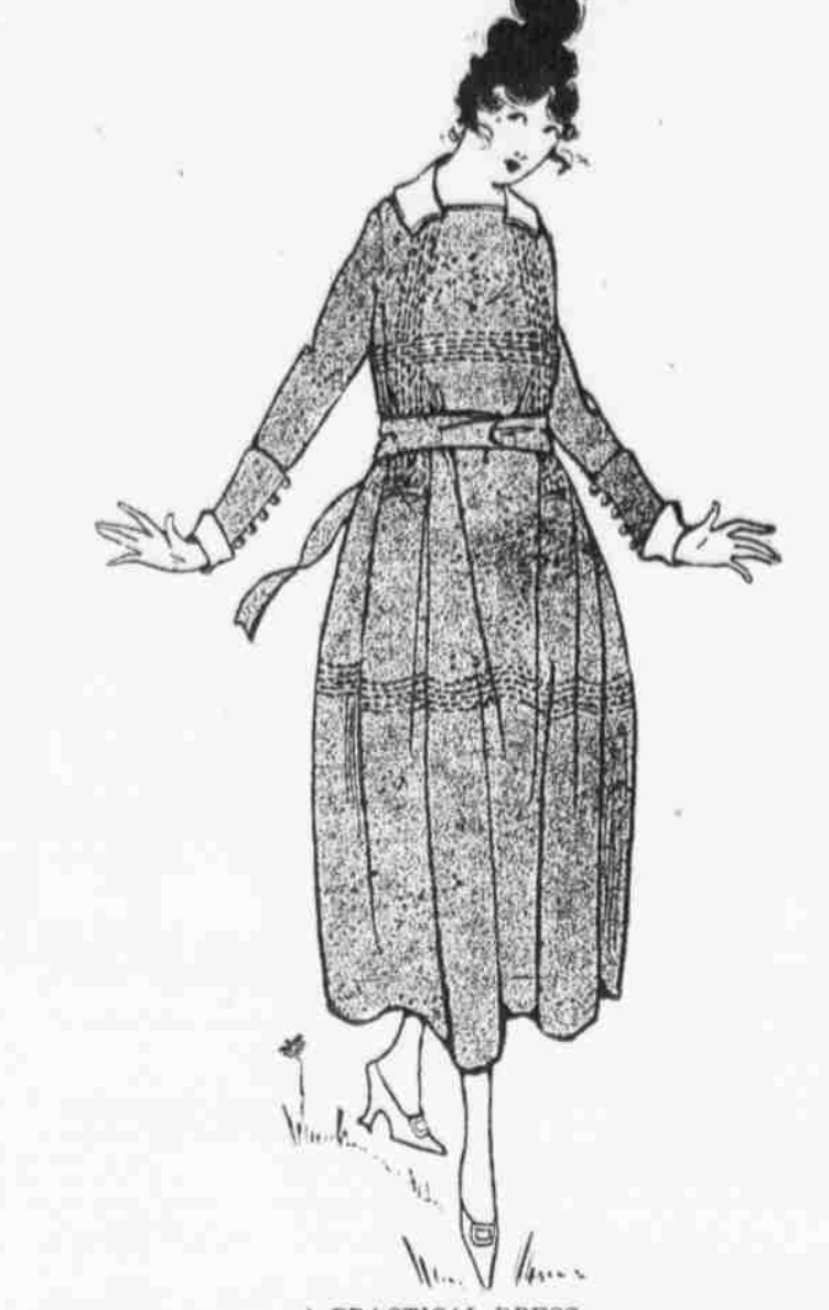
A PRACTICAL DRESS. Natural-colored linen is the chosen material for this barrel-shaped frock, in which the skirt is cut in two portions and joined above the knee with rows of beige-stitching to make it bow out.

The Oxen. Christmas eve, and twelve of the clock. "Now they are all on their knees."