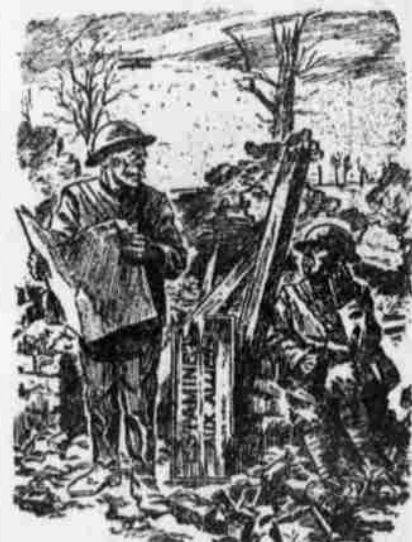
Another Disadvantage of Peace

—Casell's Saturday Journal. "Looks as if this 'ere war's a-goin' to finish, Charlie, an' then our — leaves will be knocked on the head altogether!"