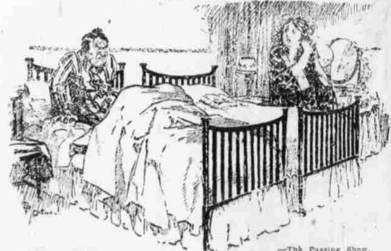
THE HORRORS OF HOARDING

Probably the unmitigated falsehood most frequently told year in and year out takes this form: We welcome honest criticism.—Ohio State Journal.