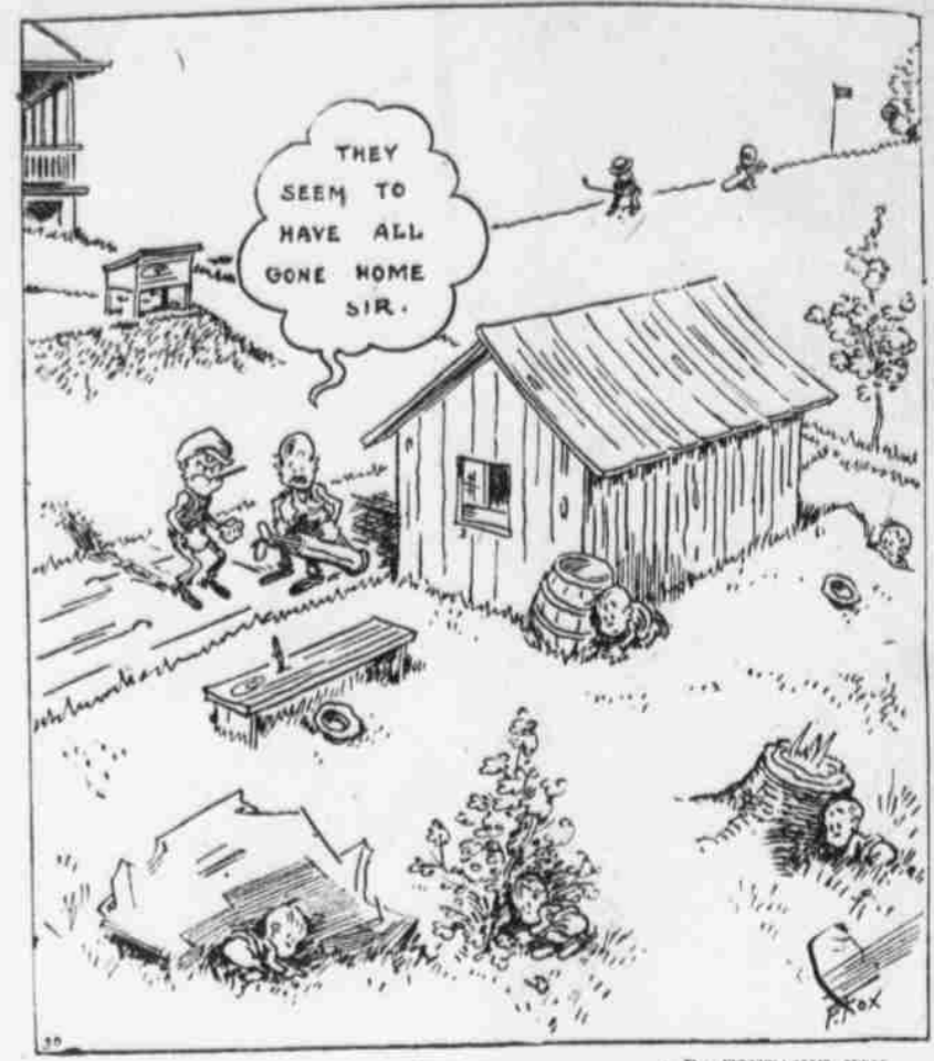
THE TERRIBLE TEMPERED MR. BANG ALWAYS HAS A HARD TIME GETTING A CADDY

"Now, this is the kind of movie I like. It's educational." "Why, it's all about a vampire." "Just so. I may meet a vampire some of these days and then I'll know how to protect myself."—Birmingham Age-Herald.