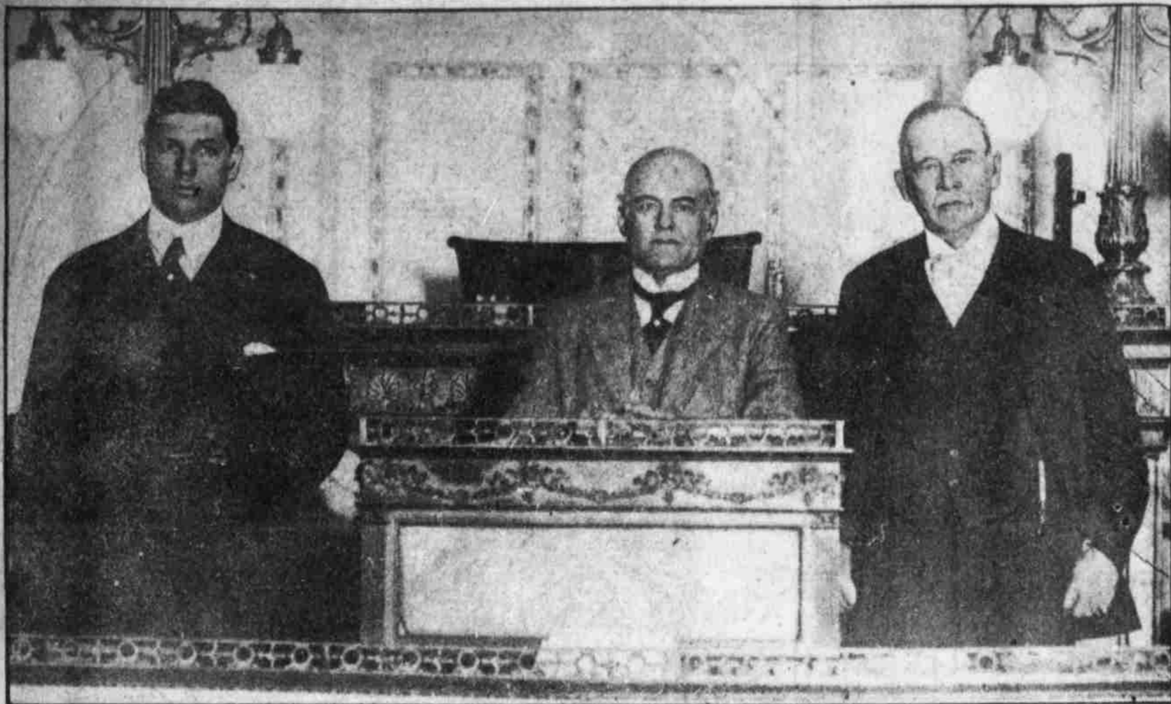
REGISTRATION COMMISSIONERS MEET DISTRICT REGISTRARS