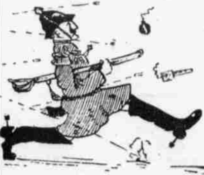
—The Purple Cow, FIRE AT WILL.