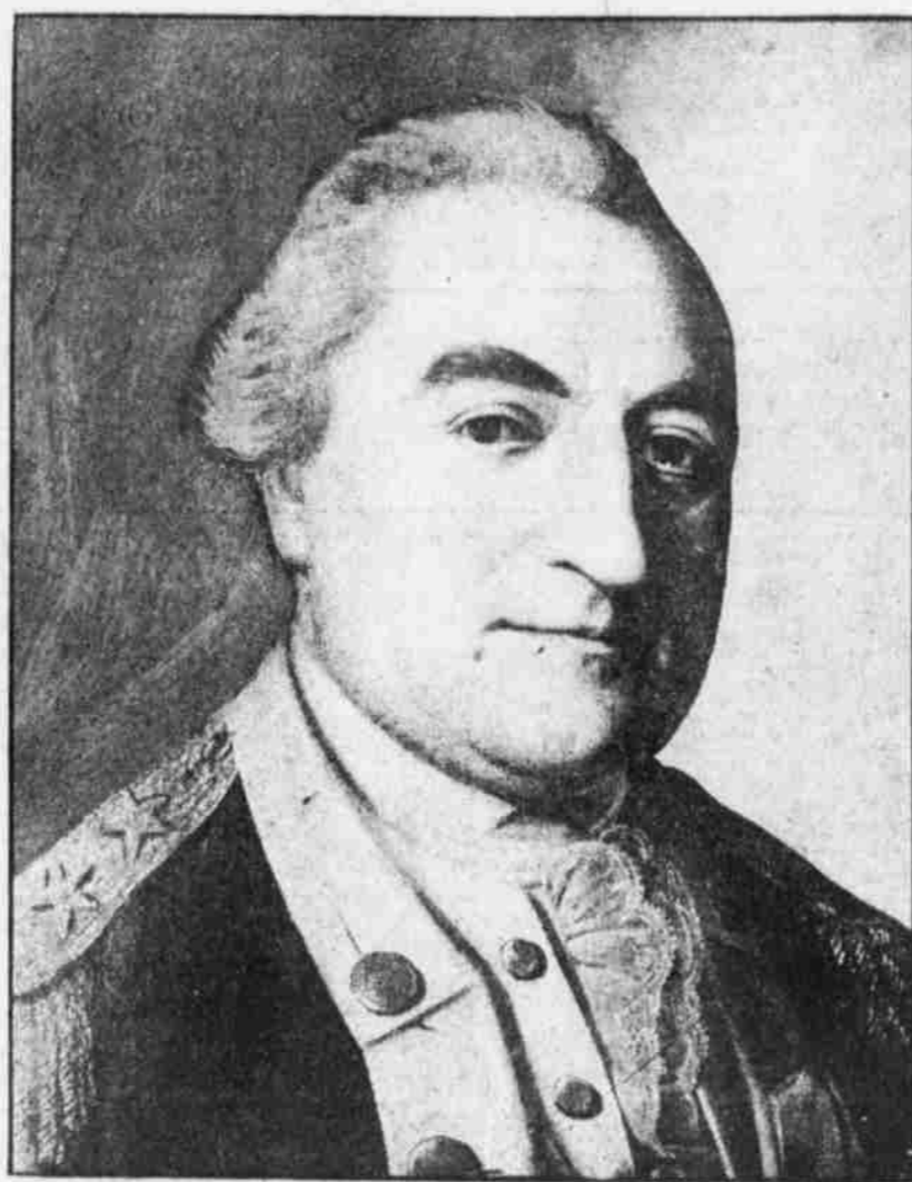
GERMAN-AMERICAN HERO'S PICTURE SUPPLANTS CROWN PRINCE'S

The portrait of the famous Revolutionary hero of German birth, who fell in defense of American liberty, will adorn the cabin of the former Eitel Friedrich, which now bears his name.