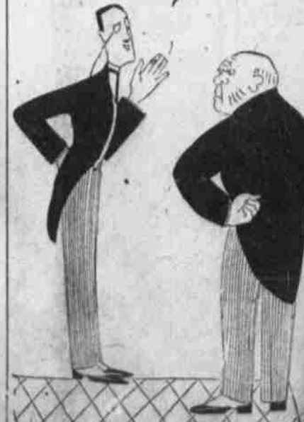
The Psychological Moment

—In that case, perhaps you will lend me a five-spot.