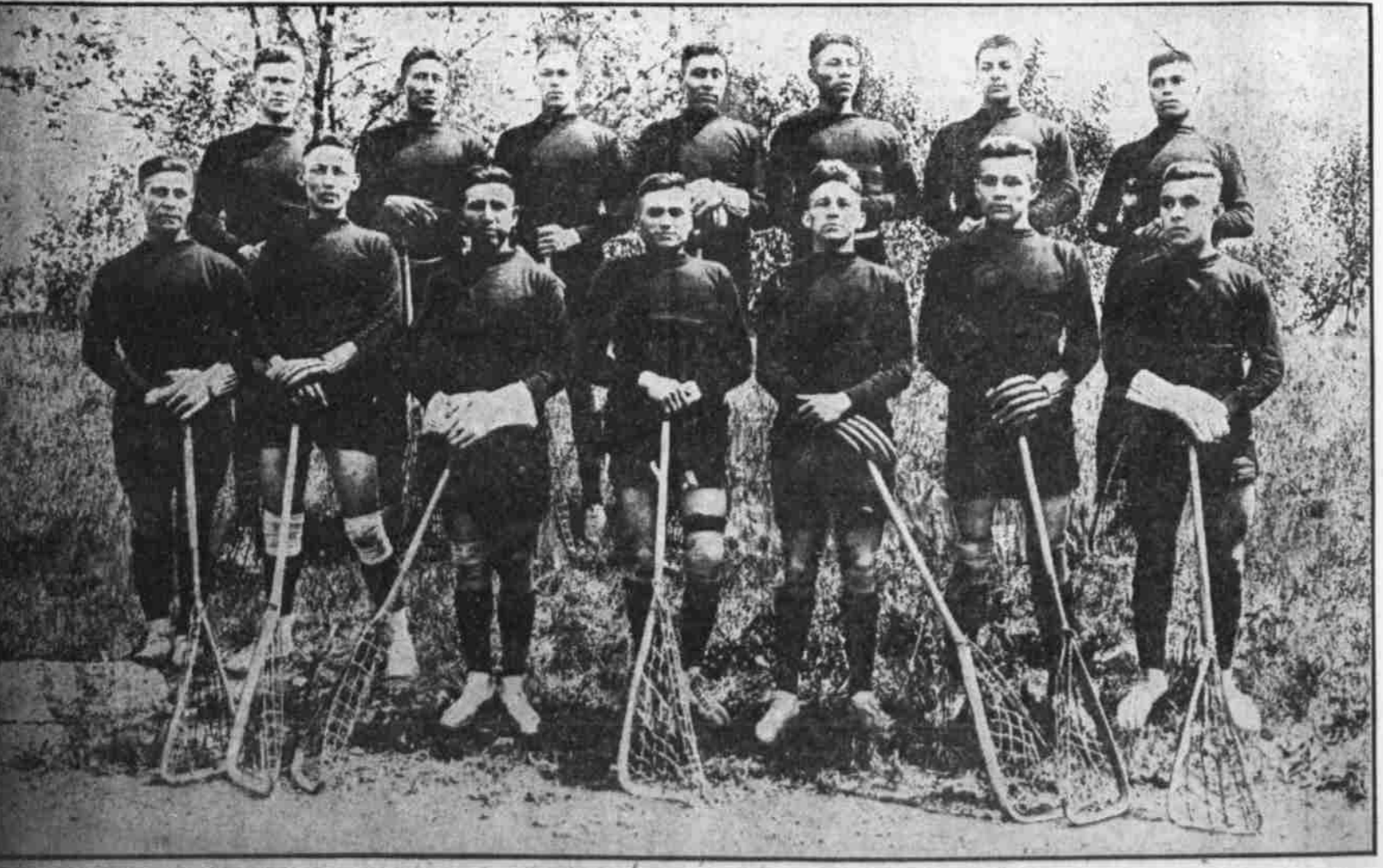
A CHAMPION INDIAN LACROSSE TEAM

Happy Thought Miss Askit—Does your husband smoke those cigars you gave him Christmas? Mrs. Nuwed—He smoked one and said he would keep the rest to remind him of my kindness.—Missouri Mule.