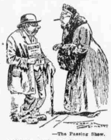
Another War Horror

The Passing Show. Old Lady—And what did you do, my poor man, before you were blind? Thoughtless Beggar—I was deaf and dumb, mum!