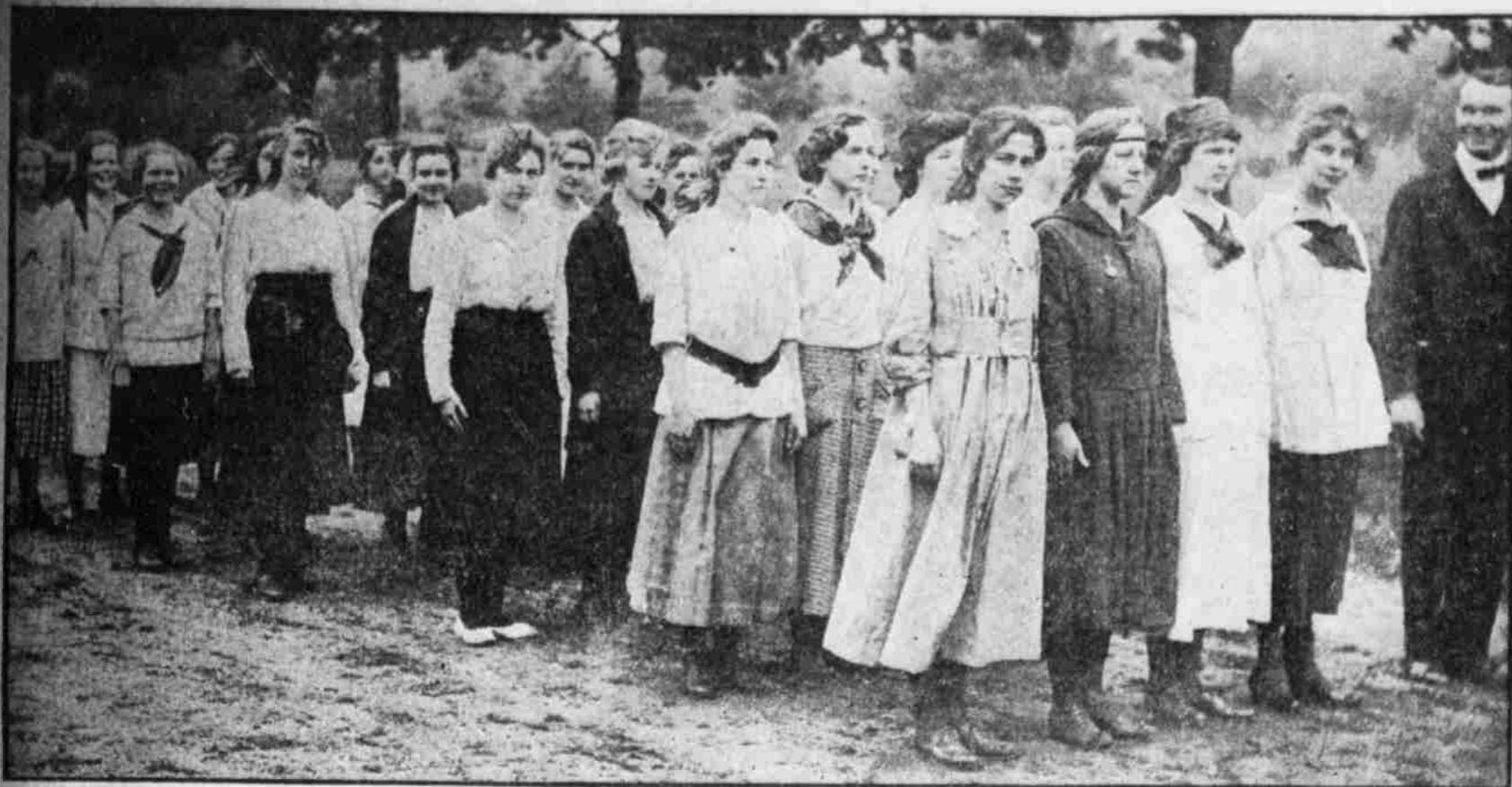
MILITARY SPIRIT HAS REACHED JERSEY SCHOOL GIRLS Down in Collingswood students in the high school are drilling as industriously as their brothers, for there isn't a single slacker in the institution.