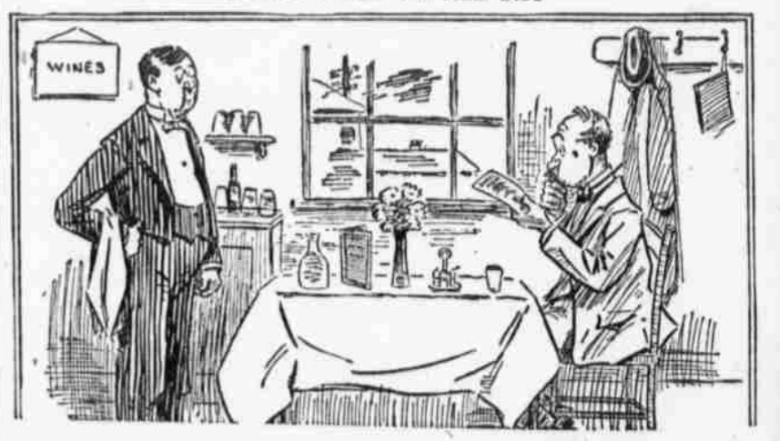
THAT'S WHAT WE ALL SAY

The Tailor. "Good Heavens! What the dooce have you charged?" "It's the war, sir." "Well, you don't think I can pay all the cost of it, do you?"