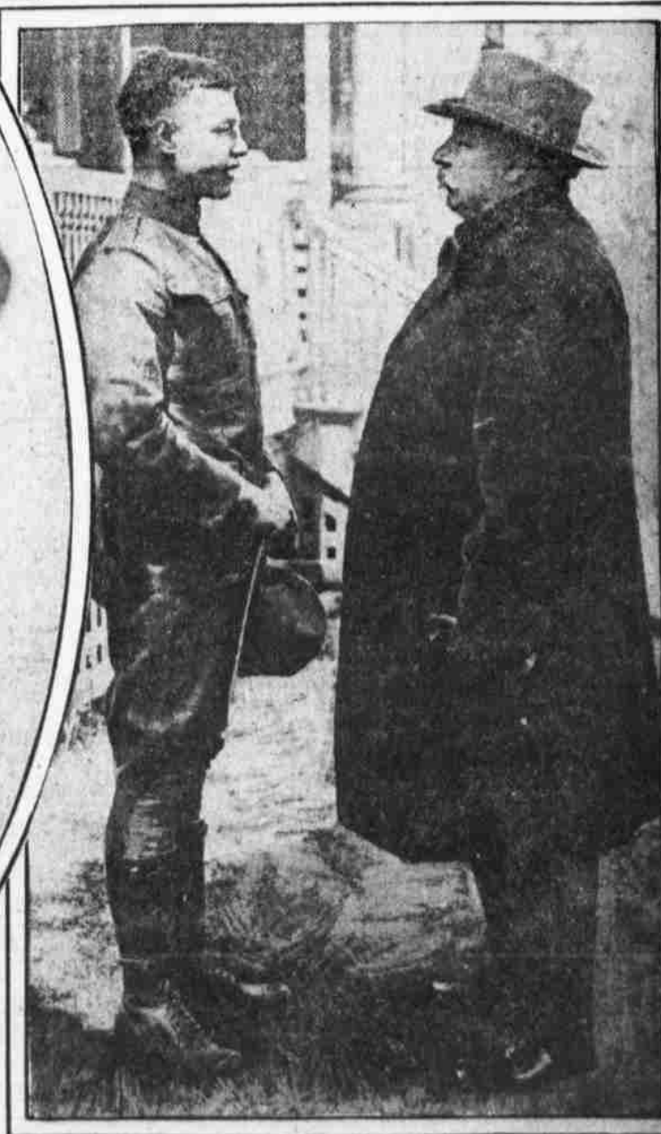
WILLIAM HOWARD TAFT PAYS A VISIT TO HIS SON, IN TRAINING AT FORT MYER