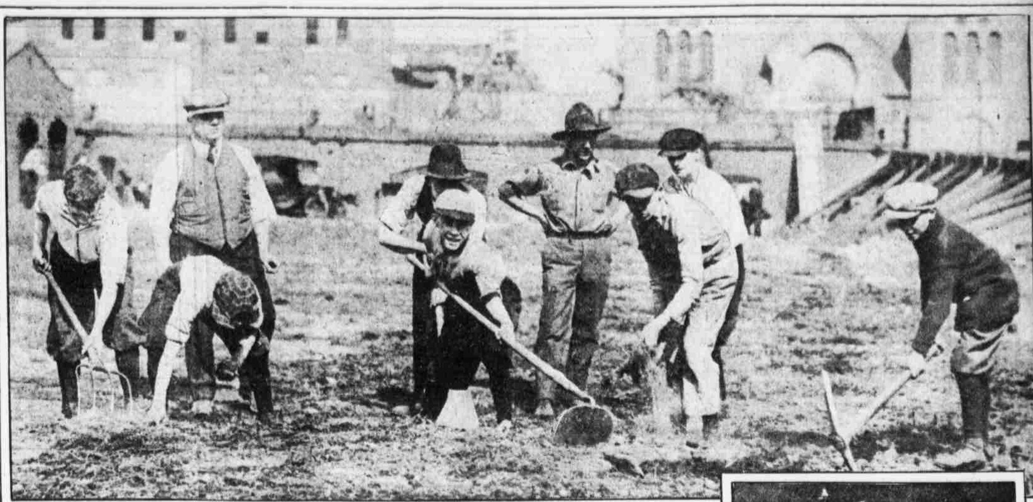
BOY SCOUTS TO CONVERT VACANT LOT INTO FLOURISHING GARDEN Members of Troop 31 are clearing the ground on the plot at Fifteenth and Green streets preparatory to plowing it later in the week.