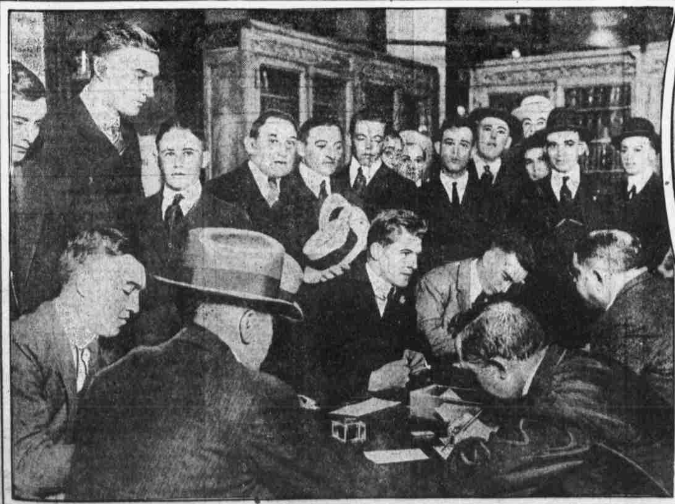
NEW YORK GIANTS REGISTER FOR MILITARY SERVICE BEFORE DEPARTING ON EXTENDED TRIP