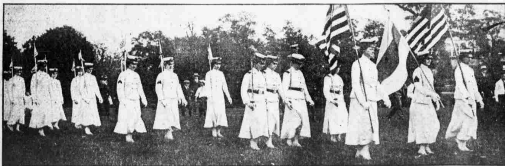
LADY MACCABEES ATTEND STONEMEN'S MEMORIAL SERVICES They were among the 15,000 persons present yesterday at the exercises in honor of the 320 members of the order who died the last year.