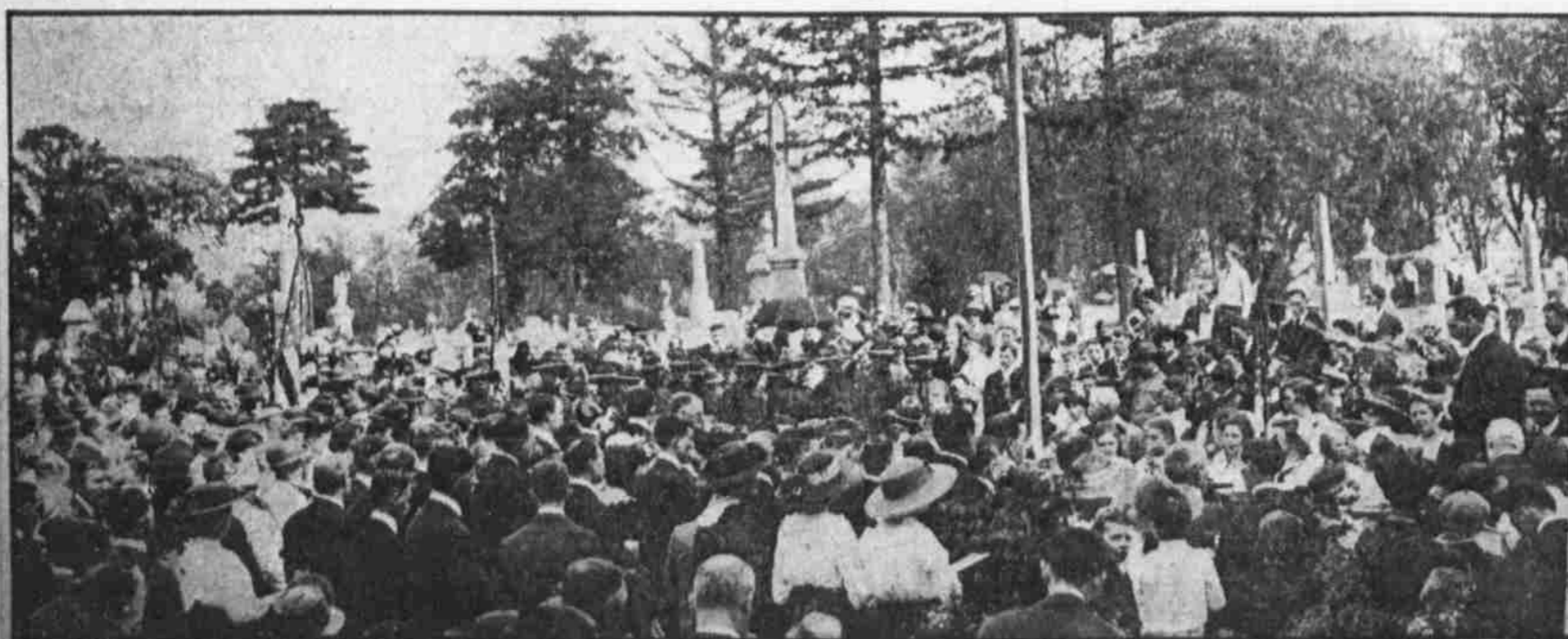
MEMORY OF BETSY ROSS HONORED BY SUNDAY FLAG RAISING AT HER GRAVE IN MT. MORIAH CEMETERY