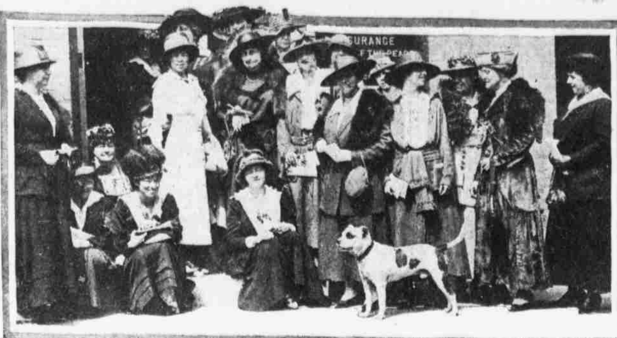
"Doorbell pulling" delegation of Main Line women who are working to obtain 1000 members for their organization.