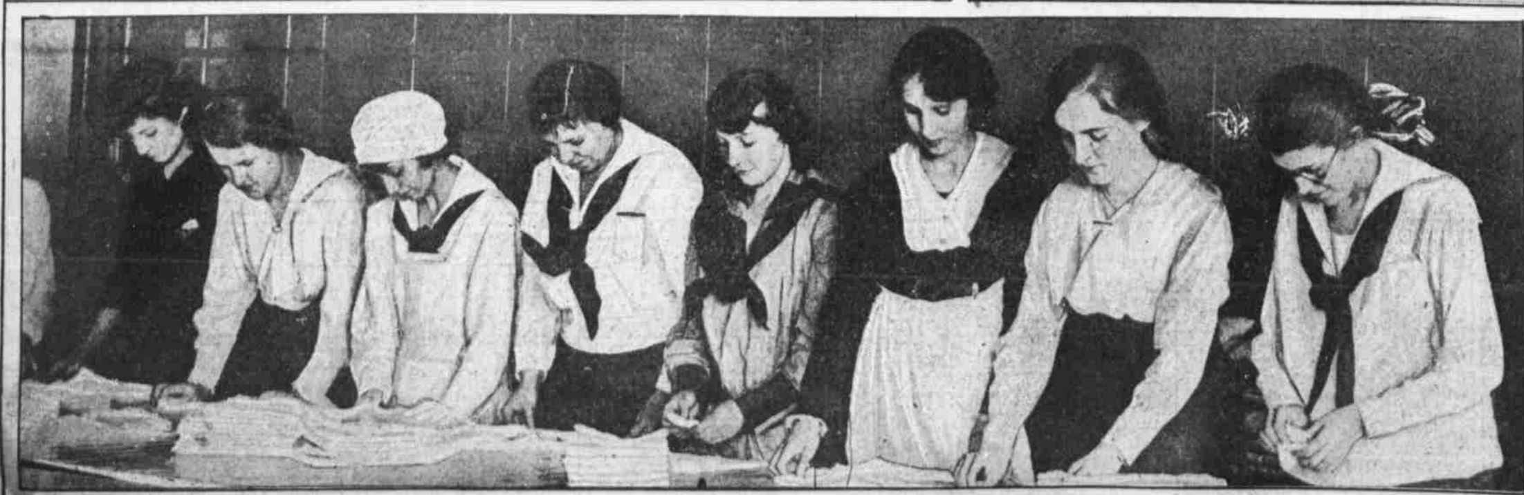
RED CROSS CLASS IN BANDAGE MAKING AT THE WEST PHILADELPHIA HIGH SCHOOL FOR GIRLS