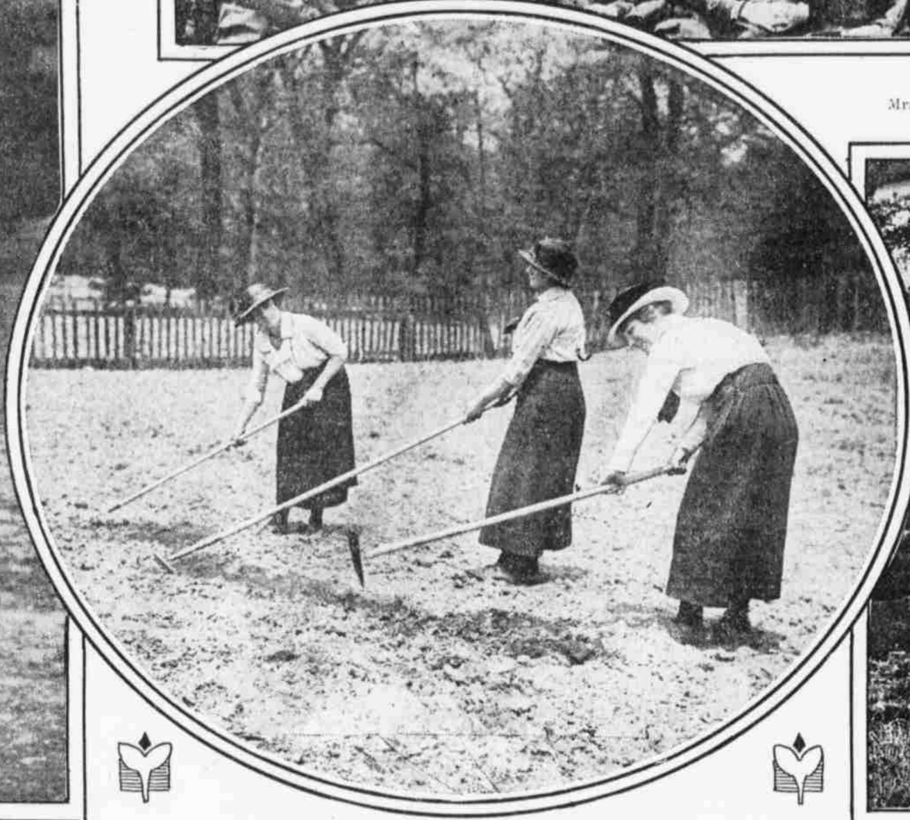
FUTURE SCHOOL MARMS BECOME FARM MAIDS