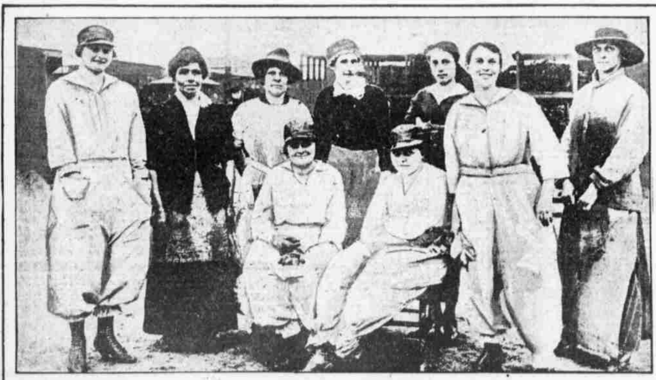
FIRST WOMAN RAILROADERS IN AMERICA