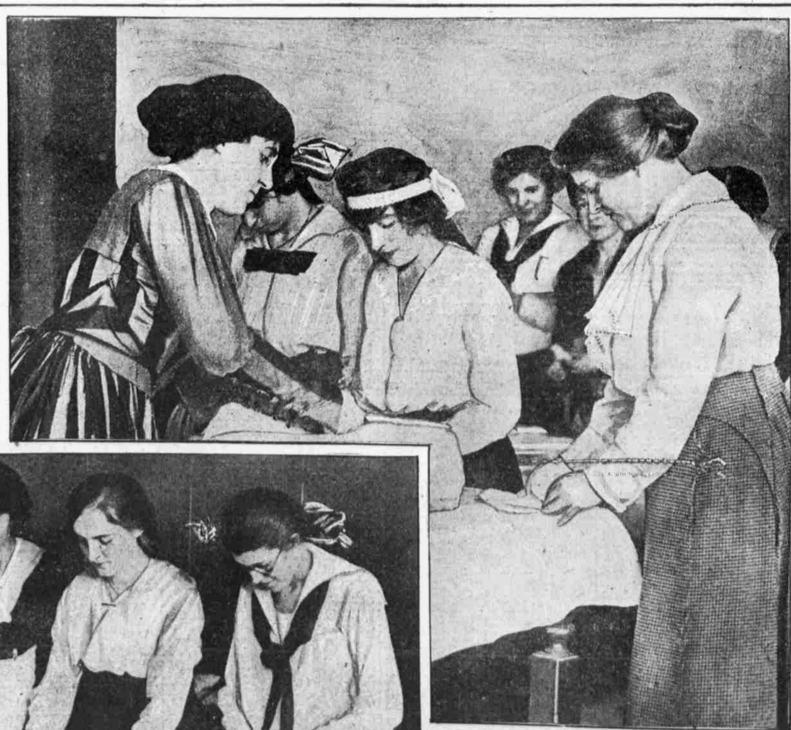
HIGH SCHOOL GIRLS MAKING BANDAGES

They are employees of the Baltimore and Ohio system at Lorain, O., where they are doing regular repair work in the shops.