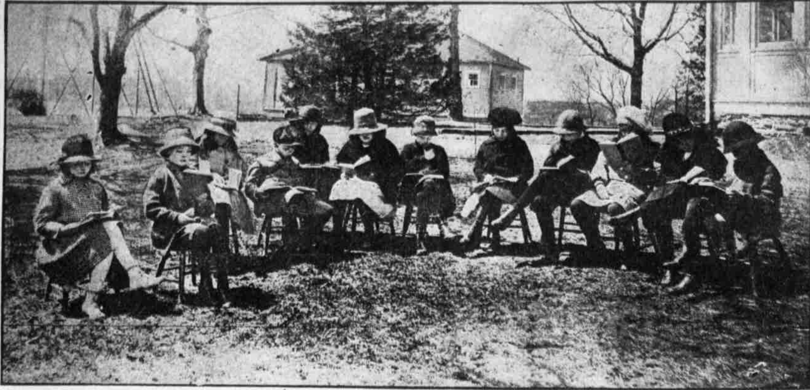
WHERE THE STUFFY CLASSROOM IS UNKNOWN Teaching in the open air is popular with instructor and pupils alike at the Oak Lane Country Day School.