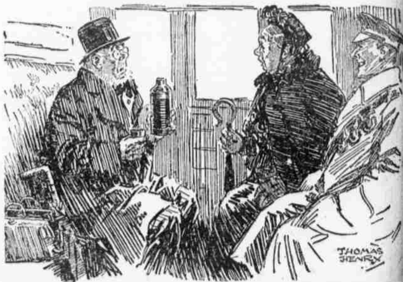
A DISMAL FAILURE

—The Passing Show. Jarge—I don't think much o' these here valkum bottles, missus. The cold milk as ye put in this marnin' ain't even warm yet.