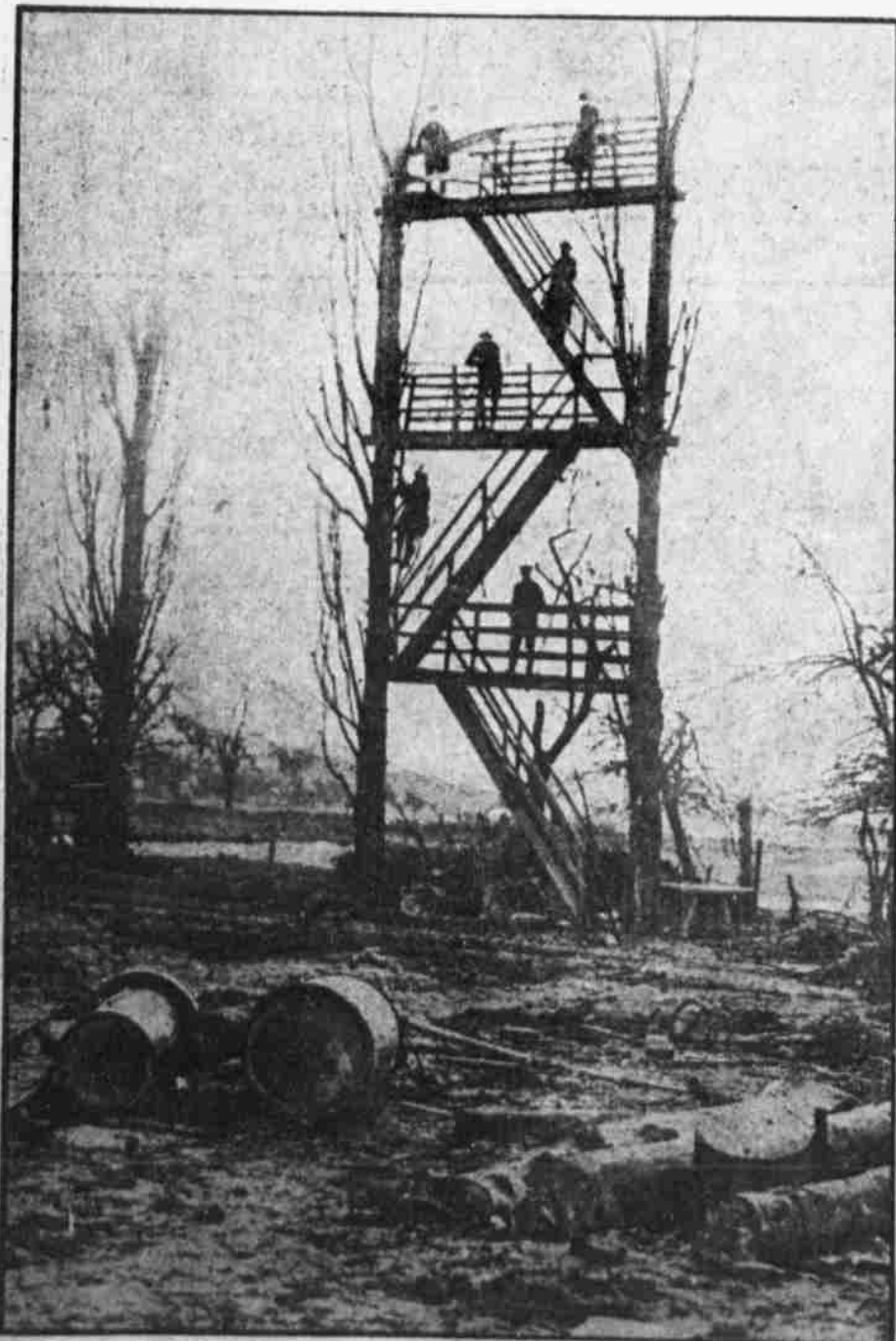
"THEY SAW US COMING AND THEY FLE!" Canadian official photograph showing an observation post behind the German original line of trenches in the Vimy district.