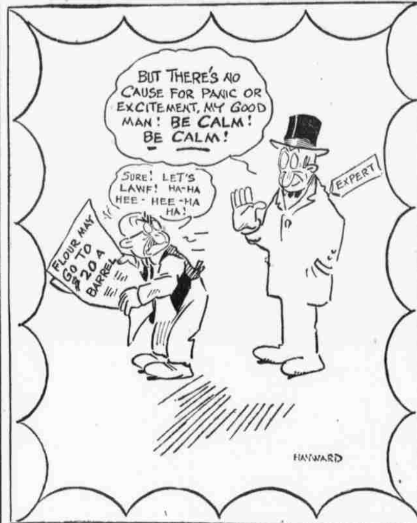
THE PADDED CELL

BUT THERE'S NO CAUSE FOR PANIC OR EXCITEMENT, MY GOOD MAN: BE CALM! BE CALM!