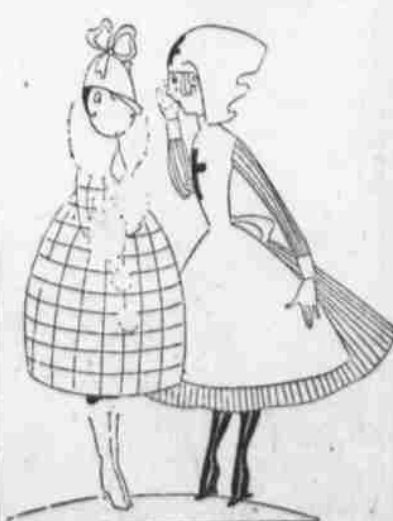
Call the Red Cross

—Squib. “Say, Esther, do you know how they summon the deaf mutes to dinner at the asylum?” “No, how?” “Ring dumb-bells.”