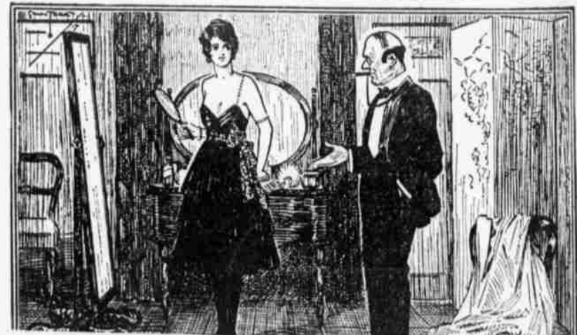
A SUBTLE BUT SIGNIFICANT DISTINCTION

—The Tailor. “Well, dad, don't you think my new frock becoming?” “Yes, dear, becoming, certainly becoming indeed—but—er—hardly become!”