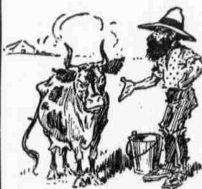
When They Shove the Clock Ahead

—Melbourne Punch. Milkster (to belated bovine)—Blimey! don't you know it's milkin' time accordin' to the new clock. Why don't you read your paper?