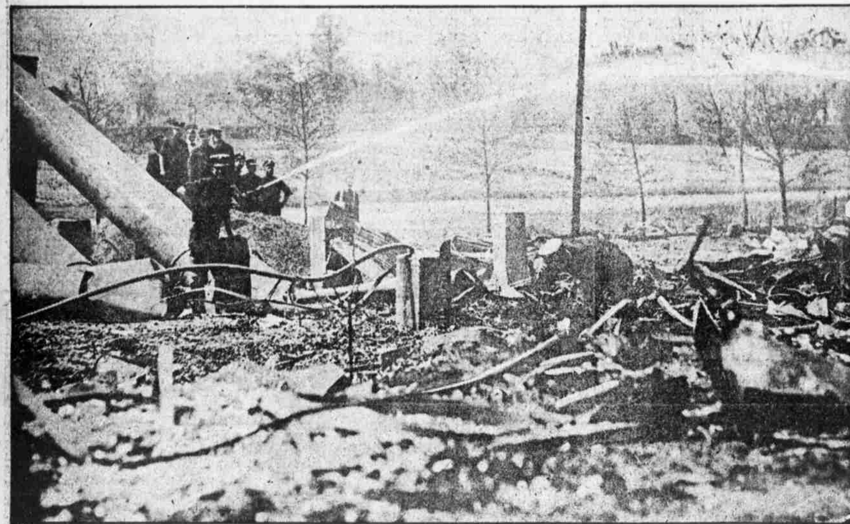
NOTHING BUT RUINS IN WAKE OF DISASTROUS SUNDAY FIRE AT WOODSIDE PARK An explosion of gasoline is believed to have started the blaze that destroyed $160,000 worth of buildings and concessions at the popular amusement resort.