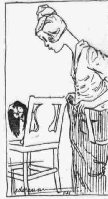
The Young Lady Across the Way

The young lady across the way says she has an idea that if the Kaiser is given enough rope he'll drown himself yet.