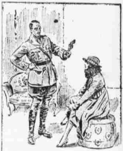
Just the Word

—London Bystander. “The best friend I've got—this old revolver of mine. Just as I was getting the worst of a scrap I knocked the beastly Boche on the head with it!” “Oh, how perfectly stunning!”