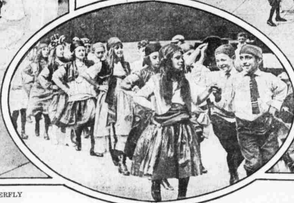
THE ITALIAN DANCE WAS ONE OF THE MOST ANIMATED BITS ON THE WRIGHT SCHOOL PROGRAM