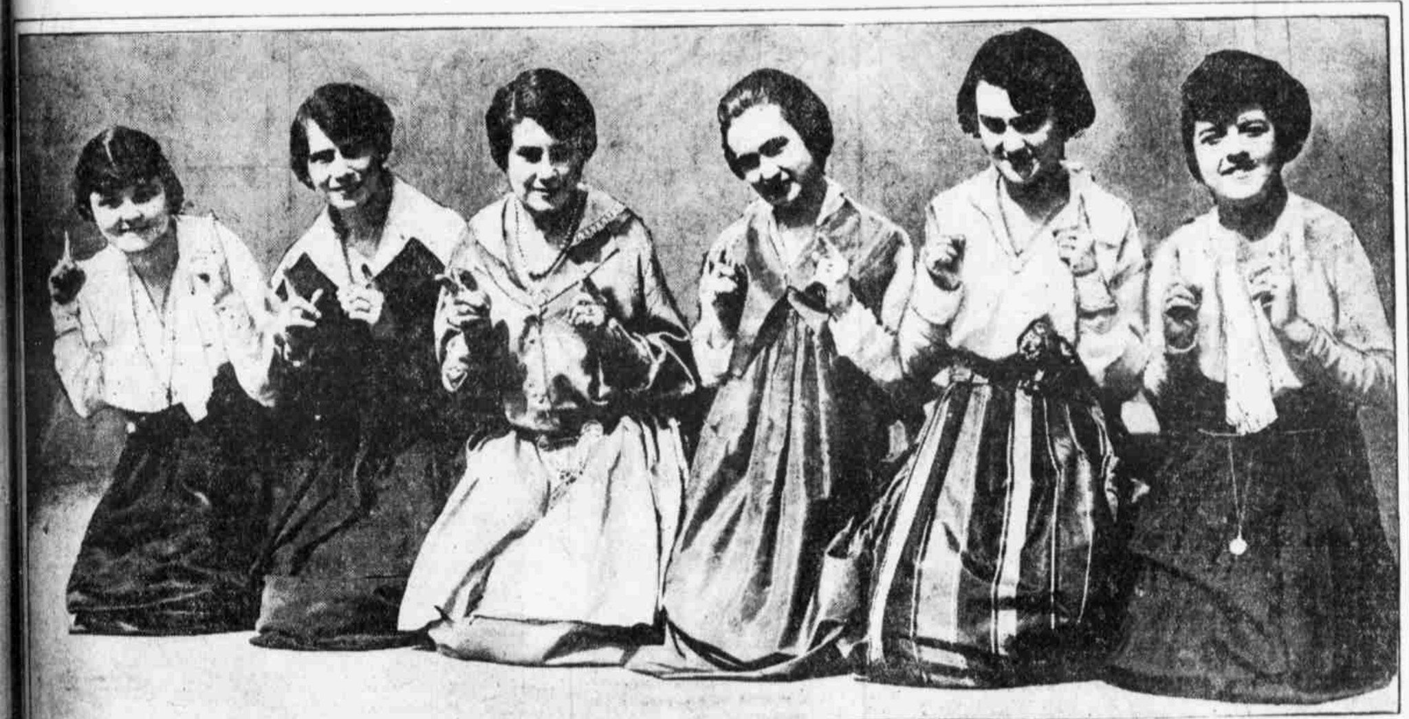
PRETTY MUNITION WORKERS WHO WILL SING IN THE "CHINA DOLL CHORUS," ONE OF THE PROMINENT NUMBERS IN THE BIG PLAY TO BE GIVEN AT THE METROPOLITAN OPERA HOUSE THIS MONTH