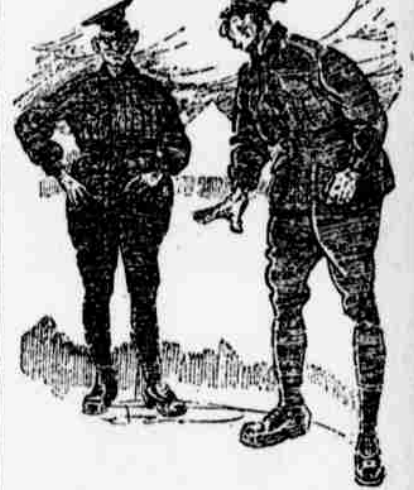
"Cripes, Bill, what did they give you!" them stripes for?" "Not for being a mug, anyhow." "Oh, I know that, Bill-or they'd

Wife-Yes, you did. You dear, kind old boy, you let a poor old Irishman have it, for I distinctly heard you say in your sleep, "Oh, that's all right. I'll stand pat."—Boston Transcript.