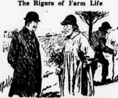
The Son of His Father—Yes, 'e be ma faither, and ninety-two he be this year, an' still plowin'! But yer know, mister, 'e ain't allus well, an' sometimes I thinks as farmin' don't agree wi' 'un.