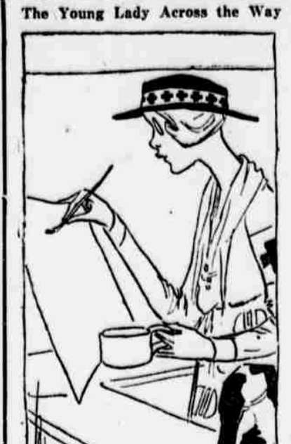
The young lady across the way says the potato vines in her war garden are getting pretty high, but she's looked at every twig carefully and there isn't the sign of a potato on them yet.