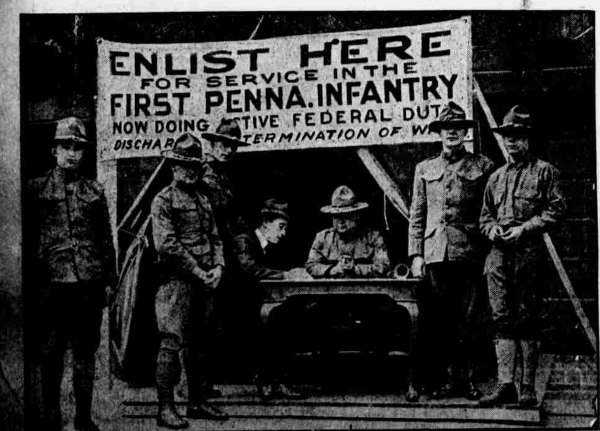
RECRUITING IN SHADOW OF UNION LEAGUE This organization, founded to maintain the Federal Union, has tendered the use of its Broad street pavement to the First Regiment, and a regulation tent serves as an office for the spread in charge.