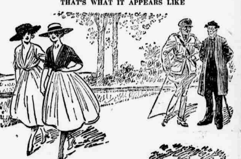
-Cassell's Saturday Journal. The Vicar-Dress, dress-it's all the modern girl thinks about, one mad race after the fashion. The Colonel-Ah, yes, each girl try ing to outstrip the other!