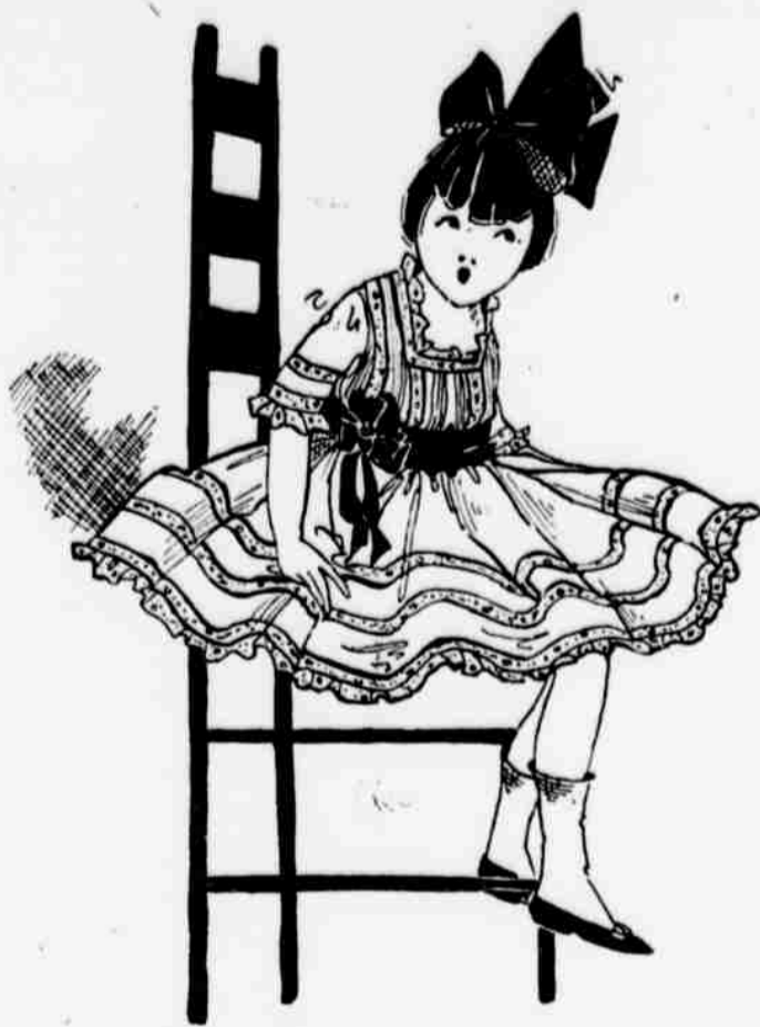
An adorable creation in white organdie and Valenciennes lace is this kiddie's dress which trends slightly toward the Empire of old in its style. The huge hair bow and the cunningly rosetted sash girdle are of brilliant orange taffeta—an unusual and, therefore, entirely desirable note.