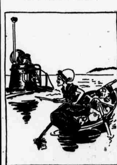
More Than a U-Boat

—The Sketch. The Pirate—Quick, Fritz—dive; she's a dreadnought!