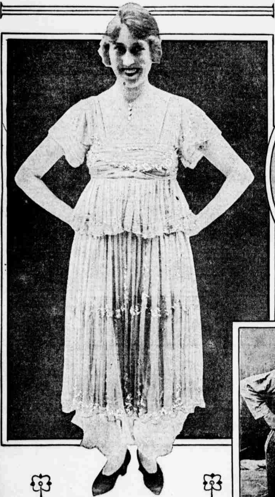
CHARLOTTE GREENWOOD IN "SO LONG LETTY," SO LONG AT THE LYRIC