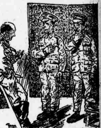
More Horrors of War

—London Opinion. Medical Officer (to first private)—What is it you're complaining of? First Private—Cardigan trouble, sir. Medical Officer (to second private)—And what's the matter with you? Second Private—Precarious teeth, sir.