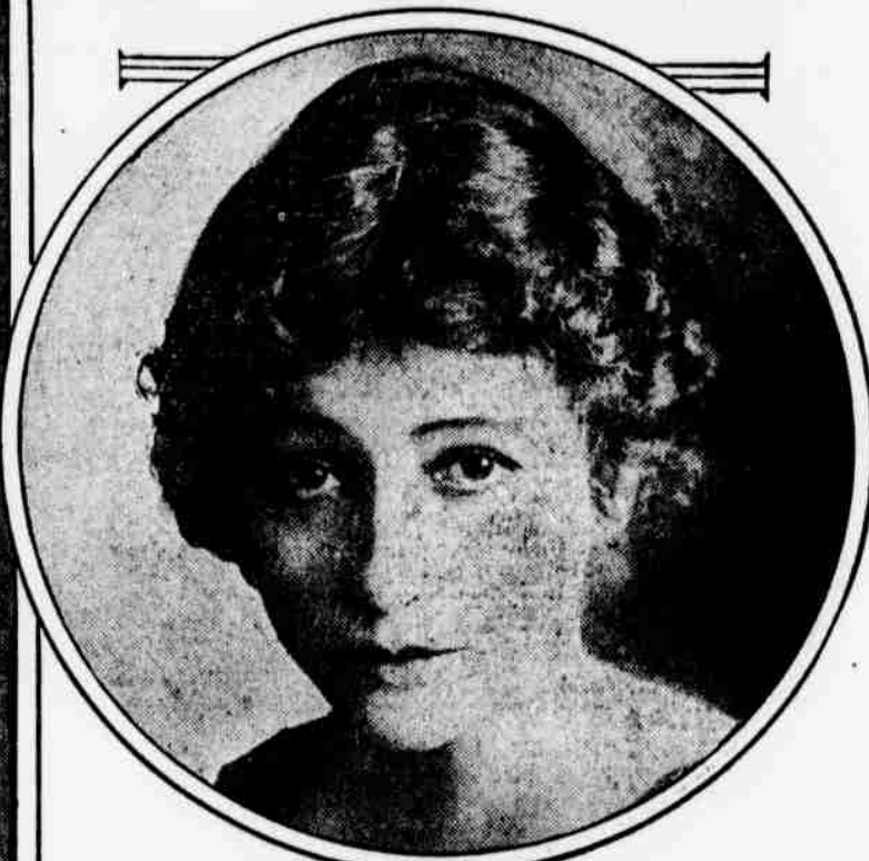
JULIA ARTHUR BOWS TO VAUDEVILLE IN A NEW PLAYLET AT KEITH'S