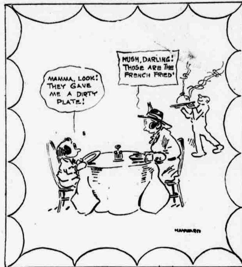
THE PADDED CELL

MAMMA, LOOK! THEY GAVE ME A DIRTY PLATE!