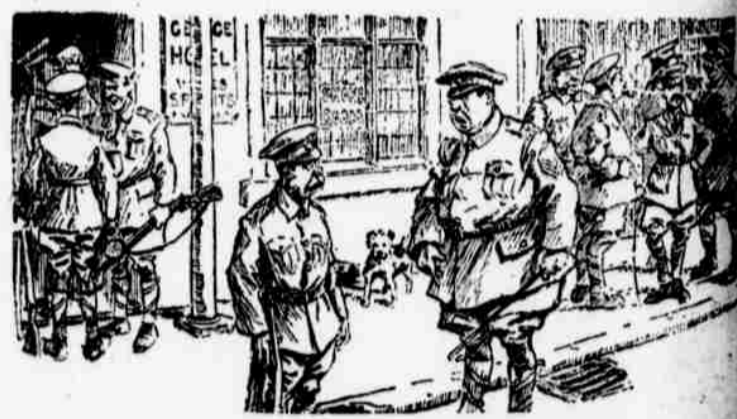
THE SUNDAY ROUTE MARCH

The Sergeant—Call yourself a volunteer! Grousing because you've got to stand guard over the regimental baggage? The Sentry—I didn't volunteer to stand about doing nothing when everybody else is drinking beer. I wouldn't mind if there was any regimental baggage to stand guard over; but when there ain't, it says it's cruelty to animals to pretend there is!