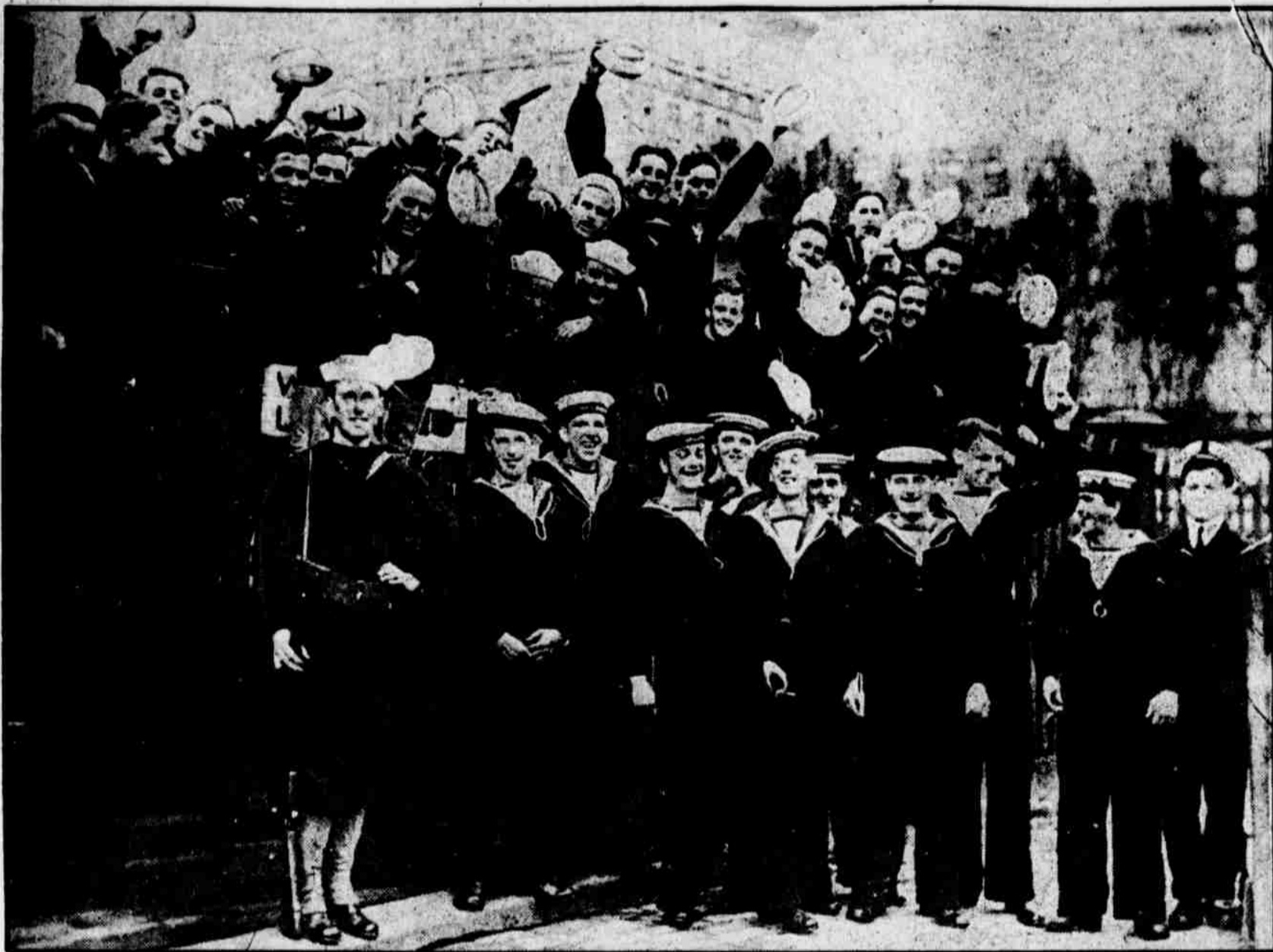
AMERICAN SAILORS WELCOME BRITISH TARS TO NEW YORK Uncle Sam's jackies, shown in background, fraternize with seamen from H. M. S. Roxburgh upon arrival of that cruiser in the United States. The visitors appear to be glad of the opportunity to abandon their "sealegs" after their patrolling cruise "somewhere in the Atlantic."