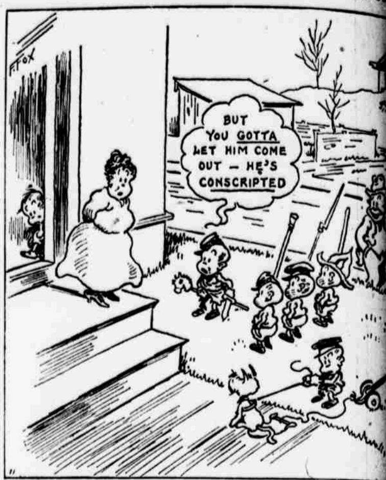
THE LAST DESPERATE EFFORT TO MAKE HIS MA LET JIMMY GO

In These Days of War He—You say you are a pacifist? What would you do if a great brute seized you unawares and kissed you? She—I should turn the other cheek. —Lampoon.