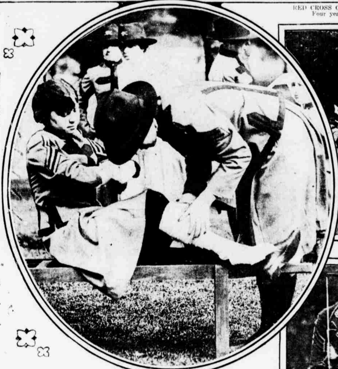
OGONTZ SENIORS ARE TRAINED IN THE DIFFICULT ART OF BANDAGING AND ARE REQUIRED TO PASS A GOVERNMENT EXAMINATION