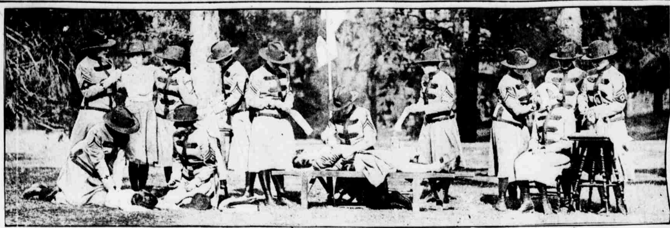
RED CROSS CORPS OF THE OGONTZ SCHOOL REHEARSING ITS NOBLE WORK Four years ago first-aid training was incorporated into the course for seniors.