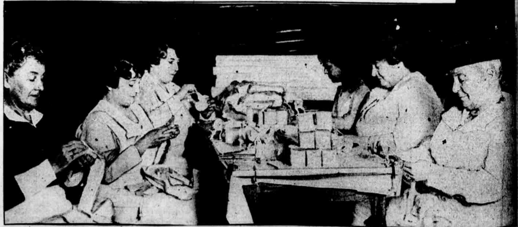
VOLUNTEER WORKERS PREPARE BANDAGES AT THE EMERGENCY AID WORKROOM IN THE CROZER BUILDING More women are needed there to prepare hospital supplies, and applicants are urged to present themselves for instruction in the work.