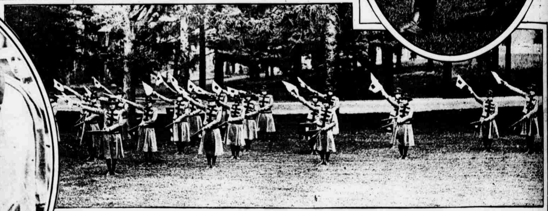
THE OGONTZ SEMAPHORE CORPS PRACTICES AT WIGWAGGING