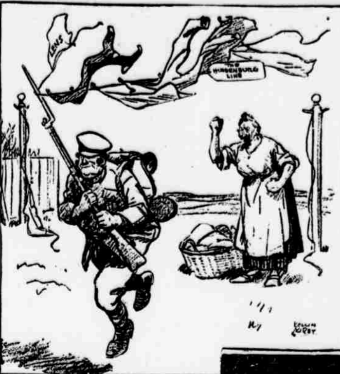
STRAIGHT THROUGH IT. Kirby in N.Y. World.