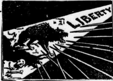
THE LAST STAND.

TRENTON, May 9.—Declaring that the raising of a military force by selective draft is necessary "to successfully resist the mercenary domination of militarism with which all free peoples of the world are threatened," Governor Edge today issued a proclamation fixing the date to be named by President Wilson for the registration and