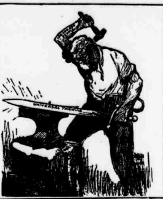
THIS IS A NATION'S WAR.