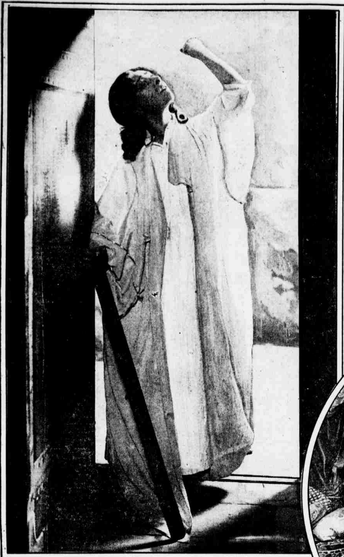
"CEPTION SHOALS" BRINGS ALLA NAZIMOVA IN A NEW ROLE TO THE ADELPHI