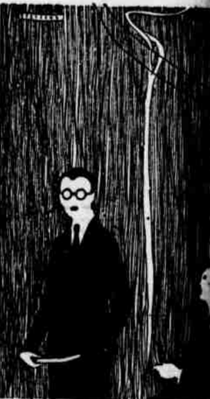
An Amiable Chap

"What kind of a fellow is he?" "Oh, he's the kind of a fellow who goes out for a walk with you and tells you how democratic he is afraid to be seen with anybody."