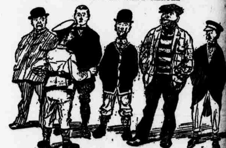
ONE OF THE WAR'S HEROES

—London Opinion "Now then, I'm 'ere to learn yer—you're 'ere to be learnt, and it ain't no use you looking at me like that, No. 4, unless you're looking for trouble!"