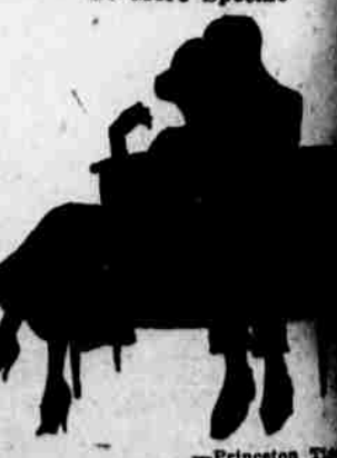
Be More Specific

—Princeton Times "Let me see—was it you that I hit in the conservatory last night?" "About what time, please?"