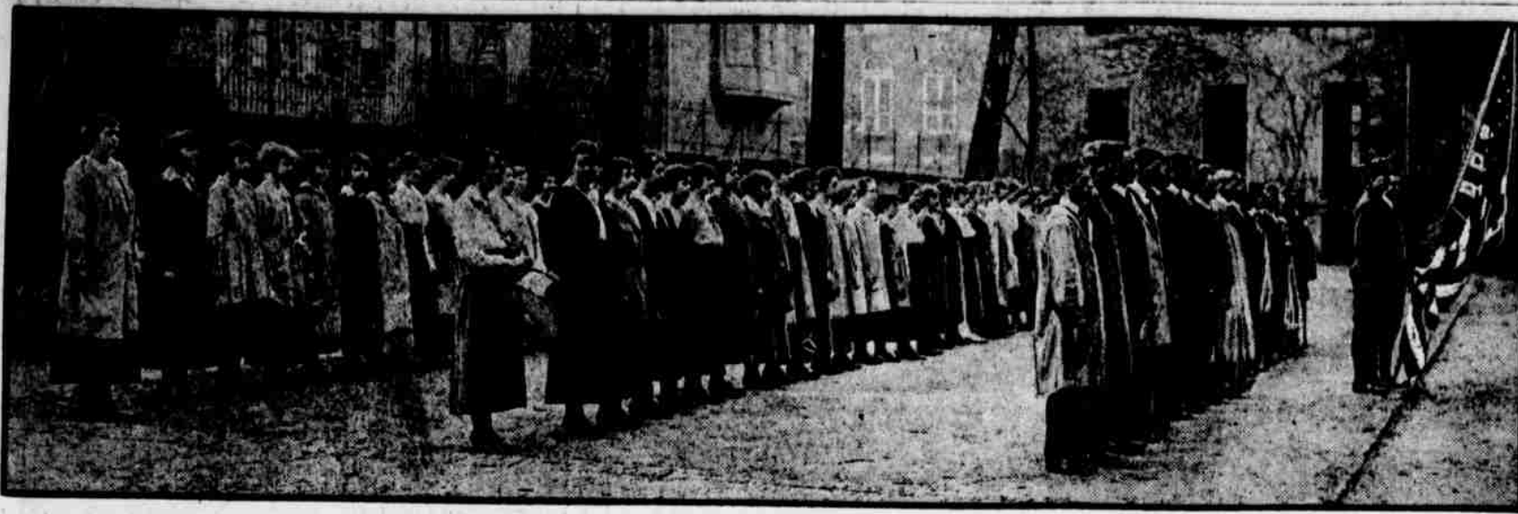
HANDICRAFT STUDENTS ALSO PRACTICE MILITARY TACTICS The manual of arms has been by no means neglected at the School of Industrial Art