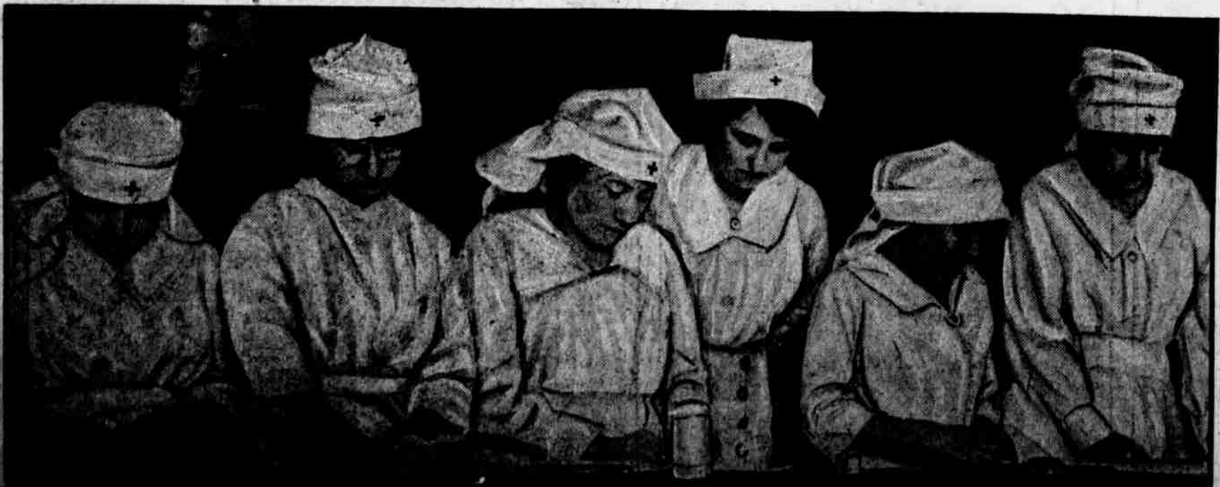
CRIPPLED THEMSELVES, THEY AID OTHER UNFORTUNATES

"Well, Maggie, I certainly am tired," said the laborer in the sewer when he got home. "Tired, is it? You don't know when you're in luck. Here I have been at the washtub all this hot day and you've been working in a sewer."