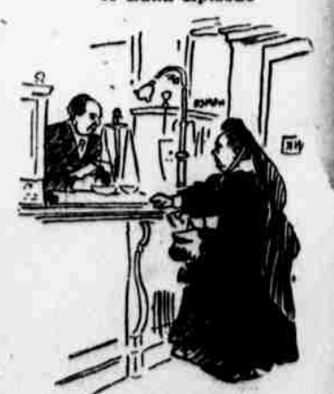
A Bank Episode

—The Tailor Mrs. Jenkins (wishing to convert 4 1/2 per cent into 5 per cent war loan)— Shall I have to have a form of conversation or must I have to get a power of attorney?