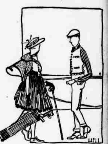
So to Speak

"I drove a hundred yards yesterday with a niblick." "That's nothing; I drove four miles yesterday." "So? What with?" "A Buick."