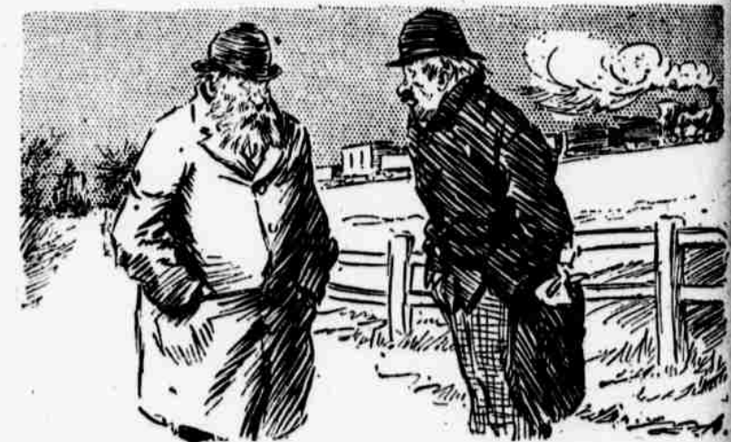
The Pinch of War

First Tramp—This war is a curse, Bill. Second Tramp—It's awful, Tom. Every railway truck loaded with ammunition! Not a comfortable empty to be found anywhere!