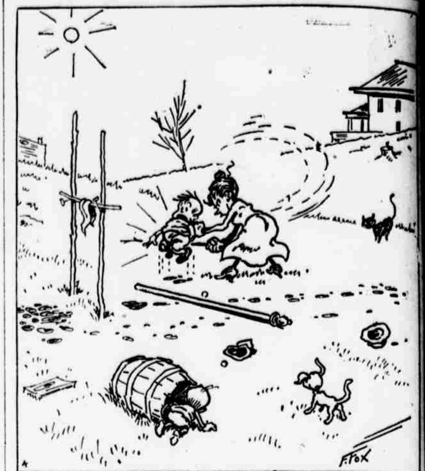
AFTER THE POLE VAULT WITH MA'S BEST CURTAIN POLE THE NEXT EVENT WAS THE STANDING HIGH JUMP

"Do you believe that anything can be caught by kissing?" "Sure! I kissed a girl and she caught me."—Boston Transcript.