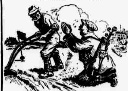
The Horrors of War

—Cassell's Saturday Journal The Golfer's Wartime Lament—Oh, plowman, spare that green!