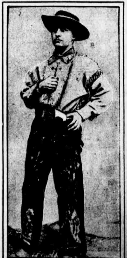
DO YOU KNOW THIS MAN? The EVENING LEDGER will pay $2 for the first correct identification, mailed to the Pictorial Editor.