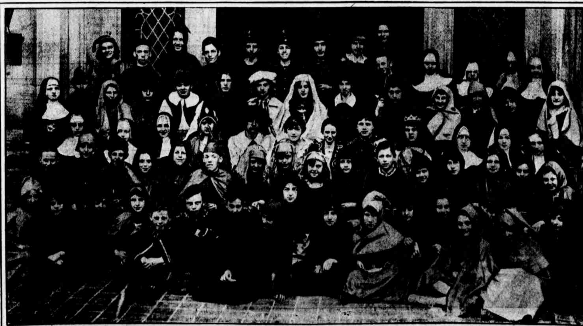
CAST OF "THE PIPER" TO BE PRESENTED TONIGHT BY "THE SOCK AND BUSKIN," UNDER THE AUSPICES OF THE FATHERS' ASSOCIATION OF THE FRANKFORD HIGH SCHOOL