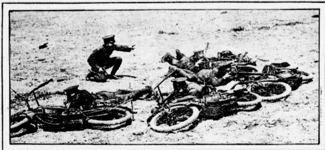
CYCLE DIVISION STANDING OFF AN ATTACK Men of the First Armored Motor Battery of New York practicing the war game. They use their machines as shields very much as the cavalry scouts did of old with their mounts.