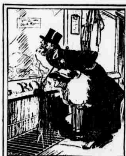
From London Opinion. THEIR MEATLESS DAYS