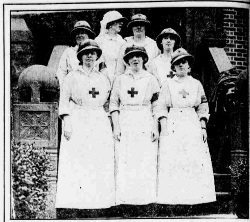
GROUP OF WASHINGTON WOMEN WHO, AS VOLUNTEER RED CROSS WORKERS, ARE DISTRIBUTING TOBACCO, CANDY AND NEWSPAPERS AMONG THE GUARDSMEN AT FORT MYER