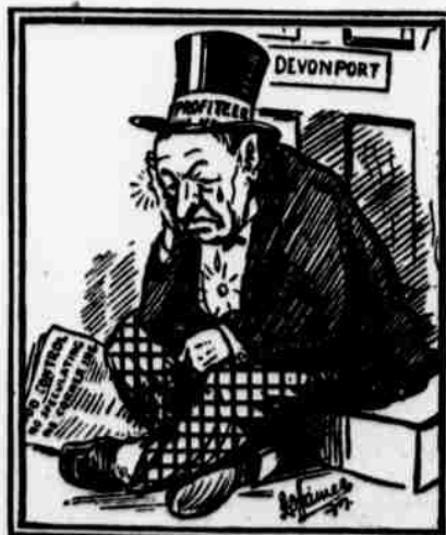
From the Star. "NOBODY LOVES ME" The powers of the Food Controller will be exercised to check any exploitation.—Lord Devonport.