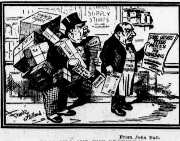
From John Bull. FOOD HOG AND THE PROFITEER The food hog and the profiteer were busy in the land: They went like anything to read the orders just to hand. "If they were only swept away," they said, "it would be grand."