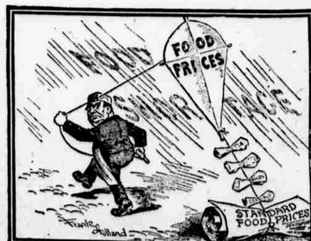
From Reynolds's Newspaper. HIS SPORT CURTAILED The food profiteer: "Here's a nice meal! There's an ill wind blowing, and Devonport won't let it blow me any good."

THE CARTOONISTS' PORTRAYAL OF THE CRITICAL FOOD SITUATION "ACROSS SEAS" BEARS ESPECIAL INTEREST TO AMERICA, WHICH ALSO IS FACING SERIOUS DEPRIVATION