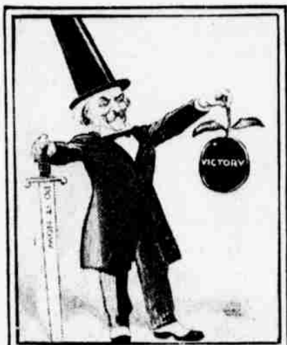
From the Bystander. RARE AND REFRESHING FRUIT—1917 CROP