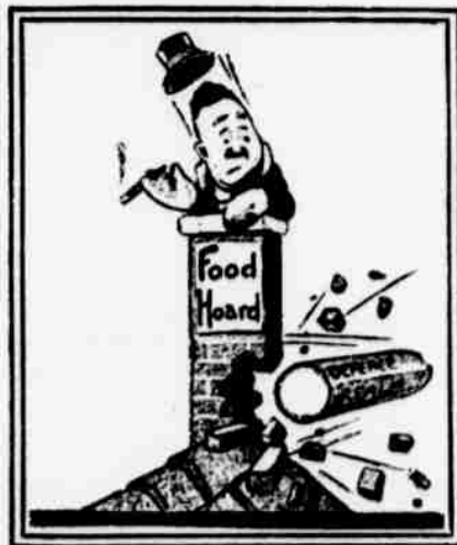
From London Opinion. THE FOOD HOARDER: "THEY'VE EVIDENTLY SEEN ME."