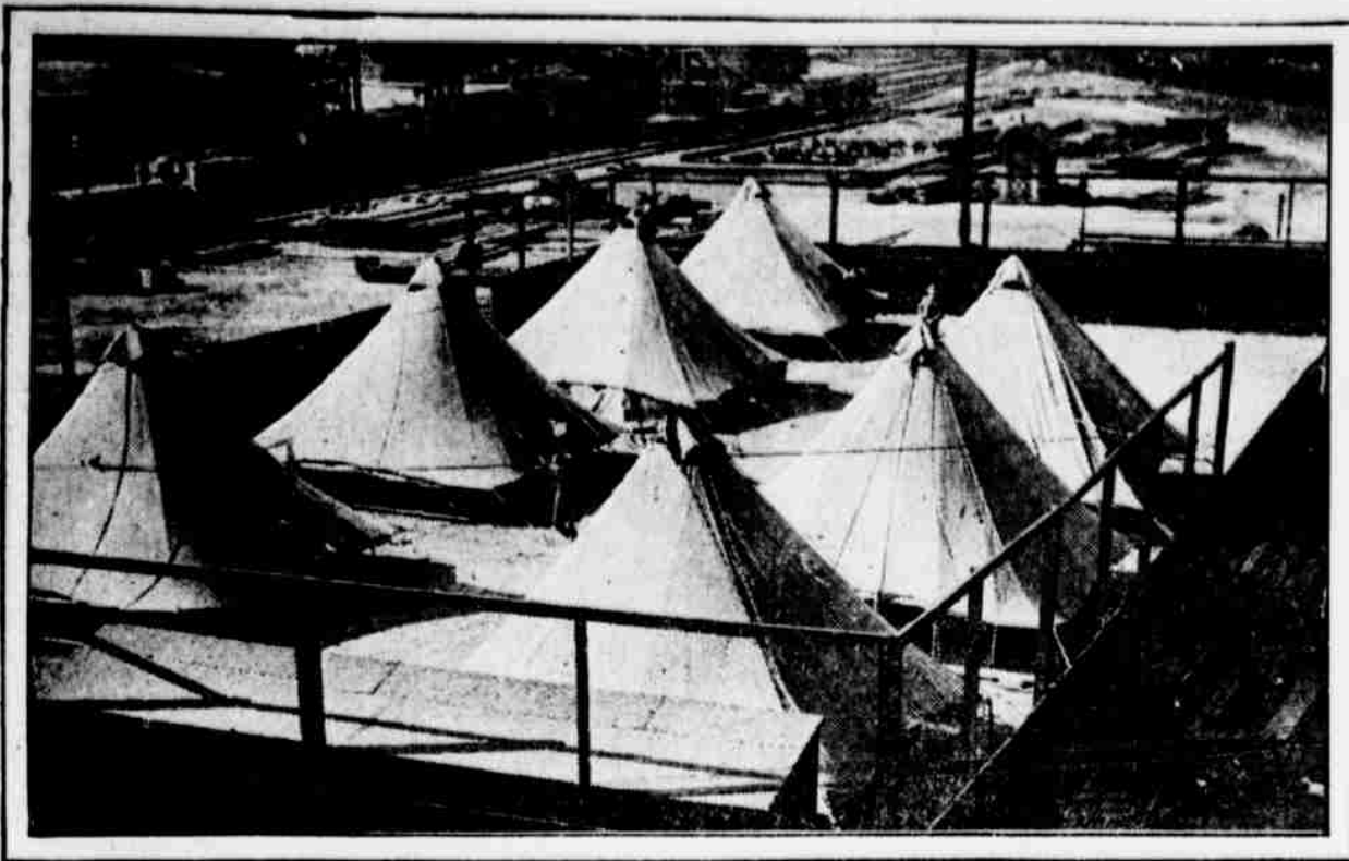
A WAR CAMP "SOMEWHERE IN PHILADELPHIA" Comfortable quarters of guardsmen who are doing valuable service in safeguarding vital lines of communication right here at home.