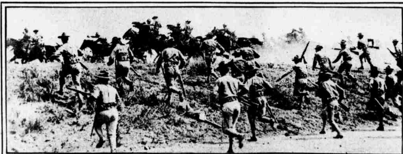
A MODERN VERSION OF "CAPTAIN JINKS AND THE HORSE MARINES" Illustrating the strenuous training exacted by Uncle Sam from his sons in the Marine Corps. In the foreground are the mounted men, known as the "horse marines."