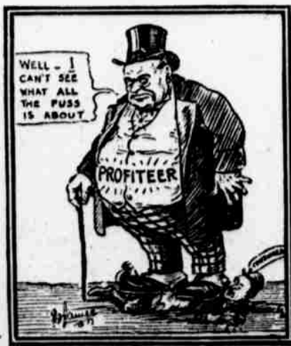
From the London Star. NOTHING TO GRUMBLE ABOUT The profiteer can see no need for a Food Controller over the British Isles