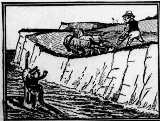
From the People. GOD SPEED THE FLOW John Bull (to U-boat pirate): "Swear away, you scoundrel! So long as you continue putting things down I'll go on bringing things up, and we'll see who wins in the end."