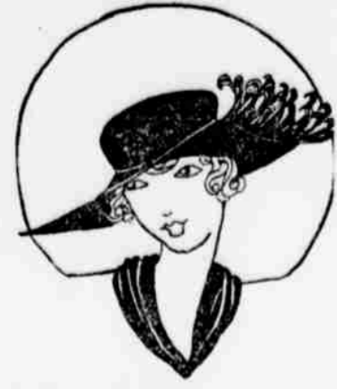
An interesting hat because of its many sides and angles—there are three of each. One side is fringed with wisps of feathers.

than?—for either without the other is a lame and imperfect being. The lady may in her softness, be facile, and fall at some crisis for lack of iron in her. The Christian, on the other hand, who is imperfectly a lady is capable of keeping for her nearest and dearest a self so unimpaired that not one person of her acquaintance would recognize it as a portrait of her.