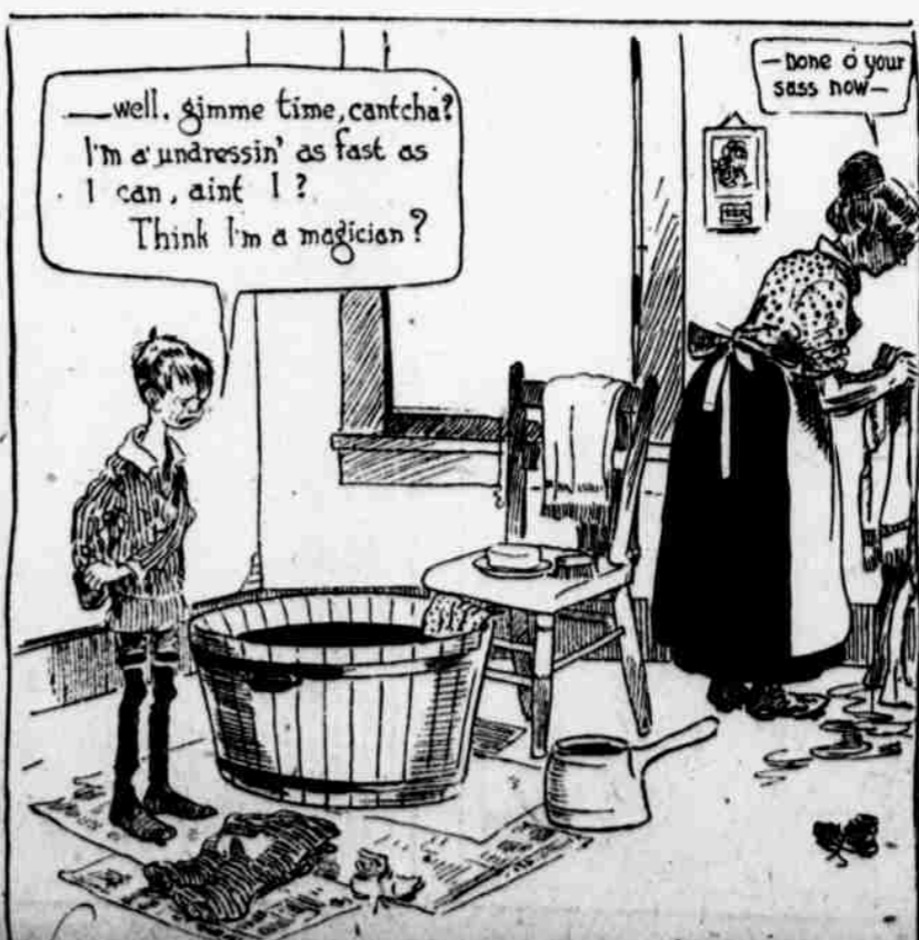
—well, gimme time, cantcha? I'm a'undressin' as fast as I can, aint I? Think I'm a magician?