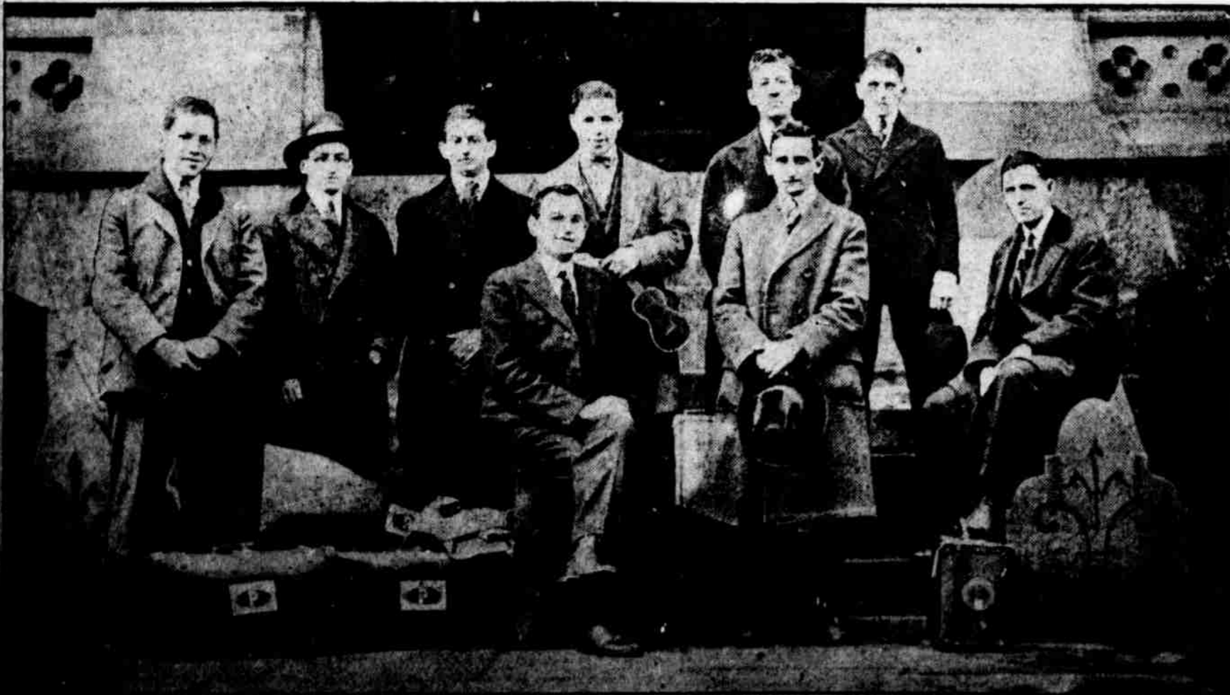
FIRST SQUAD OF PENN FARMING RECRUITS DEPARTS The recruits are being sent to the front lines to help in the war effort.