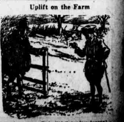
Uplift on the Farm —Cassell's Saturday Journal Farmer—Now, then, what about those cows?