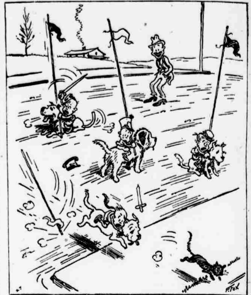
—By FONTAINE FOX.