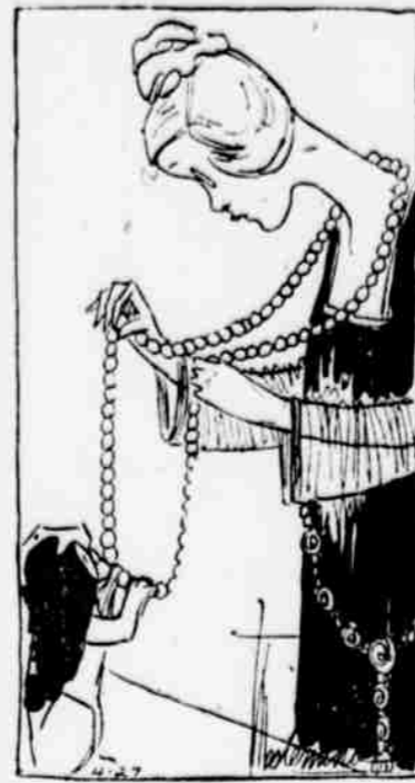
The young lady across the way says her father is awfully sympathetic, and she often overhears him express the gravest concern about the poor war brides.