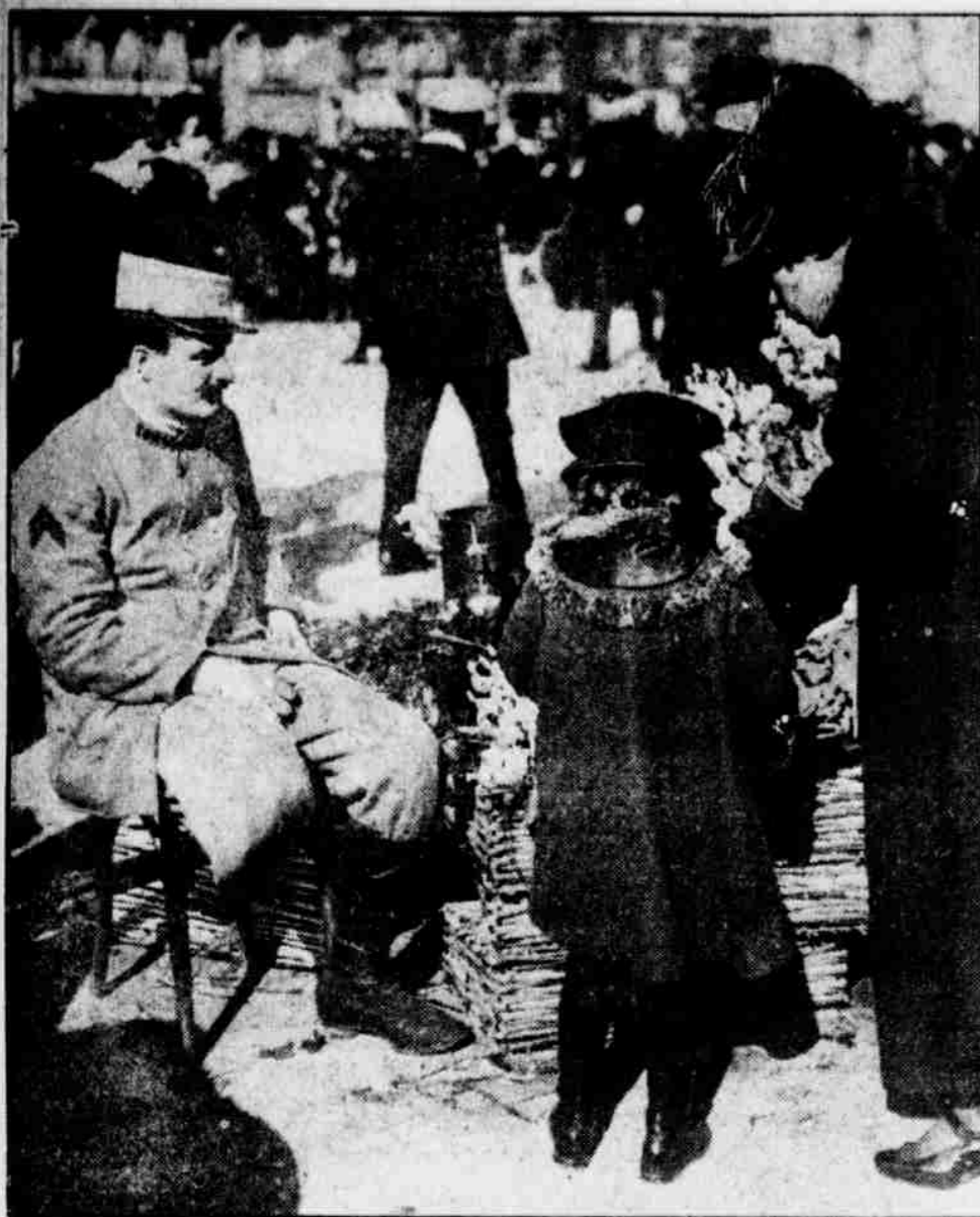
MAIMED FRENCH SOLDIER EARNS A LIVELIHOOD SELLING FLOWERS ON THE STREETS OF WHAT WAS ONCE "GAY PARIS"