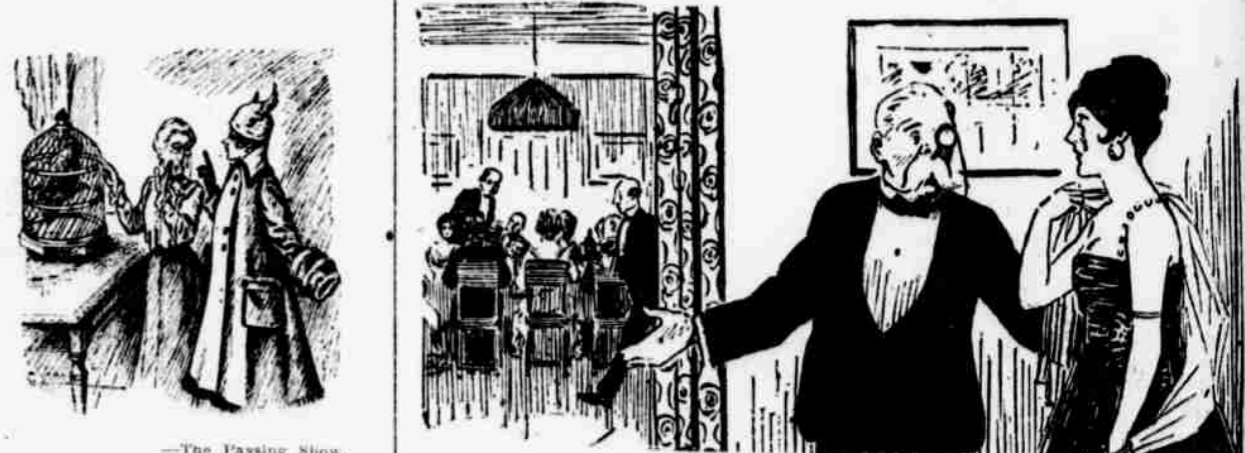
"Sh-sh, dear! Please don't say 'sweet'! I'm trying to get him to stop brooding over the reduction of his sugar ration!"