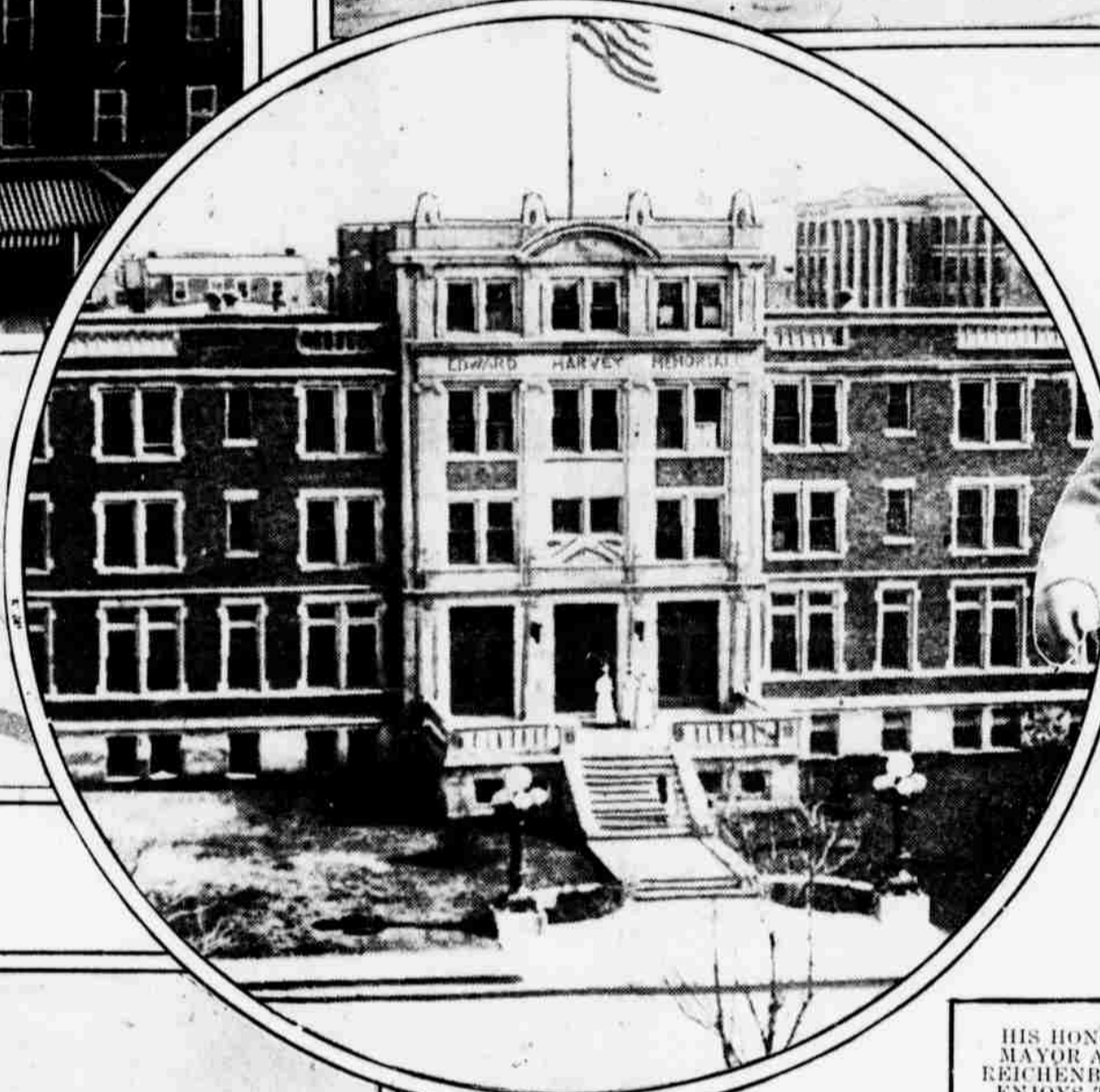
THE EDWARD HARVEY MEMORIAL BUILDING, A NURSES' COLLEGE WITH ACCOMMODATIONS FOR 700 WOMEN