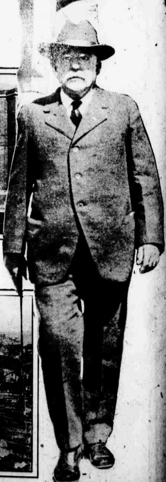
COLONEL HARRY C. TREXLER, QUARTERMASTER GENERAL OF THE NATIONAL GUARD IN A TYPICAL