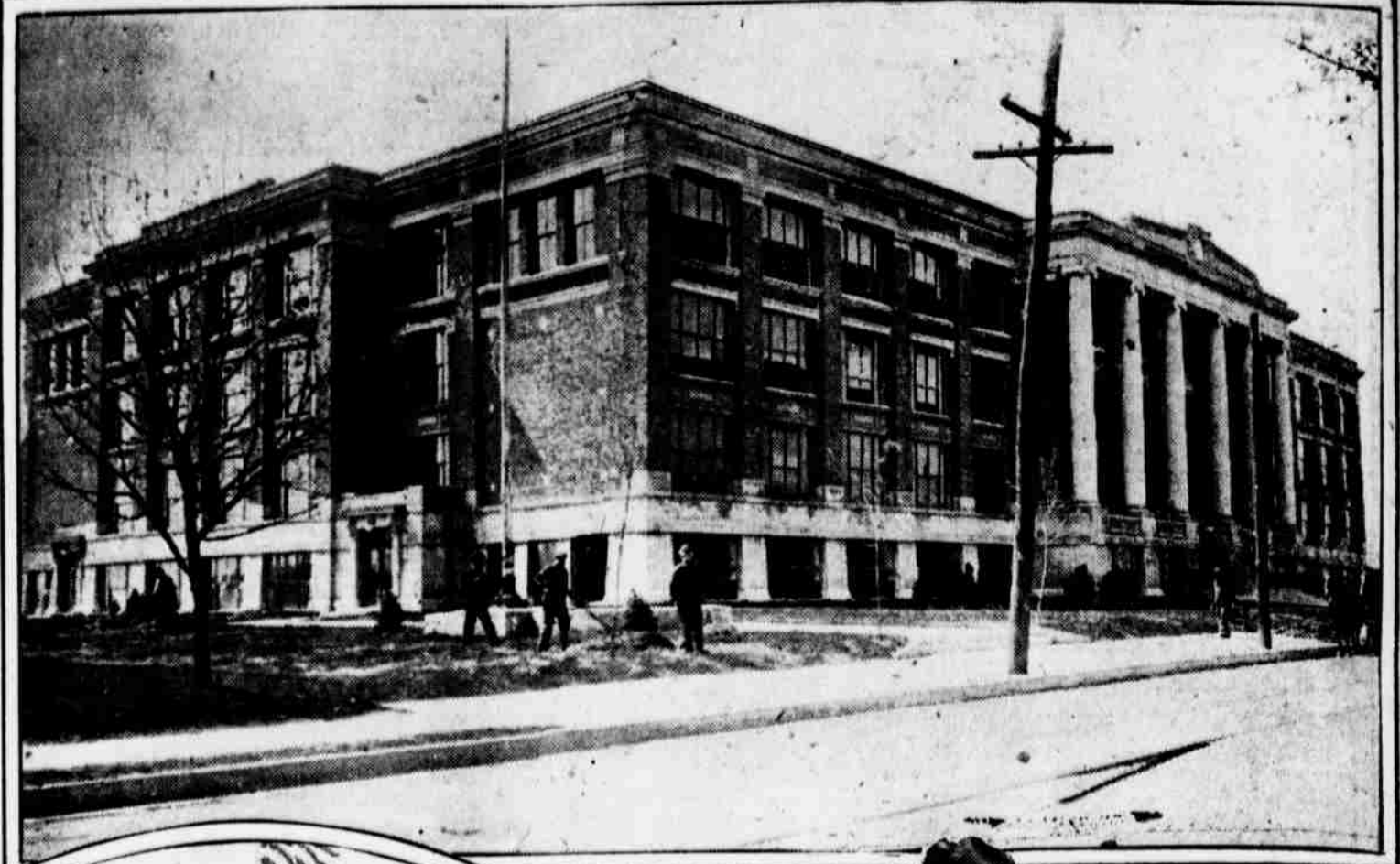
ALLENTOWN'S LATEST DONATION TO THE CAUSE OF EDUCATION—ITS MILLION-DOLLAR HIGH SCHOOL