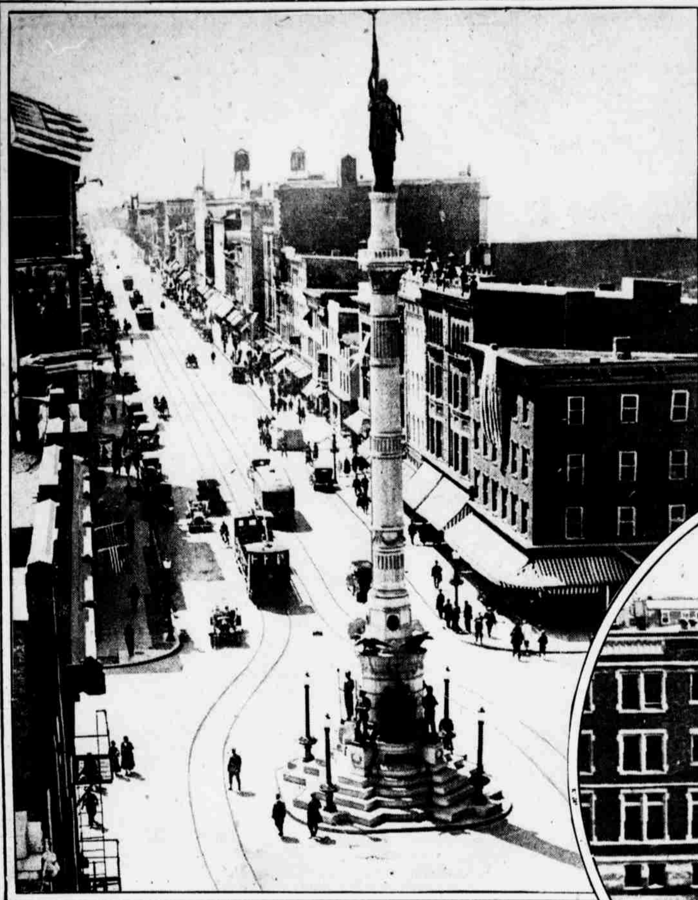
THE SOLDIERS AND SAILORS' MONUMENT OVERLOOKS HAMILTON STREET AT THE CENTER OF THE CITY'S BUSINESS DISTRICT