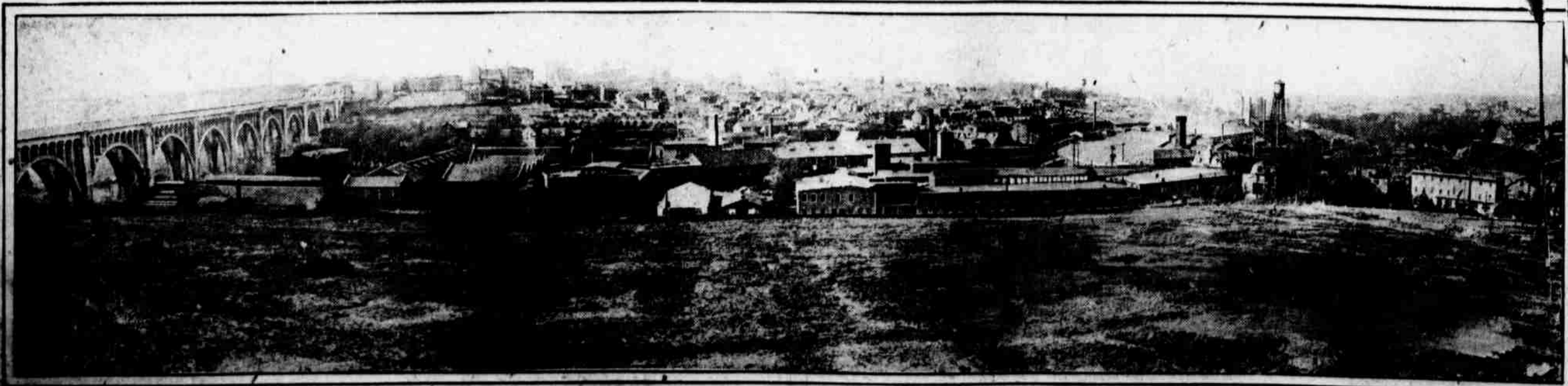
FROM SOUTH ALLENTOWN THE VISITOR MAY OBTAIN A GENERAL VIEW OF THE LEHIGH VALLEY METROPOLIS THAT LEAVES INDELIBLE IMPRESS OF INDUSTRY AND OF FUTURE GROWTH