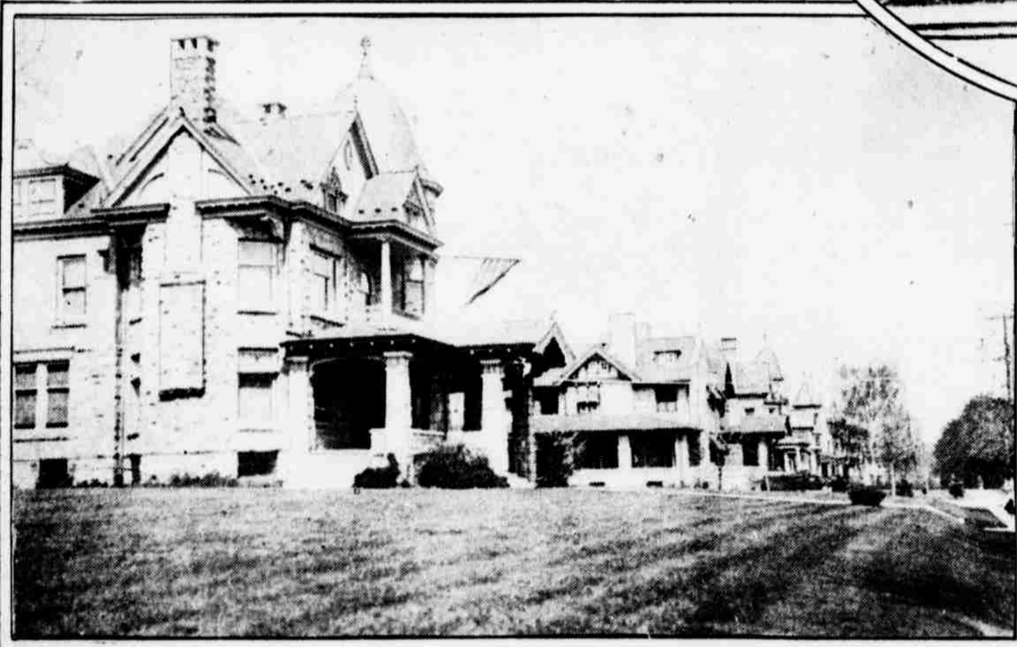
THE PORTION OF HAMILTON STREET REMOTE FROM THE BUSINESS DISTRICT CONTAINS THE HOMES OF LEADING ALLENTOWN FAMILIES