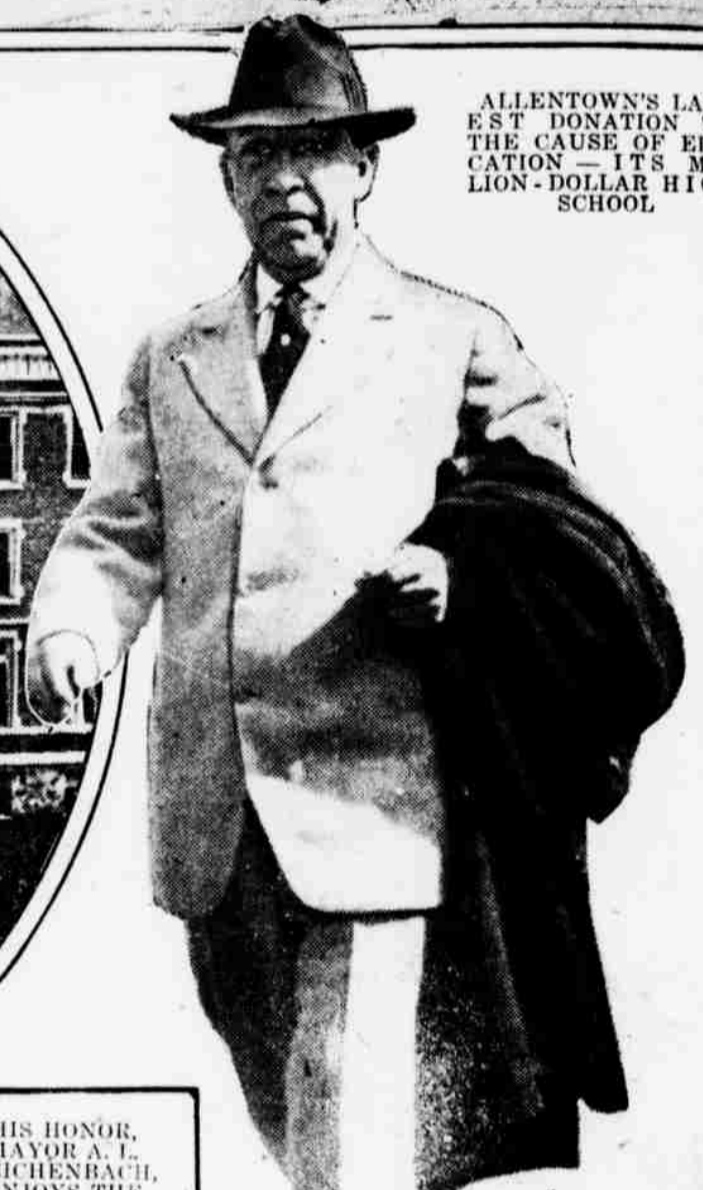
HIS HONOR, MAYOR A. L. REICHENBACH, ENJOYS THE TITLE OF "PRINCE OF ALLENTOWN" WITH TRUE DEMOCRATIC NONCHALANCE