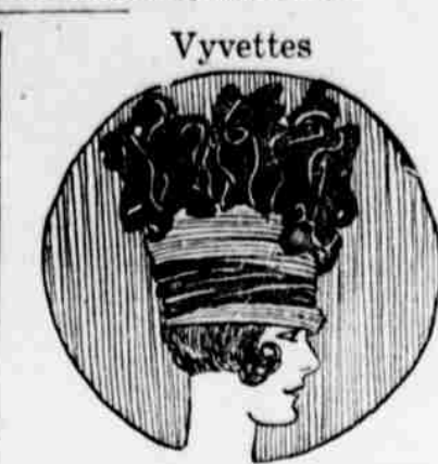
A straw hat with decidedly upward tendencies.

instance, to do without sugar in coffee or tea. While the shortage of sugar has not yet been felt over here, it undoubtabnormal and criminal rise in prices.