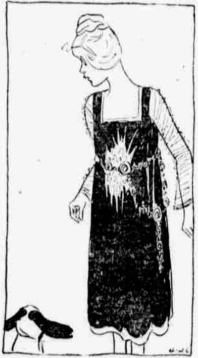
The young lady across the way says she's been studying German history lately and is convinced that Bismarck was the greatest of all the Hohenzollerns.