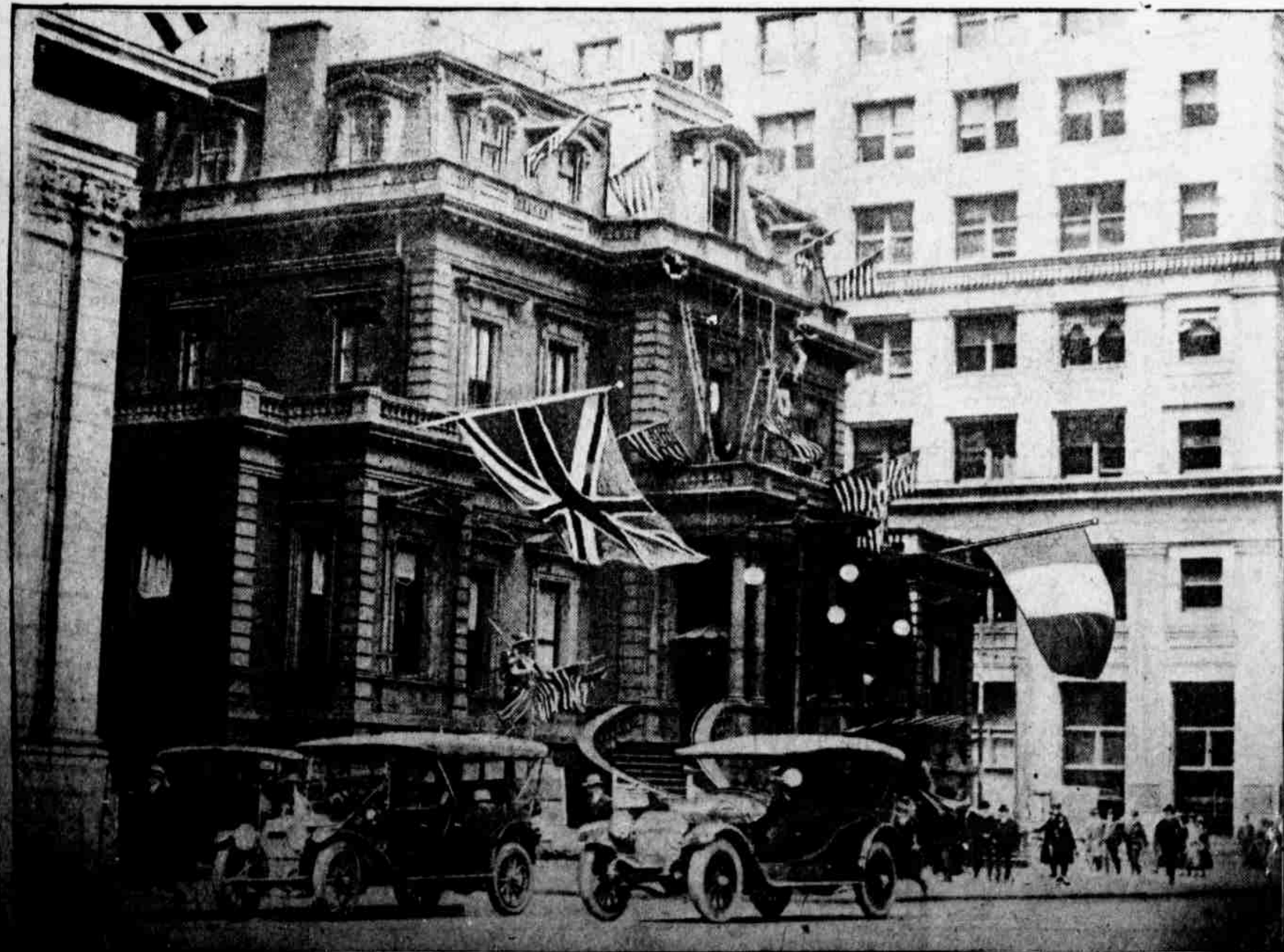
NEW ALLIANCE SYMBOLIZED BY FLAGS OF UNITED STATES, ENGLAND AND FRANCE DISPLAYED AT UNION LEAGUE

How to Dress Up a House Give it a Coat of paint. Provide every window with a Sash. See that it has plenty of Drawers. Put a stone Collar around the well. Use a firm Tie on each window weight. Equip it well with Hose. See that there is a good Cap on the chimney. Put asbestos Jackets around the furnace pipes. See that the steam radiators are fitted with Mullers. Use good Braces wherever necessary.