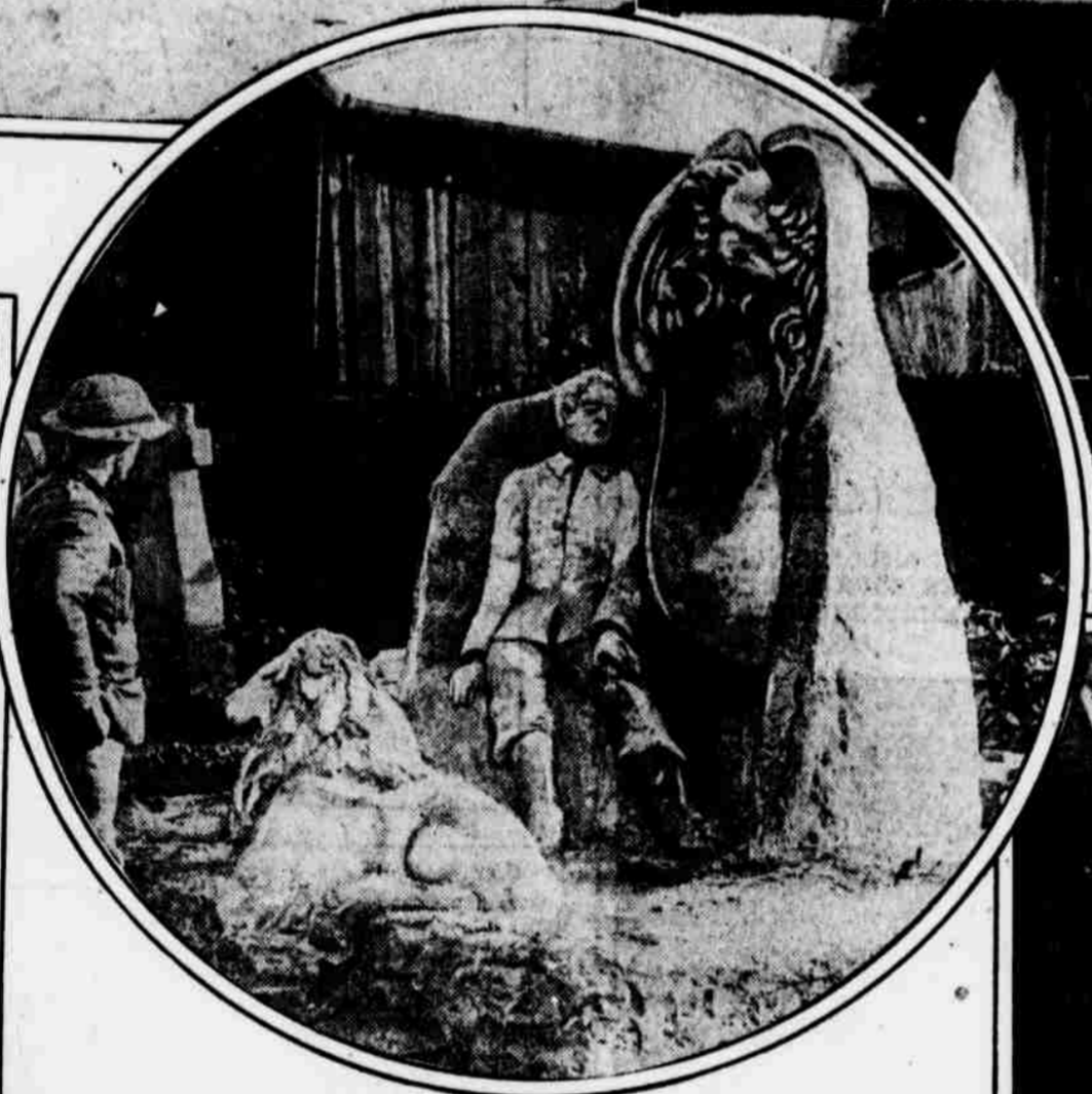
REMEMBERED, THOUGH HE LIES IN ALIEN SOIL. Elaborate monument constructed by retreating Germans to fallen officer in French cemetery at Nesle.