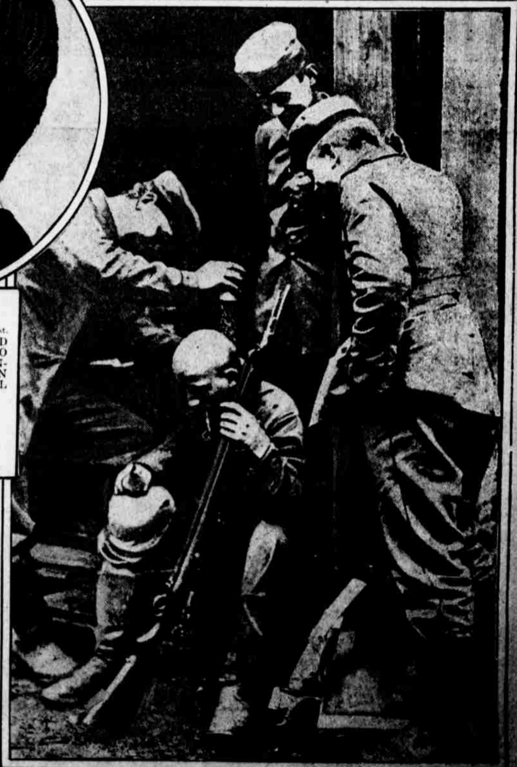
A JOKE'S A JOKE, EVEN IN THE TRENCHES German infantrymen on the western front have a lot of fun.