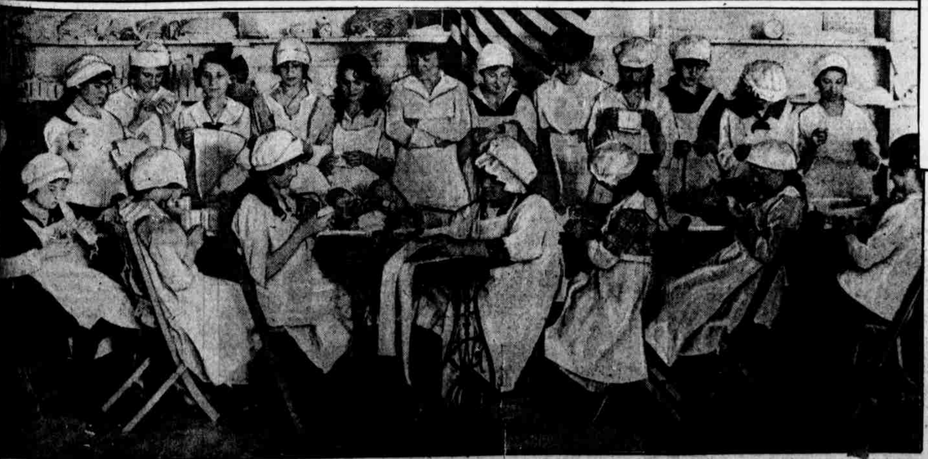
FAIR BANDAGE MAKERS AT THEIR DAILY TASK