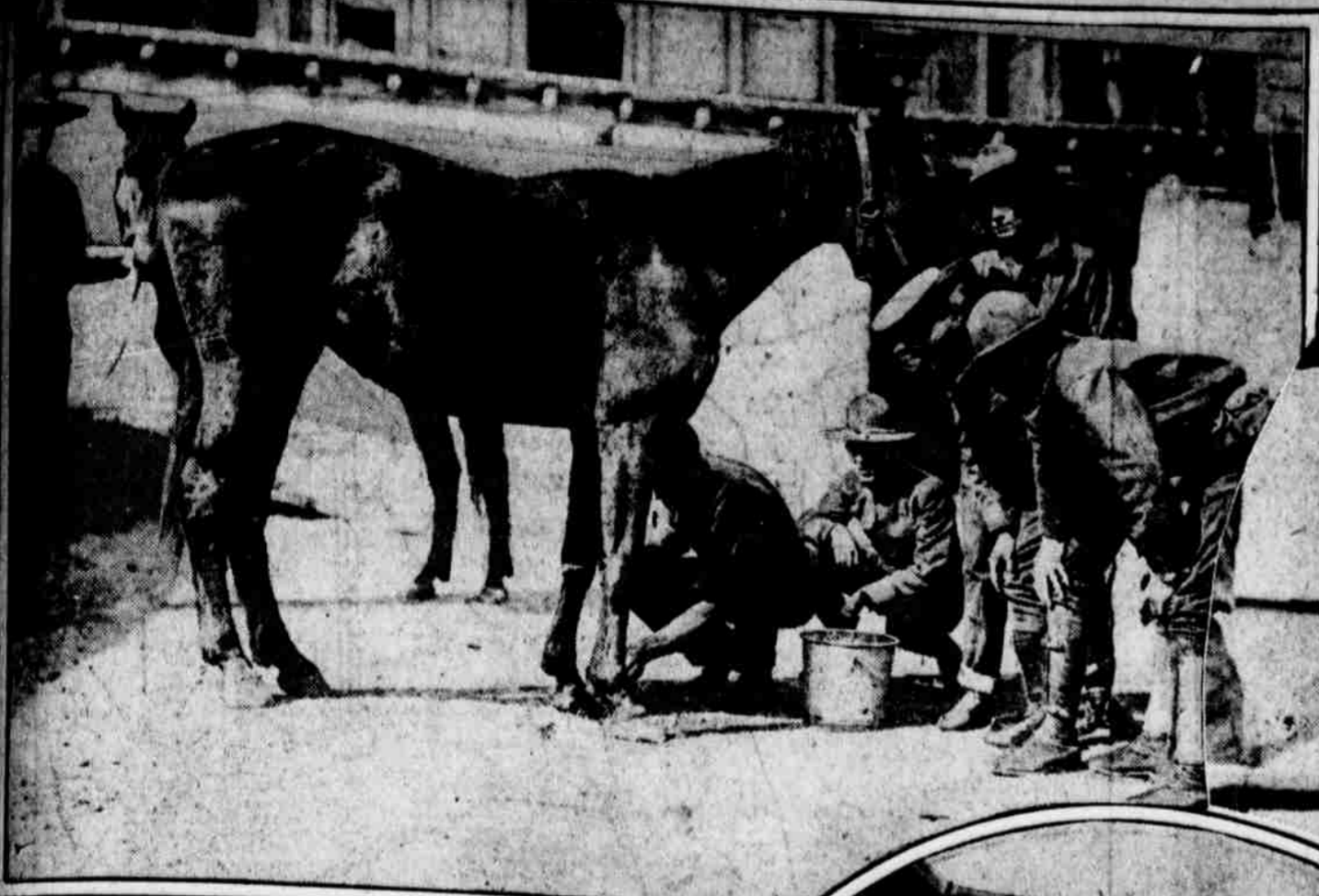
A WILLING RECRUIT FOR UNCLE SAM'S ARMY Branding a newly purchased cavalry mount in a stable "somewhere in Philadelphia."