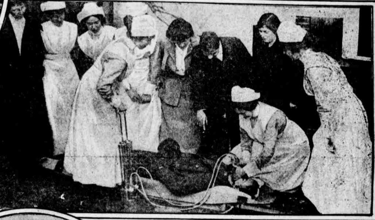
NURSES SHOW PROFICIENCY IN PULMOTOR WORK The Roosevelt Hospital volunteer Red Cross unit is rapidly developing in its mastery of first-aid details.