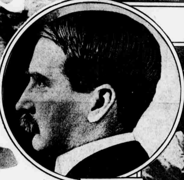
ADMIRAL DAVID W. TAYLOR, WHO AS CHIEF CON- STRUCTOR IS IN CHARGE OF ALL NAVAL SHIP- BUILDING