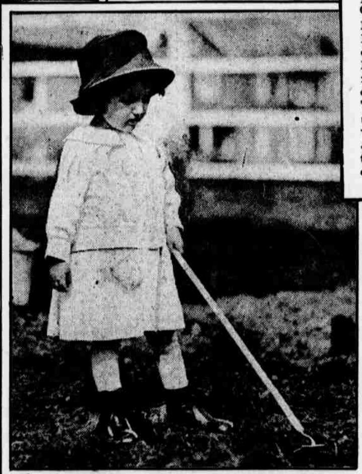
A YOUNG "MAUD MULLER" AT HER TASK Between school sessions this little resident of Philadelphia aids her parents in their efforts at domestic economy.