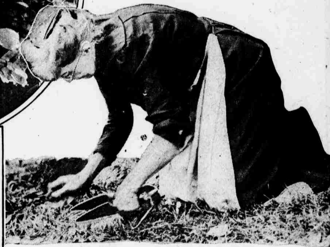
THIS ARMY KNOWS NO AGE LIMIT The Oslerian theory gets a knockout blow from this exponent of the principle that all should "do their bit" to conserve the country's natural resources.