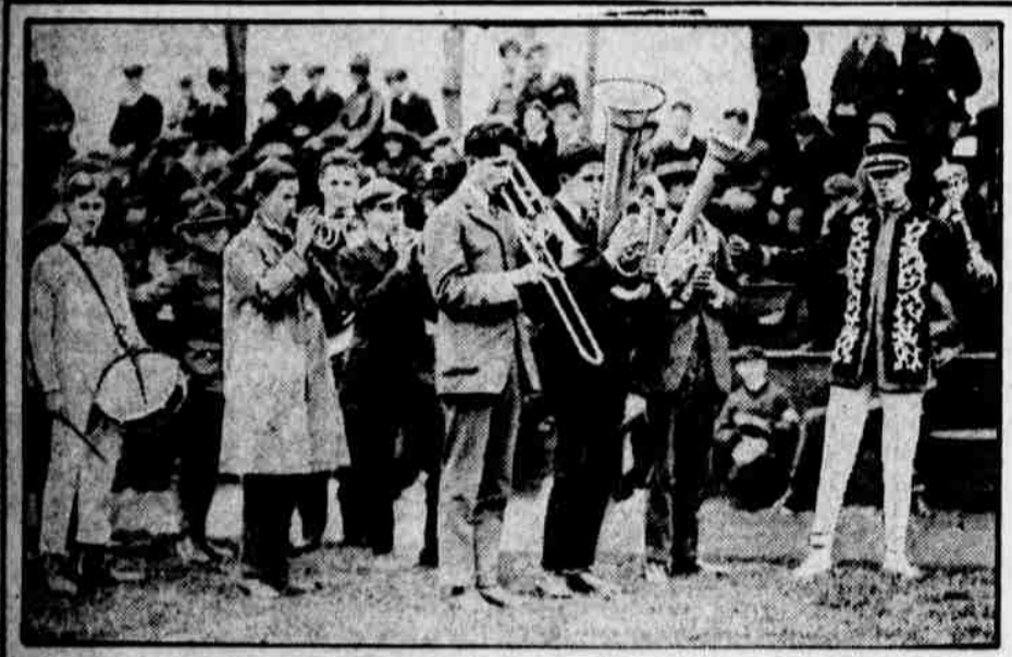
STUDENTS ORGANIZE ZOBO BAND War's serious side doesn't appeal strongly as yet to the boys of Chestnut Hill Academy, but most of them are too young for actual military service, so it really does not matter.