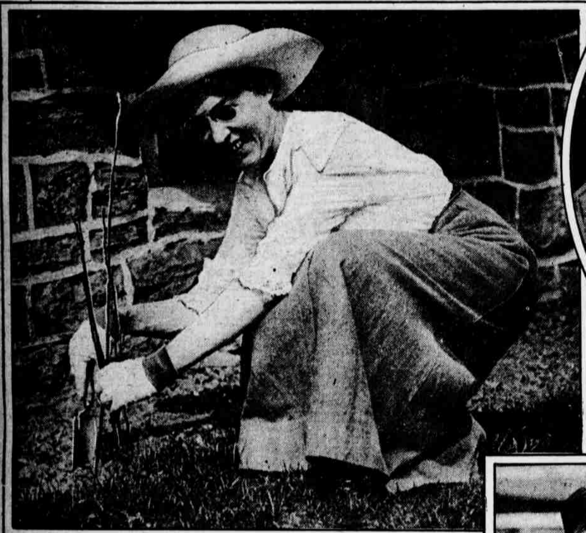
THE THRIFTY HOUSEWIFE IS "PREPARING" A West Philadelphia "home farmer," who is well advanced in her spring campaign against rising prices of vegetables.