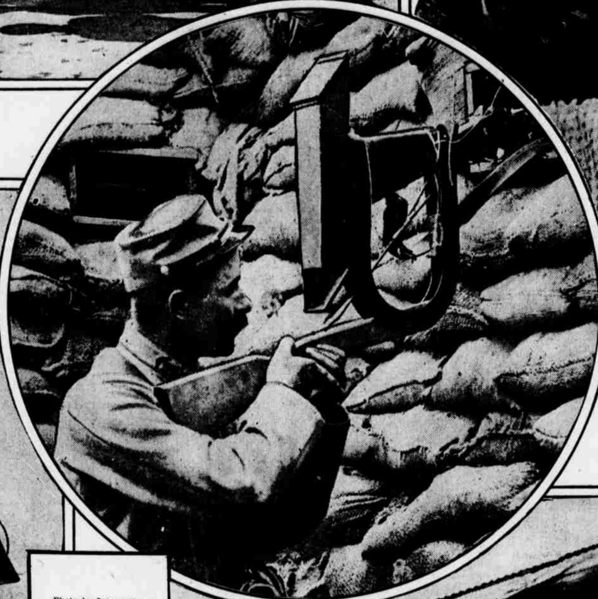
SIGHTING AN UNSEEN FOE AT LONG RANGE Periscope rifle in use by the French in the trenches along the west front.