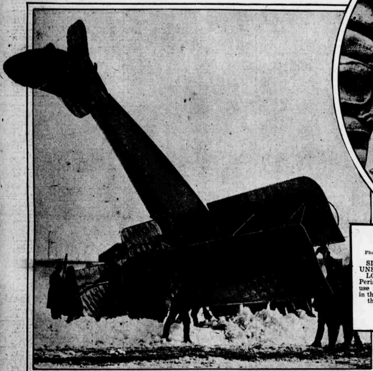
AFTER THE SPILL Righting an airplane which turned turtle at the military aviation field, Mineola, L. I.