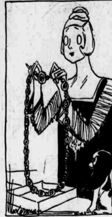
The Young Lady Across the Way

The young lady across the way says she guesses the French people must be pretty well satisfied with their Government as it is, as she hasn't seen a thing in the paper about any movement to establish a republic there.