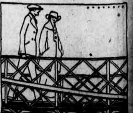
So to Speak

—Cornell Widow. Jack—I saw a carload of wooden legs go through today—they were being sent to Europe. Jill—Rather eloquent protest against war—are they not? Jack—Yes—sort of stump speeches—as it were.