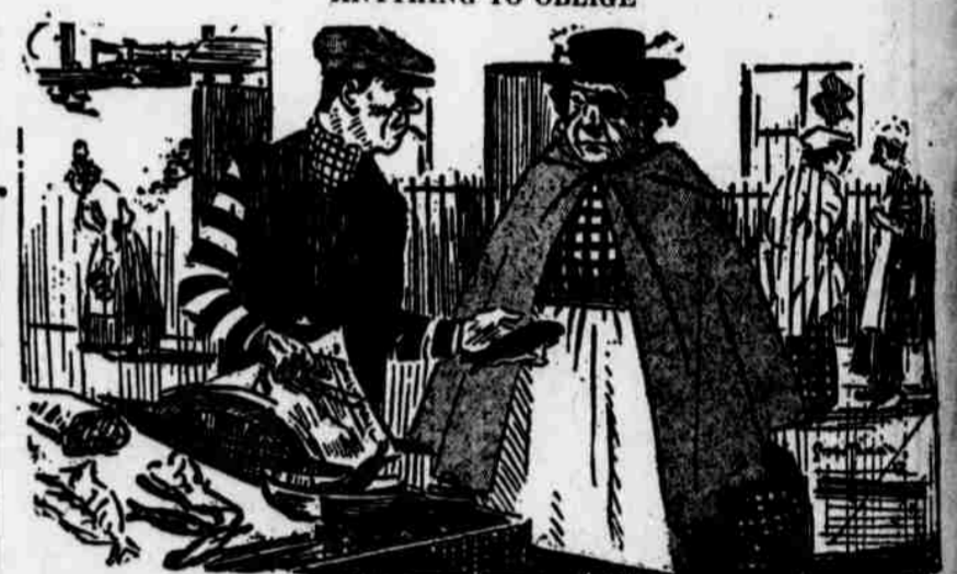
ANYTHING TO OBLIGE

—Cassell's Saturday Journal. "You're quite sure these fish are fresh?" "Fresh, lddy? W'y, if yer likes I'll show yer their birth certificates!"