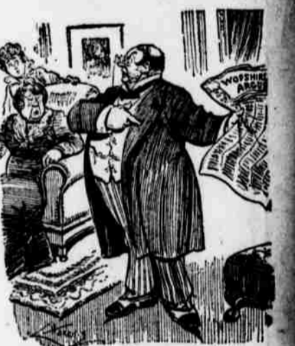
The War Brought Home to Wapahine

—The Passing Show. The Mayor (to his wife)—This is a terrible war, Maria! Wife—What is the matter, dear? The Mayor—Why, owing to paper shortage my great speech at the opening of the new wash houses has been left out!