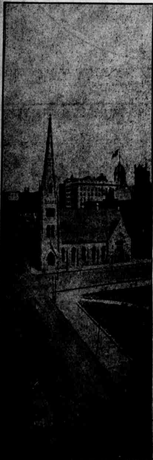
HUNDREDS OF CHURCHGOERS ATTEND BARRATH FLAG...