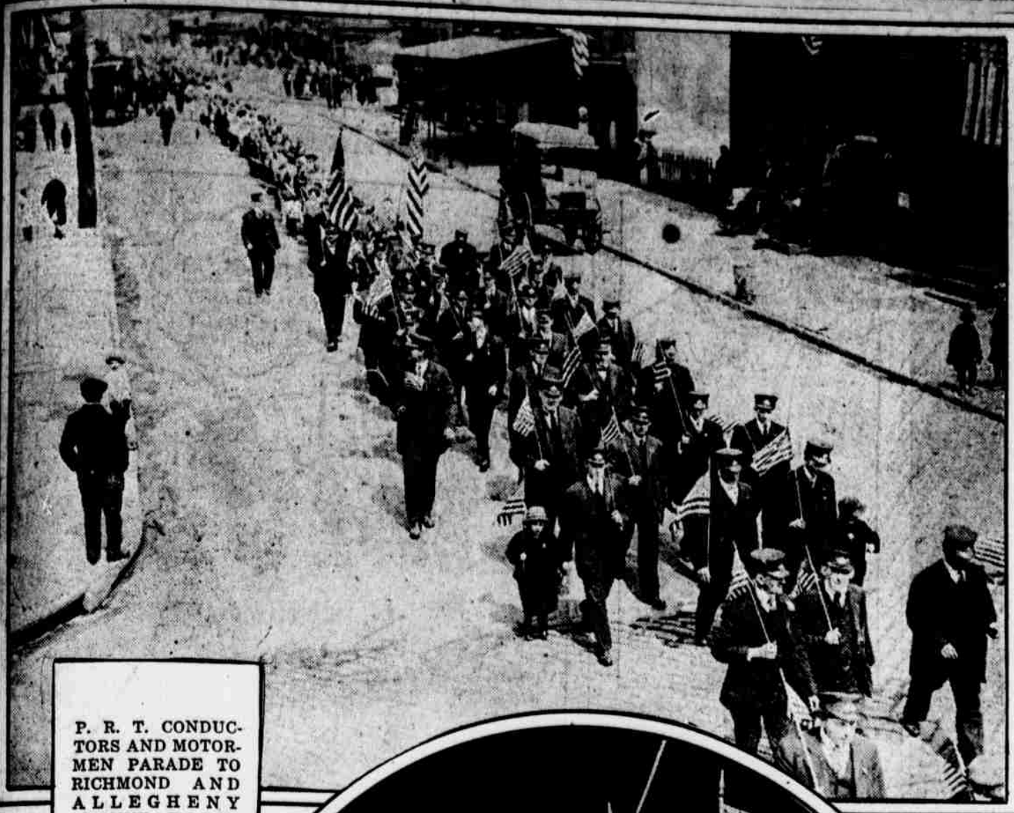
P. R. T. CONDUCTORS AND MOTOR-MEN PARADE TO RICHMOND AND ALLEGHENY AVENUE BARN, WHERE STARS AND STRIPES ARE RAISED