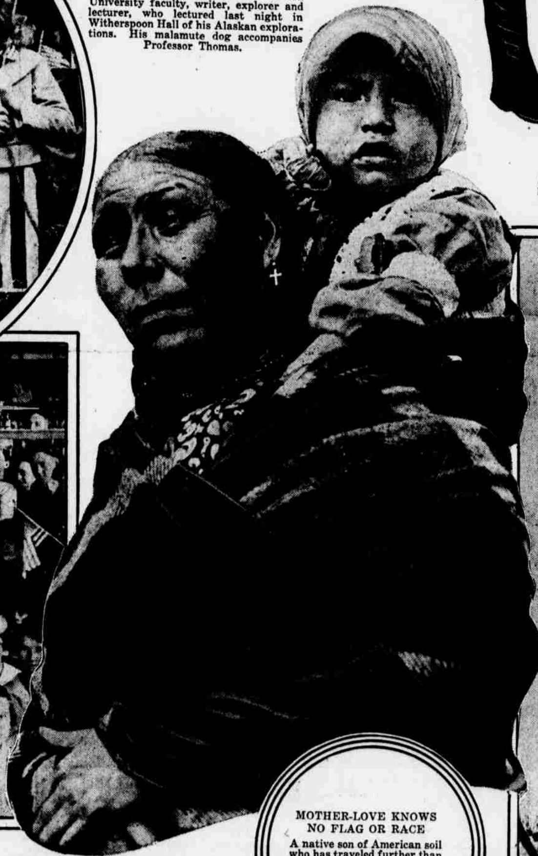
MOTHER-LOVE KNOWS NO FLAG OR RACE

Girl employes of the Steppacher factory, 146 North Thirteenth street, add picturesqueness to the patriotic ceremony by wearing bandeaux of red, white and blue during the exercises. Several hundred deft young needlewomen participated in the program, which took place in the workroom of the establishment and was marked by stirring addresses and singing of national airs.