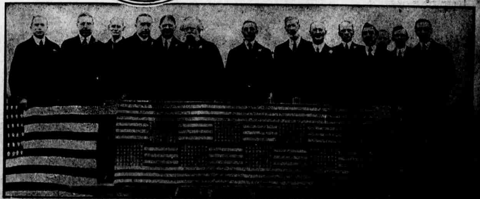
FLAG WAVES IN BREEZE AT GLENOLDEN