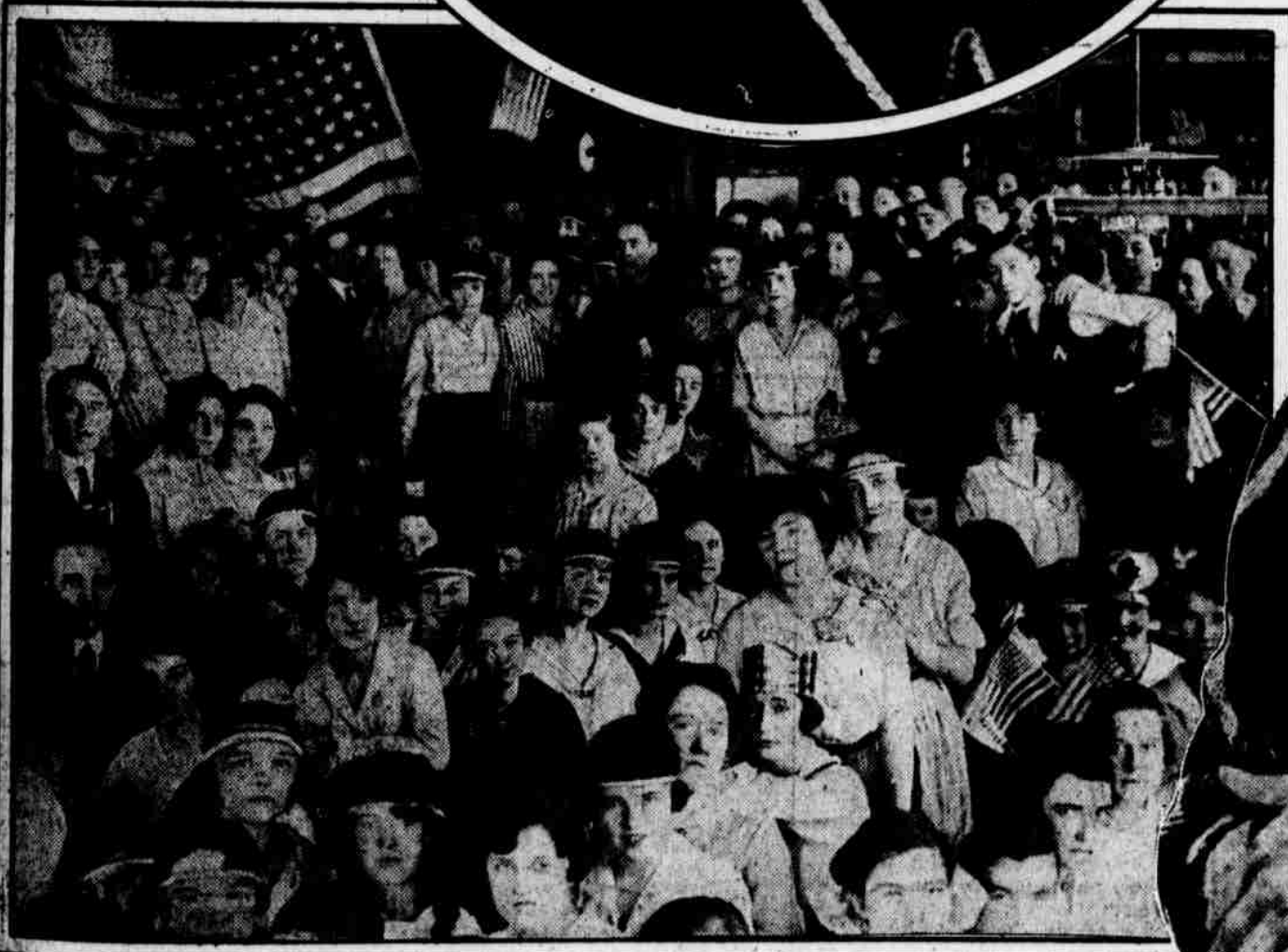
SHIRTMAKERS CHEER AS THEY RAISE FLAG

Girl employes of the Steppacher factory, 146 North Thirteenth street, add picturesqueness to the patriotic ceremony by wearing bandeaux of red, white and blue during the exercises. Several hundred deft young needlewomen participated in the program, which took place in the workroom of the establishment and was marked by stirring addresses and singing of national airs.