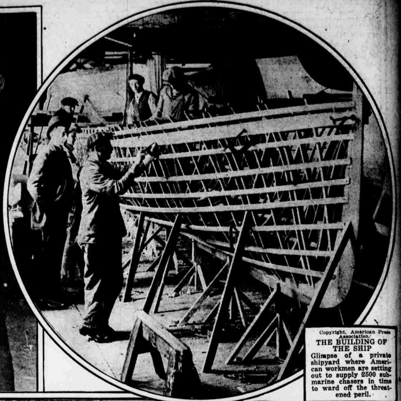
THE BUILDING OF THE SHIP Glimpse of a private shipyard where American workmen are setting out to supply 2500 submarine chasers in time to ward off the threatened peril.