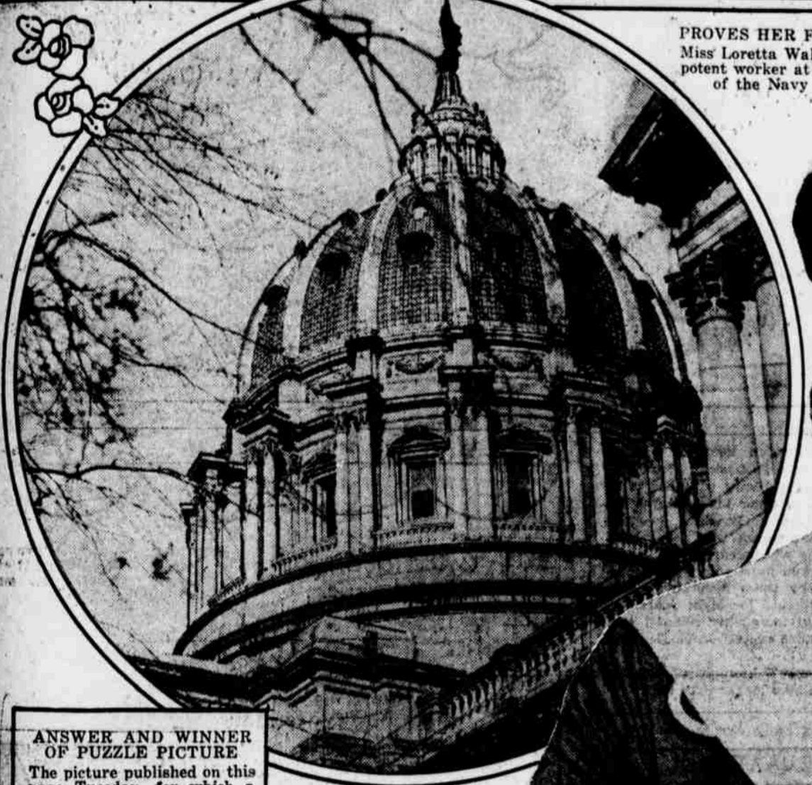
A DOME THAT HAS COVERED SCENES OF WAR DEBATE. This picture shows a portion of a public building. For the first correct identification mailed to the Pictorial Editor of the EVENING LEDGER a prize of $2 will be awarded.