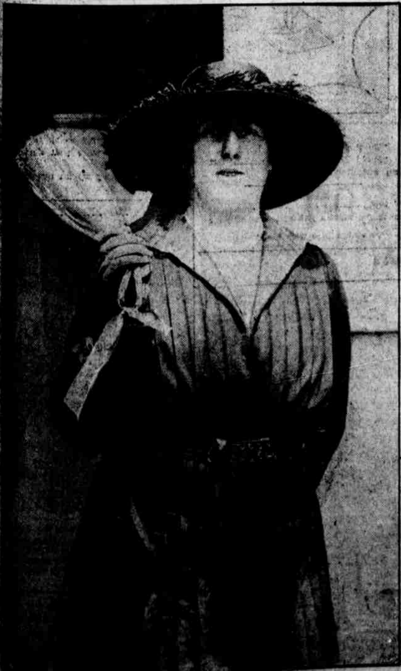
SPONSOR FOR HER FLOATING HOME The Commodore will leave this morning from the yard of her husband's business.