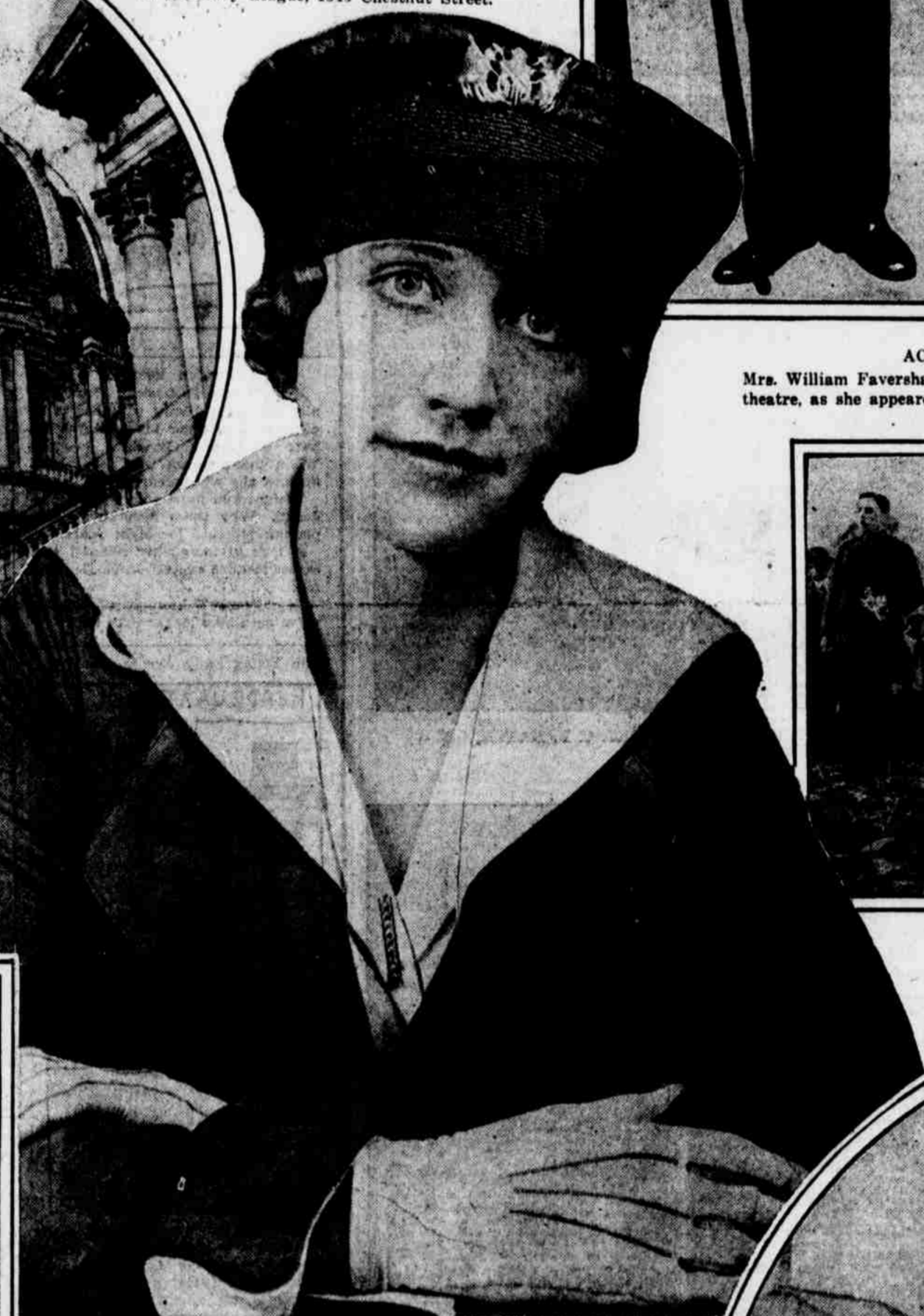
THEY STICK NO FEATHER IN THEIR HAT Nevertheless, Philadelphia women are demonstrating their "Yankee Doodle" sentiment by their headgear.