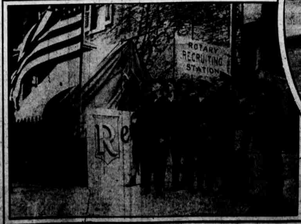
CAMDEN IS RESPONDING TO THE CALL TO THE COLORS A recruiting station has been established on Market street, and applications for service are encouraging those in charge.