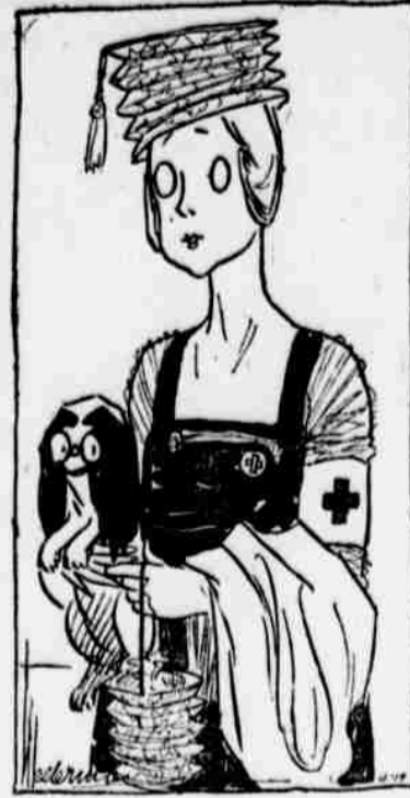
The Young Lady Across the Way

The young lady across the way says she overheard her father say one of his acquaintances was an anchorite, and what's he doing around here when trained men for the navy are needed so badly?