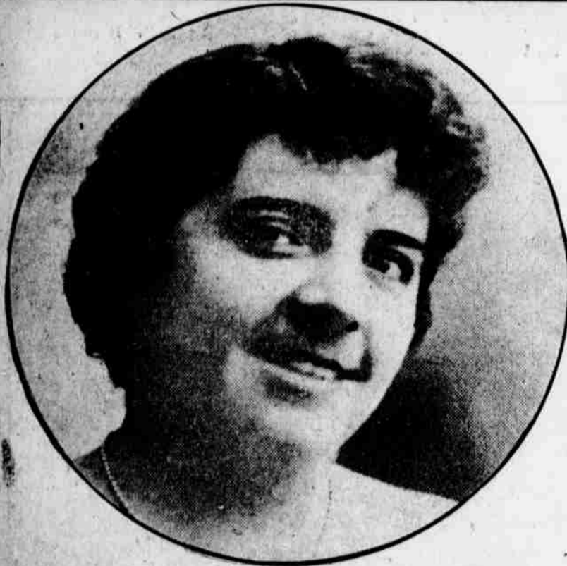
MME. MARIANA SEVA DE MENOCAL, FIRST LADY OF CUBA, WHO HAS SUMMONED WOMEN OF THE ISLAND REPUBLIC TO A RED CROSS CONVENTION