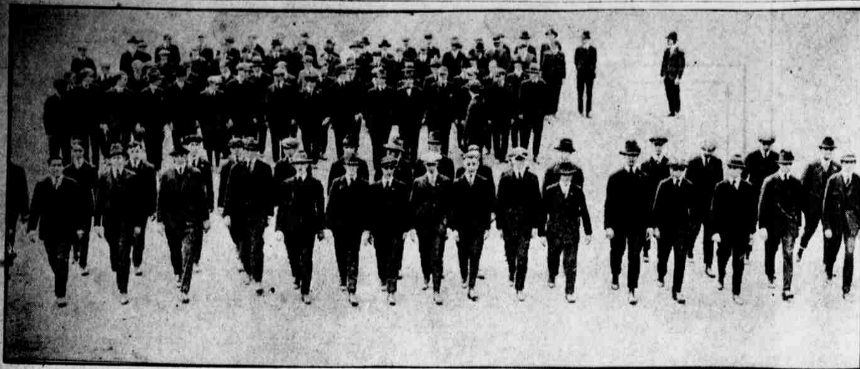
STUDENTS OF THE NORTHEAST HIGH SCHOOL DRILLING FOR A POSSIBLE SUMMONS FROM UNCLE SAM ON THEIR ATHLETIC FIELD AT THIRD STREET AND LEHIGH AVENUE