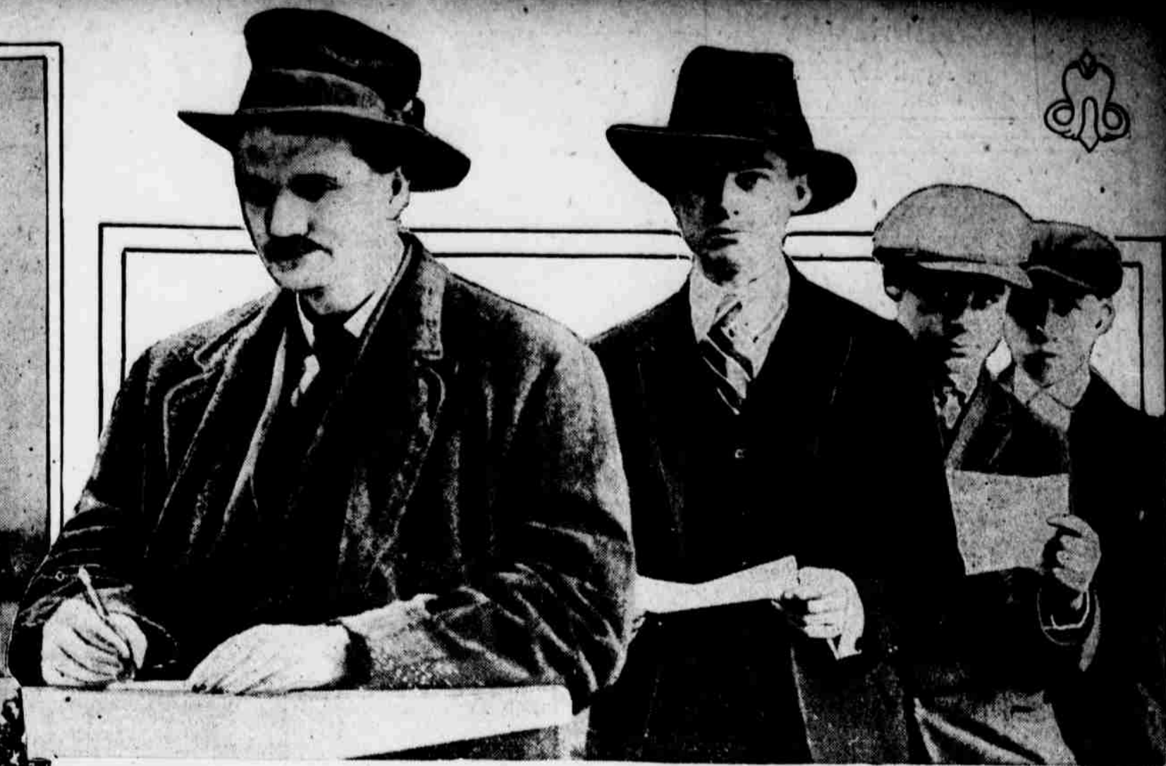
ENLISTING IN "SPRING DRIVE" UPON VIRGIN SOIL Candidates enrolling at the Bourse in campaign to cultivate 25,000,000 acres of arable but undeveloped land in the great Northwest.