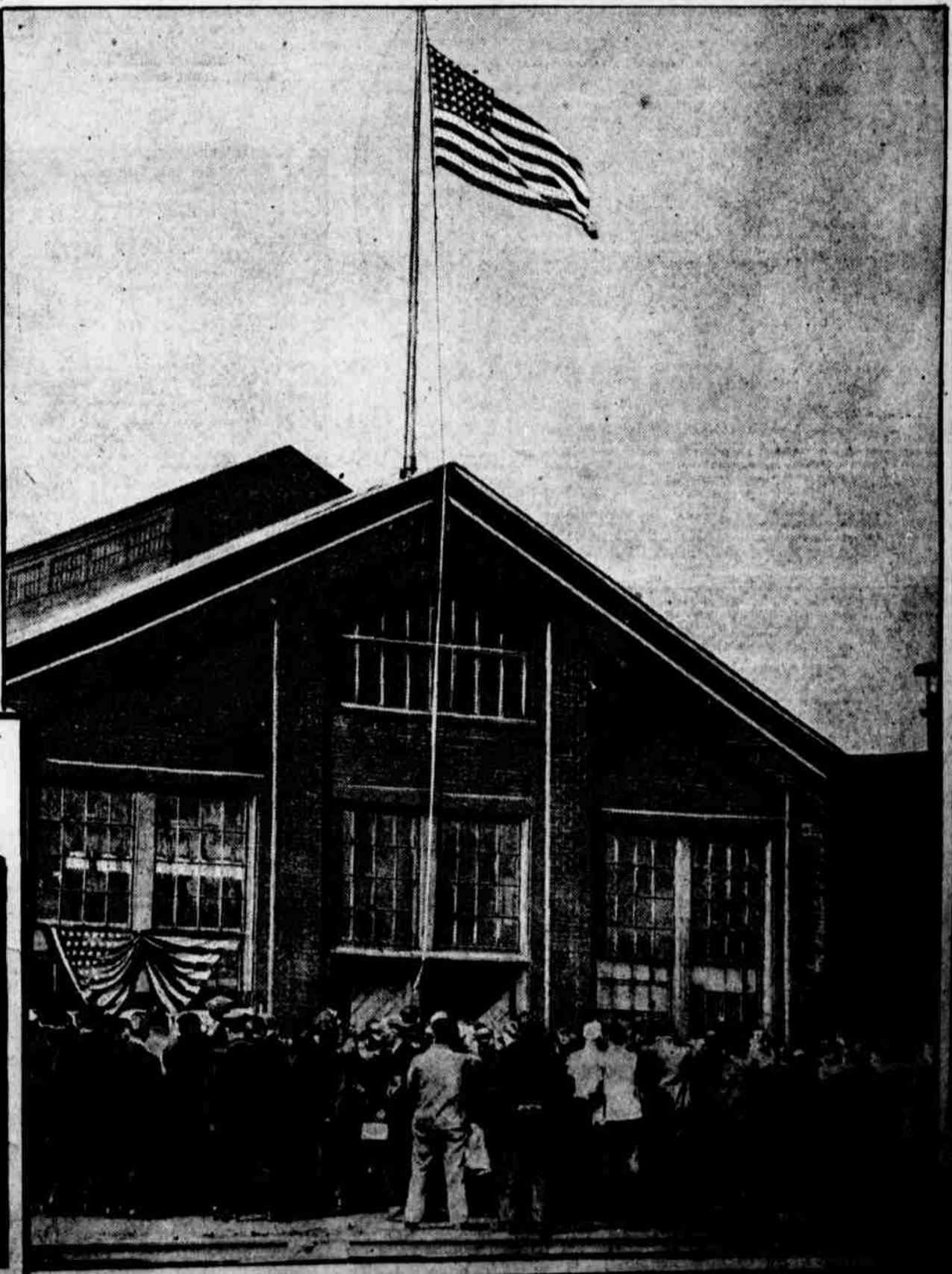
RAILROAD MEN SALUTE OLD GLORY Force of the Forty-seventh street yard of the Pennsylvania Railroad demonstrated their patriotism and loyalty.