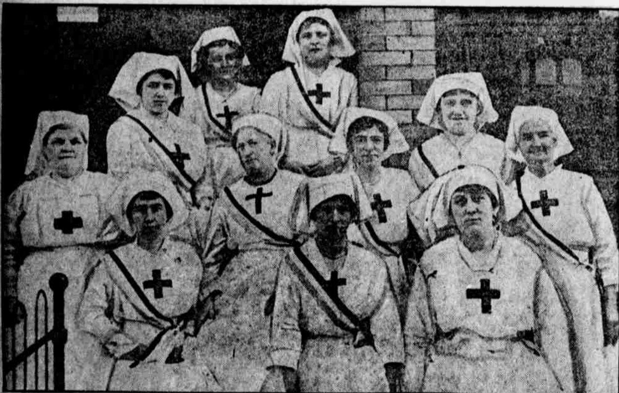
WARNCLIFFE BRITISH RED CROSS CLASS, OF GERMANTOWN, THAT IS WILLING TO DO THE BIDDING OF UNCLE SAM