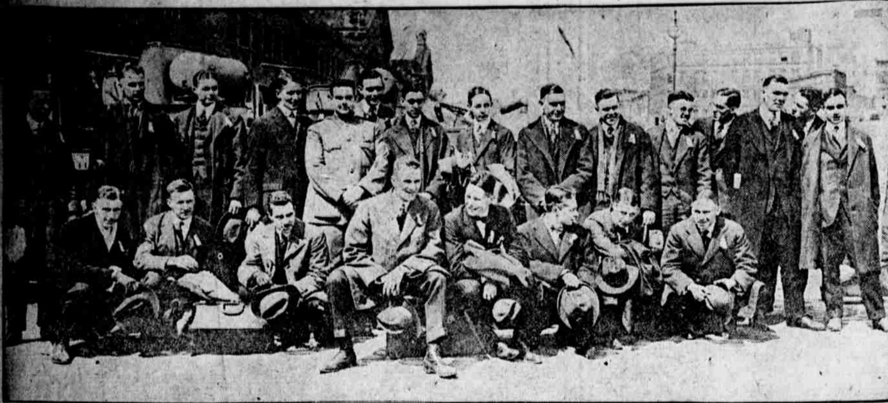
CORNELL DOES HER PART BY SENDING AMBULANCE UNIT TO FRANCE These trained college men, who are renouncing their studies to do active service "somewhere on the French front," posed for the photograph just before their departure late yesterday.