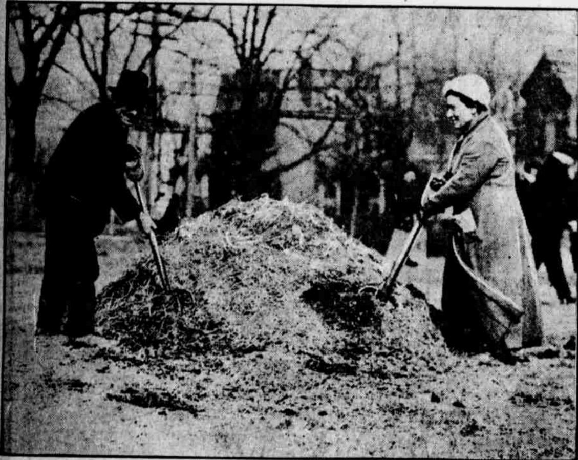
VACANT LOTS TO BECOME BLOOMING GARDENS The Vacant Lots Cultivation Association opened its season by parceling out land at the Davis farm, Sixty-fifth street and Elmwood avenue.