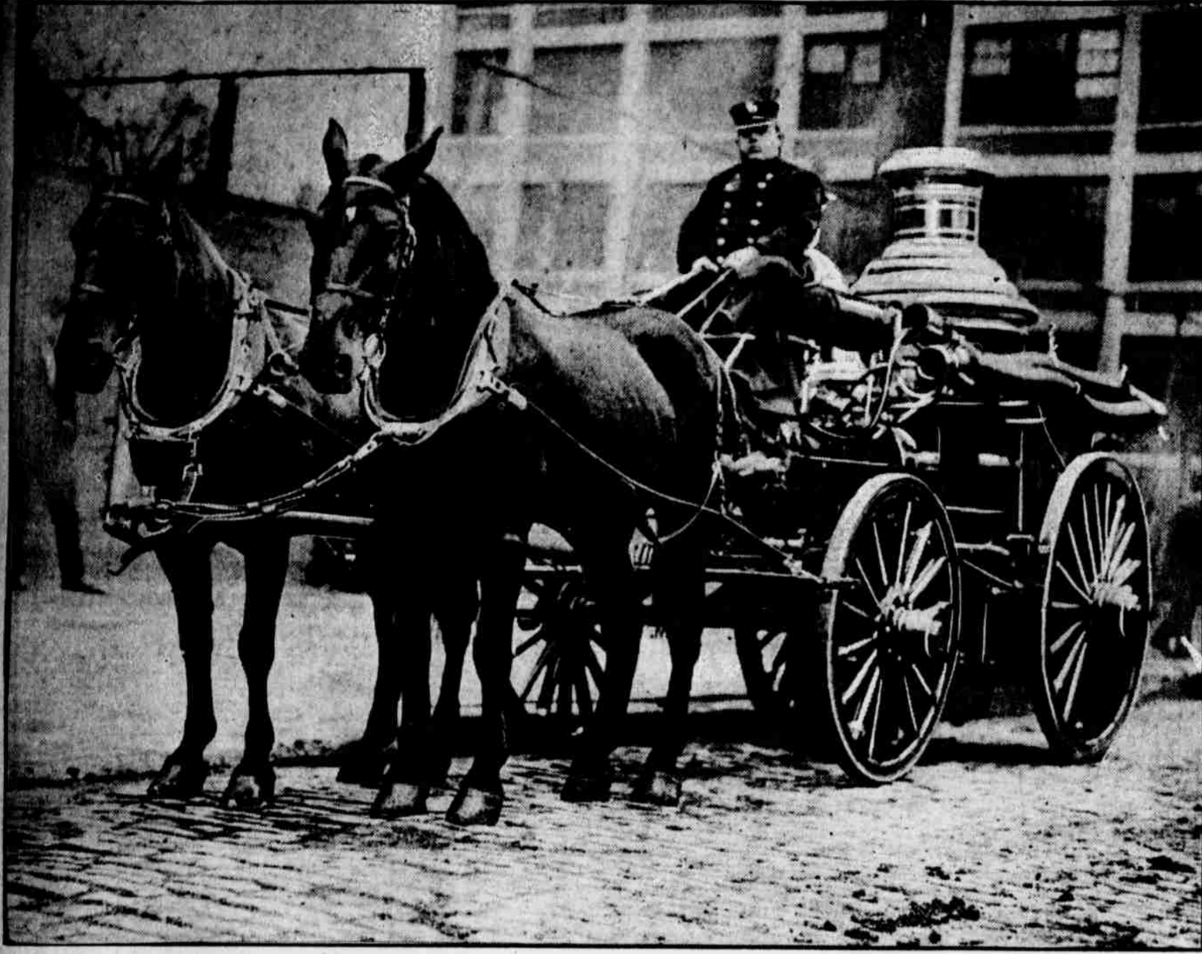
FAITHFUL FIRE HORSES CARRY OFF BLUE RIBBON AT INDOOR SHOW The proud winners are Bob and Buster, attached to Engine Company No. 28, Twenty-second street and Columbia avenue.