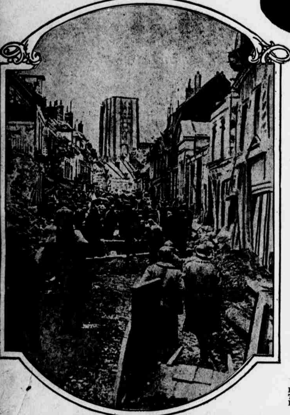
FRENCH ENGINEERS RUSH IN TO REPAIR HAVOC WORKED BY GERMANS IN CITY OF NOYON