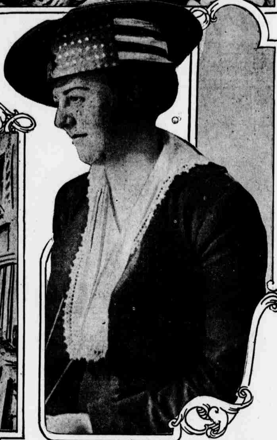
Underwood & Underwood.