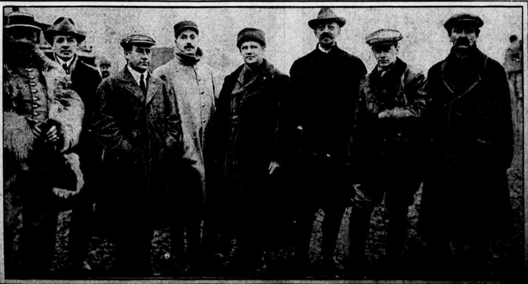
"BETWEEN CHAULNES AND NESLE"