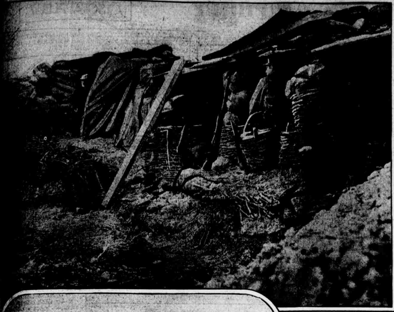
GERMAN FORTIFICATIONS BEFORE NESLE, TAKEN ONE HOUR AFTER FRENCH OCCUPATION