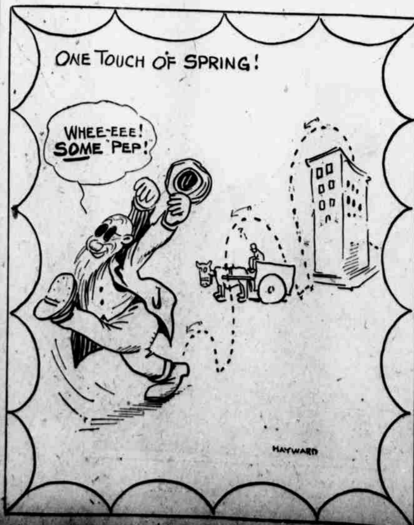
THE PADDED CELL

The Four-year-old—Mummy, do tell me another lovely fairy story like the one you told me yesterday, about when there were beautiful lights in the streets at night, and when little boys used to eat lump sugar.