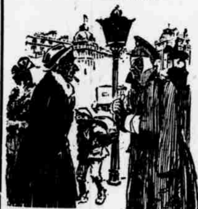
In Darkest London

"Hullo, old chap, sorry to see you've been bowled over. Somme?" "No." "Ah, Salonica?" "No, Strand!"