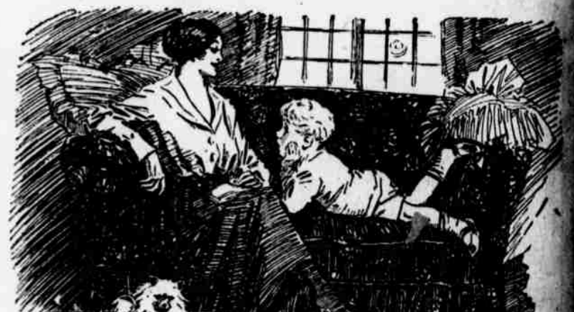
MORE JOYS OF WAR

The Four-year-old—Mummy, do tell me another lovely fairy story like the one you told me yesterday, about when there were beautiful lights in the streets at night, and when little boys used to eat lump sugar.