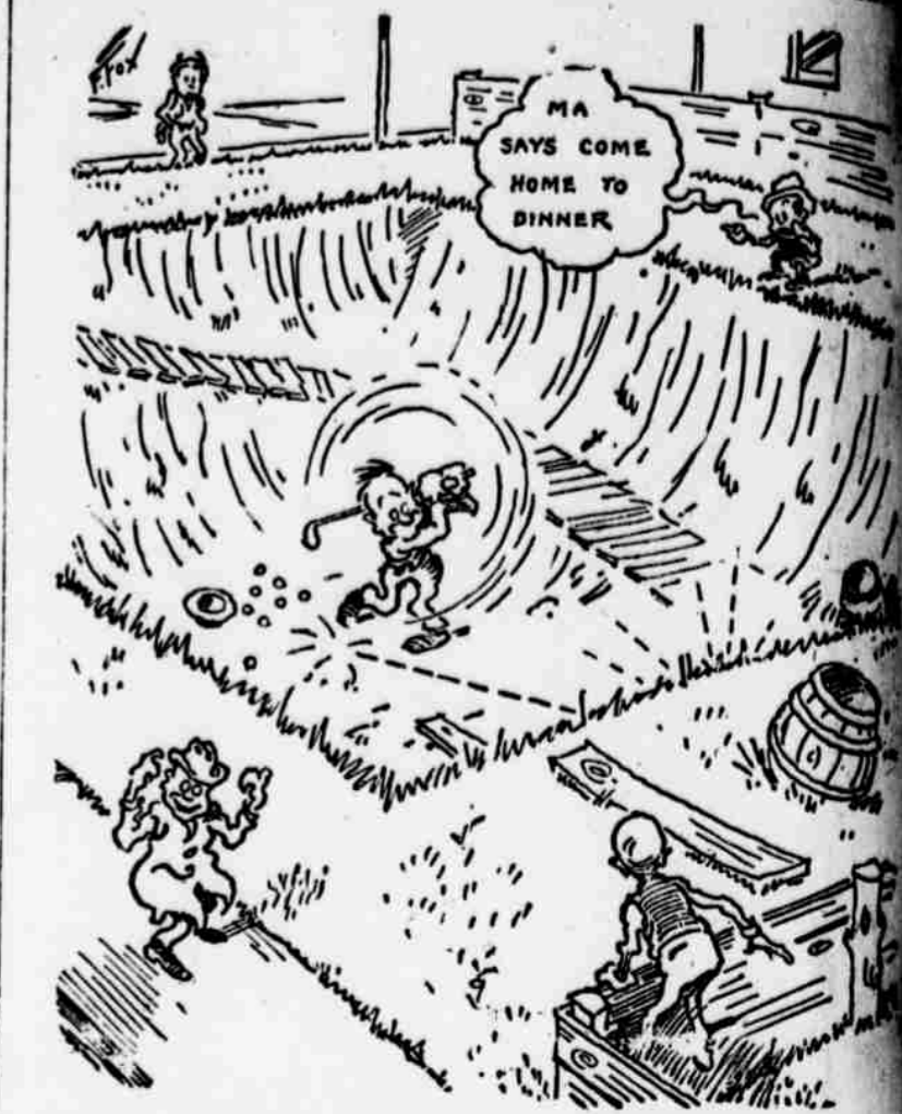
THE GOLF FIEND DISCOVERS A FINE PLACE TO PRACTICE DRIVING AND BRASSIE