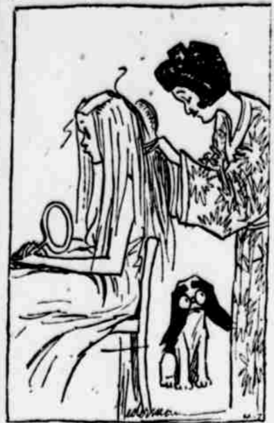
The Young Lady Across the Way

We asked the young lady across the way how the team seemed to be on inside baseball and she said she'd seen them play only outdoors.