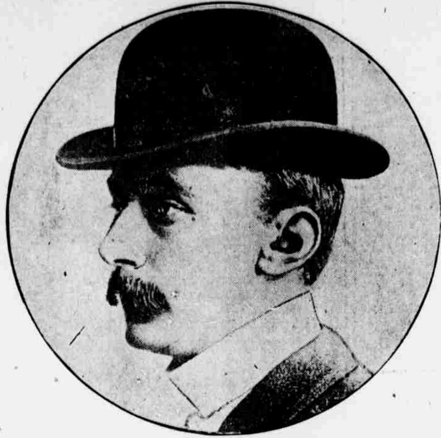
PROPOSES ANOTHER PEACE PLAN Count von Czernin, Austrian Foreign Minister, suggests a conference be held by the belligerents without cessation of hostilities.