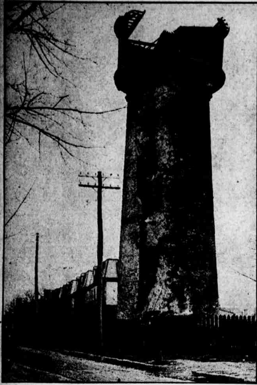
HISTORIC WATER TOWER ON NORWOOD AVENUE, BELOW GRAVER'S LANE, CHESTNUT HILL, WRECKED BY STORM