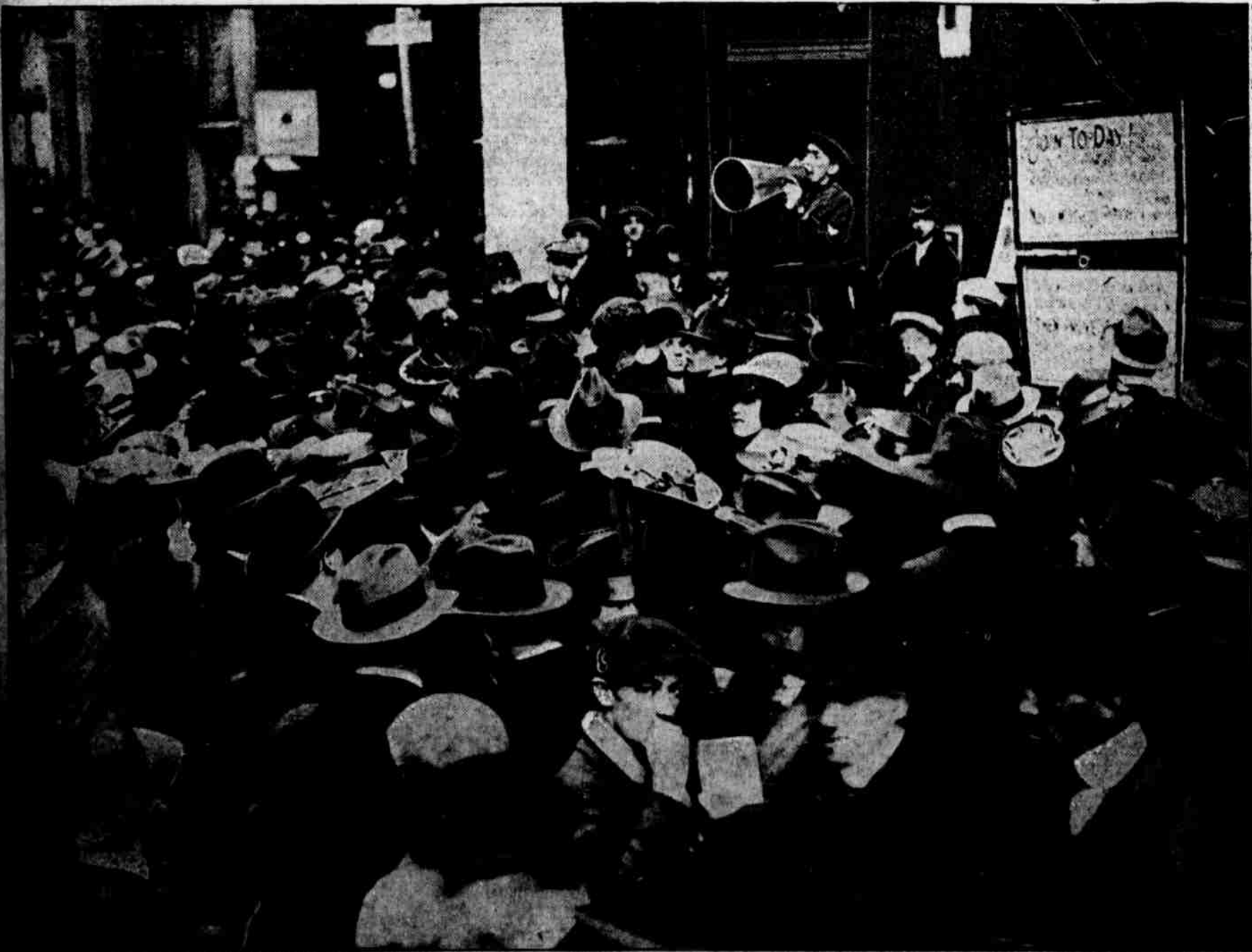
NAVAL RECRUITING STATION AT LEDGER CENTRAL DOES A LAND-OFFICE BUSINESS

THE TERRIBLE-TEMPERED MR. BANG WAS IN THE BATH WHEN HE DISCOVERED THOSE CHICKENS IN THE GARDEN