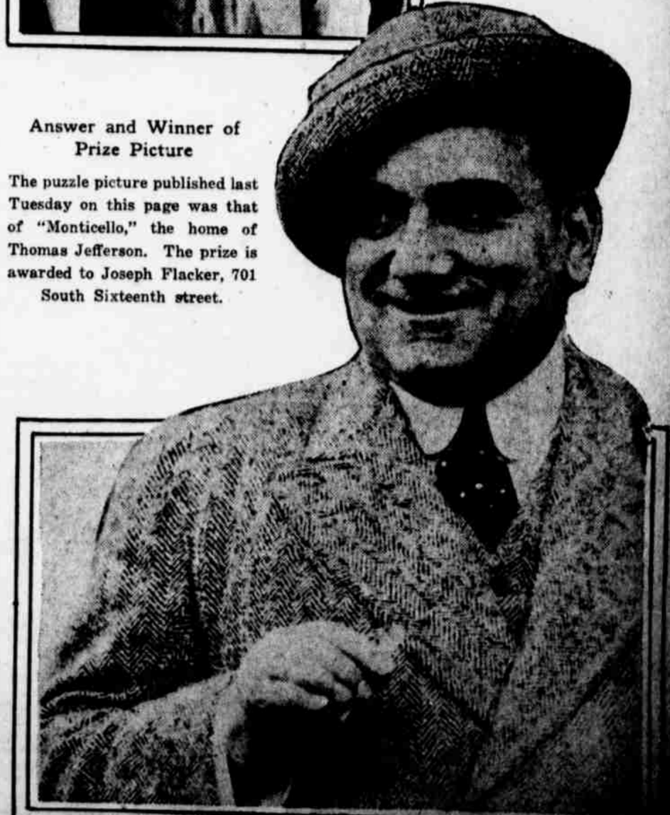
CELEBRATED IN 1880